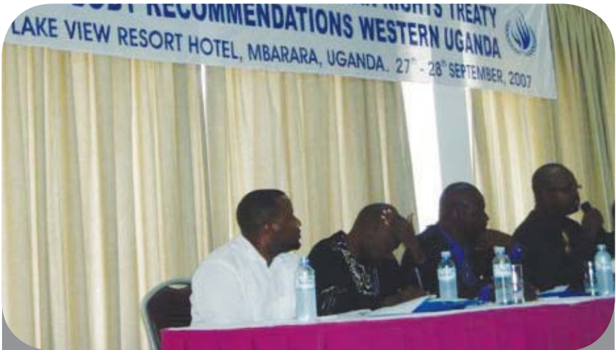
Government officials and civil society representatives speaking at a regional workshop, held in Mbarara (western Uganda) in September 2007, on the implementation of treaty body concluding observations in Uganda.

Reporting on the implementation in Uganda of the ICESCR is over 20 years overdue (Uganda's initial report was due in 1988) and reporting on the ICRMW is overdue by 12 years (Uganda's initial report was due in 1996). Uganda is also yet to submit a common core document in line with the guidelines for the common core document agreed by the meeting of human rights treaty body chairpersons. At the time of writing, the Government of Uganda had indicated it was compiling its initial reports under the CRPD and ICESCR.