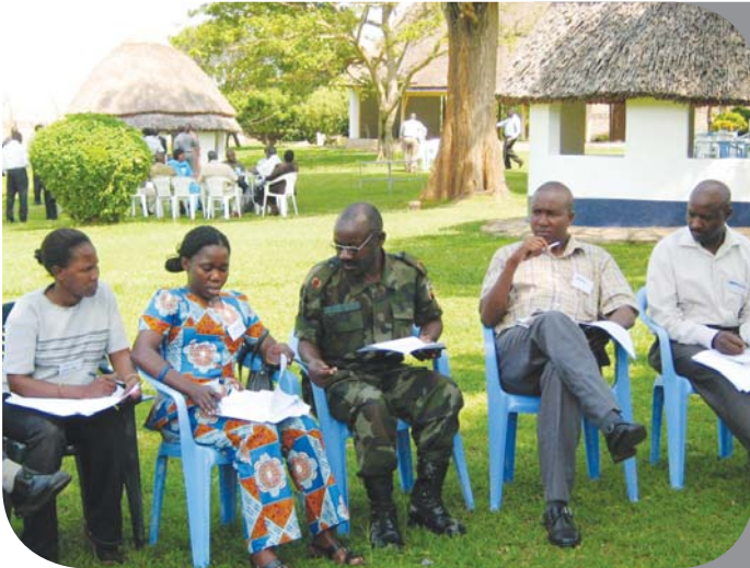
Participants at a joint UHRC-OHCHR workshop on implementation of concluding observations in Mbale (eastern Uganda) in 2007.

To learn more about the complaints procedures you can refer to Fact sheet No. 7/ Rev.1 on The Complaint Procedure, available at: http://www.ohchr.org/Documents/Publications/FactSheet7Rev.1en.pdf