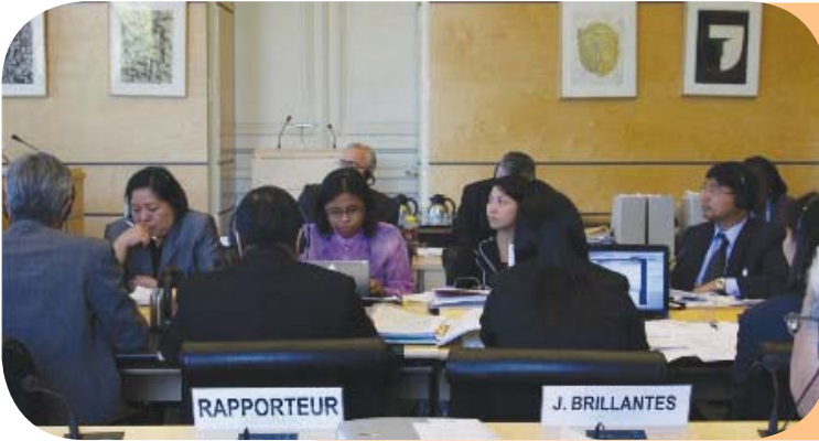
The Committee on Migrant Workers at its 10 th session, in Geneva 20 April to 1 May 2009. In December 2010, the Committee adopted its first General Comment on Domestic Migrant Workers.