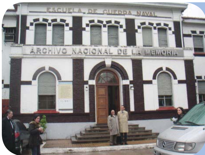
Members of the Working Group on Arbitrary Detention visiting a former detention centre in Buenos Aires during a mission to Argentina from 21 to 24 July 2008. 26