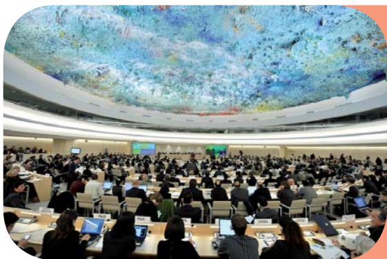
The Human Rights Council Room in the Palais des Nations in Geneva, where the Universal Periodic Review takes place.

The Human Rights Council is the principal intergovernmental human rights body of the UN and consists of 47 UN Member States. At the establishment of the Human Rights Council in 2006, the General Assembly mandated the Council to “undertake a universal periodic review, based on objective and reliable information, of the fulfilment by each State of its human rights obligations and commitments in a manner which ensures universality of coverage and equal treatment with respect to all States” (GA resolution 60/251). The resolution established that “the review shall be a cooperative mechanism, based on an interactive dialogue, with the full involvement of the country concerned and with consideration given to its capacity-building needs; such a mechanism shall complement and not duplicate the work of treaty bodies”.