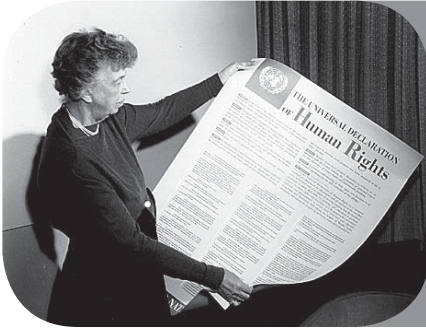
Mrs. Eleanor Roosevelt, chairperson of the UN Commission on Human Rights, holding a poster of the Universal Declaration of Human Rights, adopted on 10 December 1948.

On 10 December 1948, the United Nations (UN) General Assembly adopted and proclaimed the Universal Declaration of Human Rights (UDHR) as “a common standard of achievement for all peoples and nations”. It was the first international human rights document adopted at a universal level and has continued to provide a fundamental source of inspiration of national and international efforts to promote and protect human rights.