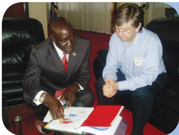
The Special Representative of the Secretary-General on Internally Displaced Persons, Mr. Walter Kälin, meets with the Minister for Relief, Disaster Preparedness and Refugees, Mr. Musa Ecweru, during a working visit to Uganda in 2006.

In their regular reports to the Human Rights Council, special procedures mandate-holders report on the number of requested country visits and the response by the Government(s) concerned. Special procedures also report on human rights violations by non-state actors. For example, the Special Rapporteur on the situation of human rights in Somalia reported, during 1996 to 2000, on abuses perpetrated by warlords and militia and also addressed actions by UN agencies in the absence of a central government in the country.