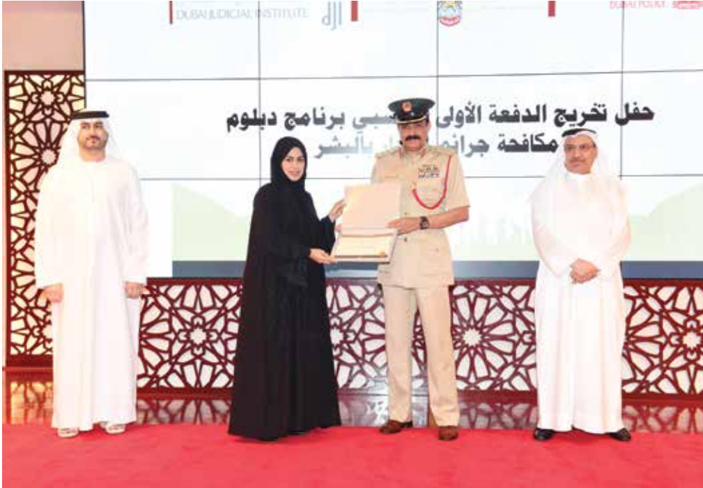
Awarding the first Diploma certificates on combating human trafficking

Since its establishment in 2009, the Centre has been playing a significant role in monitoring human trafficking crimes, by strengthening the preventive measures in order to reduce the crime. The center also has been working to detect, analyze, conducting research on, and provide strategic solutions to human trafficking. It is providing legal support to the victims, as well as implementing the laws against human trafficking