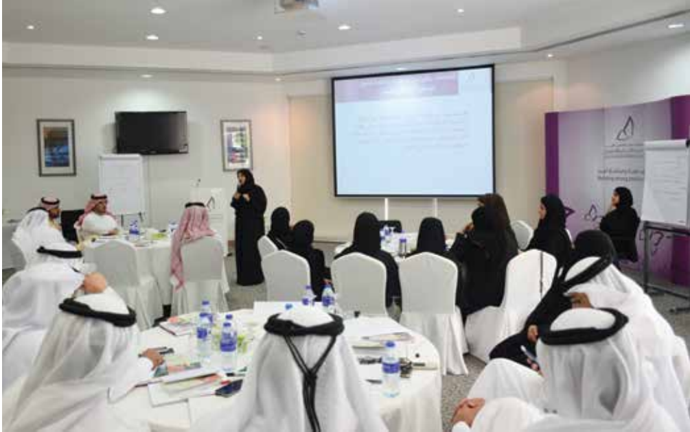
Training organised by the DFWAC on Human Trafficking

Dubai Foundation for Women and Children (DFWAC) is a licensed non-profit shelter in the UAE for women and children victims of domestic violence, child abuse, and human trafficking. It was established in July 2007 to offer victims immediate protection and support services in accordance with international human rights obligations. The Foundation provides free services to women and child victims of violence, child abuse, and human trafficking, including