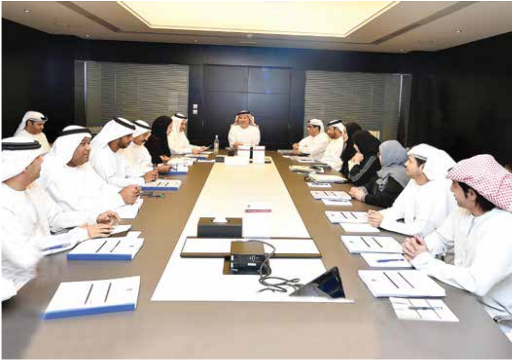
The regular meeting of the National Committee to Combat Human Trafficking Crimes.