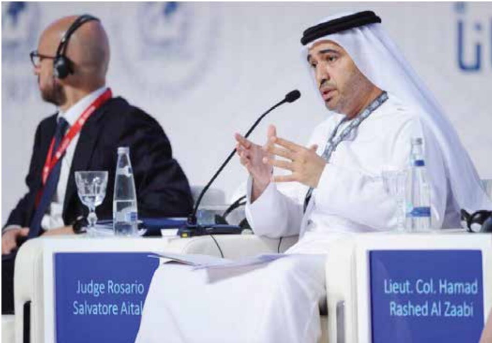
Ministry of Interior participation on Interpool conference

6) Following up on laws and local and international agreements on human trafficking crimes.