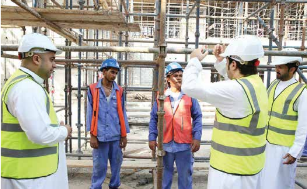
The Comprehensive Inspector Initiative launched by the Ministry