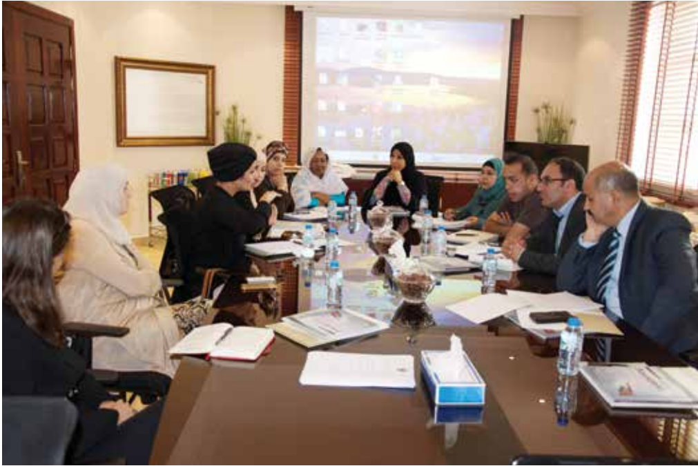
Meeting With A Delegation From The Hashemite Kingdom Of Jordan