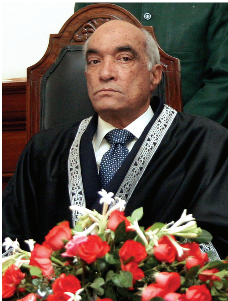
Khalilur Rehman Ramday, deposed Supreme Court judge.