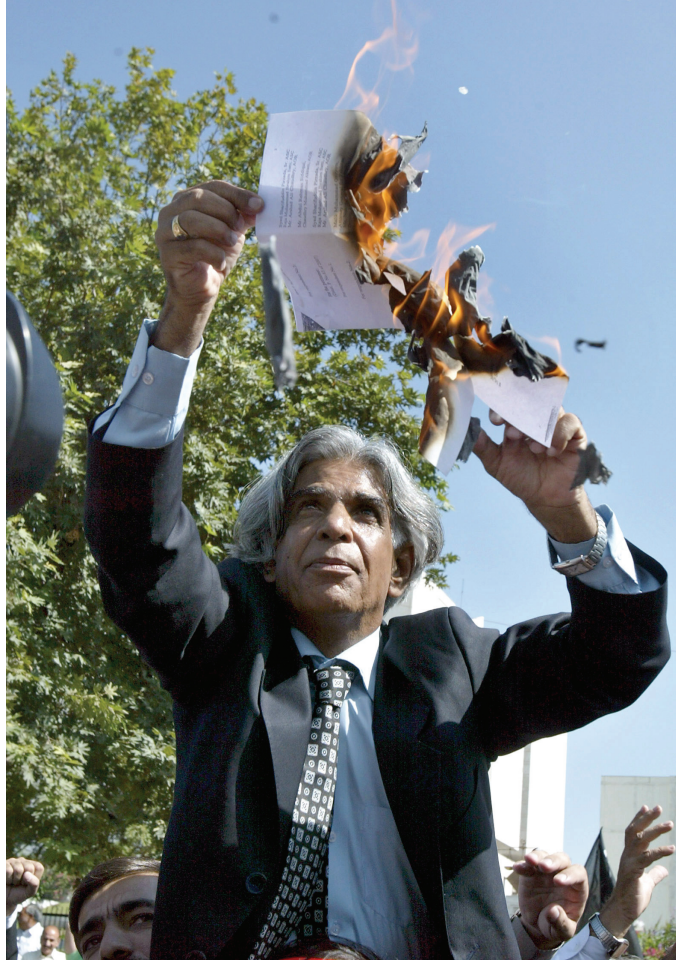
Ali Ahmed Kurd, a senior Pakistani lawyer and leading figure in the lawyers' movement for constitutional rule.