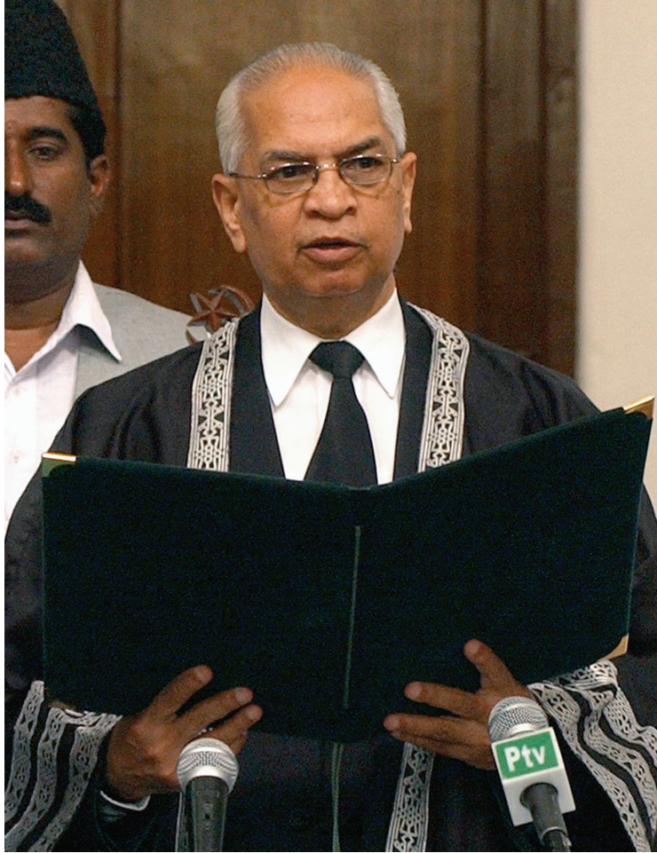
Deposed Senior Supreme Court Judge Rana Bhagwandas.