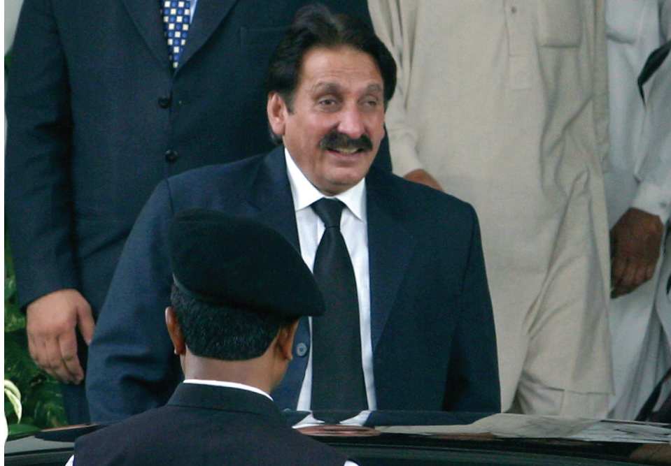
Deposed Chief Justice of Pakistan Iftikhar Mohammed Chaudhry.