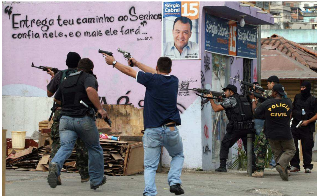
Members of the Civil Police fire into Vila Cruzeiro, one of the favelas that makes up the Complexo do Alemão, during an operation in August 2006. The operation reportedly resulted in three deaths, and one arrest. The religious graffiti on the wall reads, "Commit thy way unto the Lord, trust also in him and He shall bring it to pass..."

tackling police lethality is one of the key objectives for reducing overall violence in Rio de Janeiro. Amnesty International will continue to monitor the implementation of these measures.