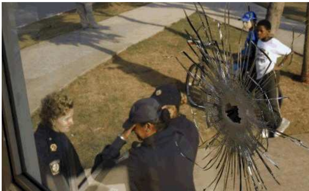
A bullet hole is seen in a police station attacked by members of the PCC in São Paulo, Brazil, in May, 2006.

gubernatorial elections it was feared that the politically opposed federal and state governments were making vital security decisions with a view to the polls rather than to guaranteeing peace in the state.