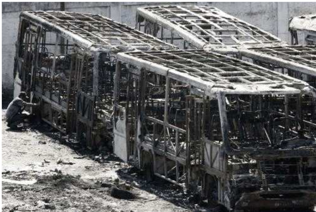
Burnt remains of buses following attacks by the PCC in São Paulo, July 2006.

businesses and shopping centres closed, public transport shut down, school children and university students stayed at home.