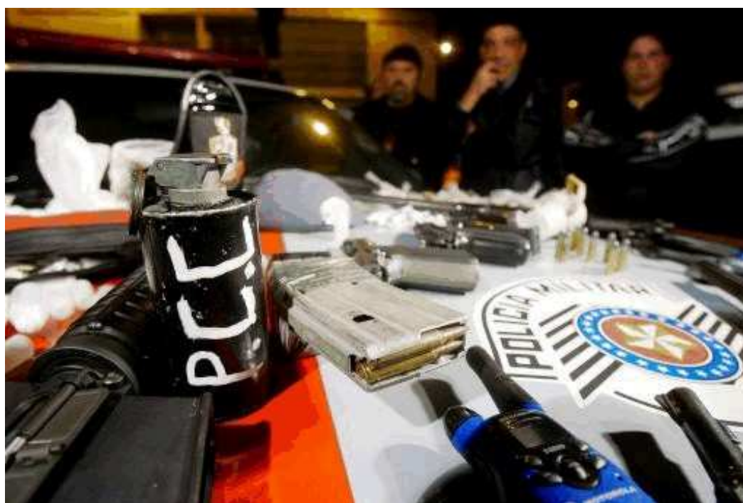
A grenade and several guns captured by the police from suspected members of the PCC during the attacks in São Paulo, in May 2006.

high security detention centre in the interior of São Paulo, in the wake of Brazil's worst ever prison massacre in which 111 prisoners were killed by members of the military police in São Paulo's Carandiru prison. 10 From its inception the PCC claimed to be campaigning in defence of prisoners' rights, including an end to torture, guaranteeing prisoner visits and decent conditions for inmates, but in time it developed into an organised crime outfit, involved in gun-running, drug trafficking, money laundering, prostitution, kidnapping and bank heists. According to accounts from lawyers, journalists and human rights groups the gang was able to grow dramatically within the prison system as it offered detainees a form of security that the overcrowded and understaffed prison system was unable or unwilling to provide. Using a diffuse cell structure and forcing recruits to pay monthly contributions – said to be R$50 a month for those in prison, rising to up to R$500 for those who have been released – the PCC grew in strength and resources.