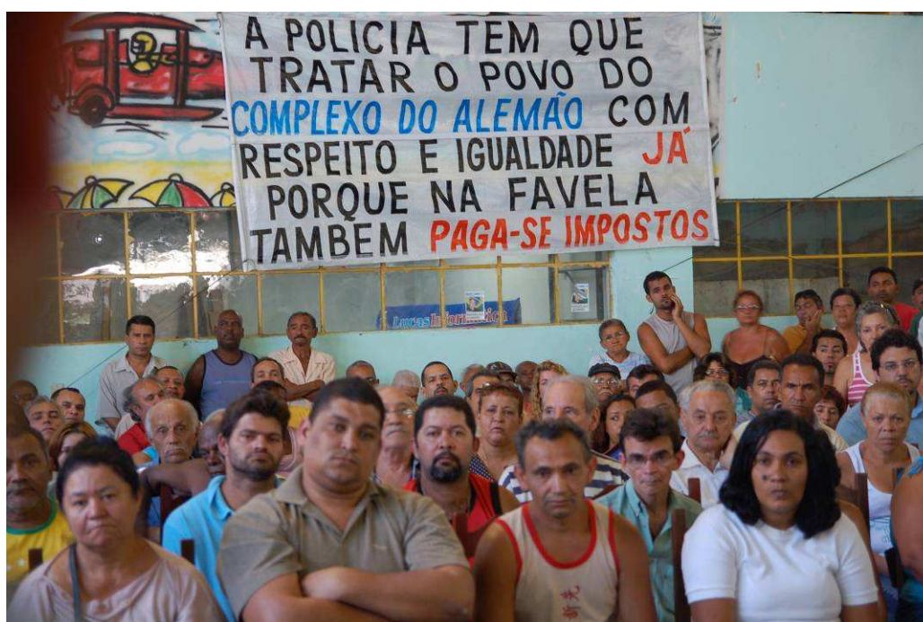
Residents of the Complexo do Alemão meet, in October 2006, to protest against police violence and human rights violations during invasive operations. Behind them the banner says, “The police has to treat the population of the Complexo do Alemão with respect and equality because favela residents also pay taxes.”

Policing in Rio de Janeiro continues to be characterised by large-scale operations in which heavily armed police units “invade” favelas only to pull out once the operation has been completed. These operations come at a great cost to communities with little in return. They place the lives of all, including the police, at risk. Damage to property and infrastructure, the closure of businesses and curfew-like conditions preventing people from going to work and studying, impose financial and social costs long after the operation is over. Once the police withdraw, drug factions or militias resume control. The underlying problems - social exclusion, criminality - are left untouched while the community is buffeted by waves of both criminal and police violence.