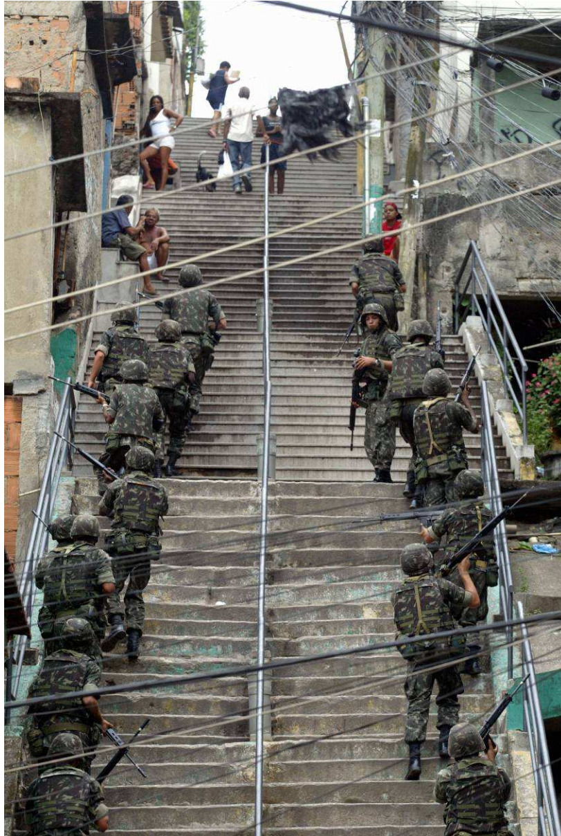
Members of the armed forces patrol in the morro da Providência favela in the centre of Rio de Janeiro in March 2006.

government nor the state government requested the operation but nor did they contest the army's right to take on a role for which they had no mandate, training or oversight.