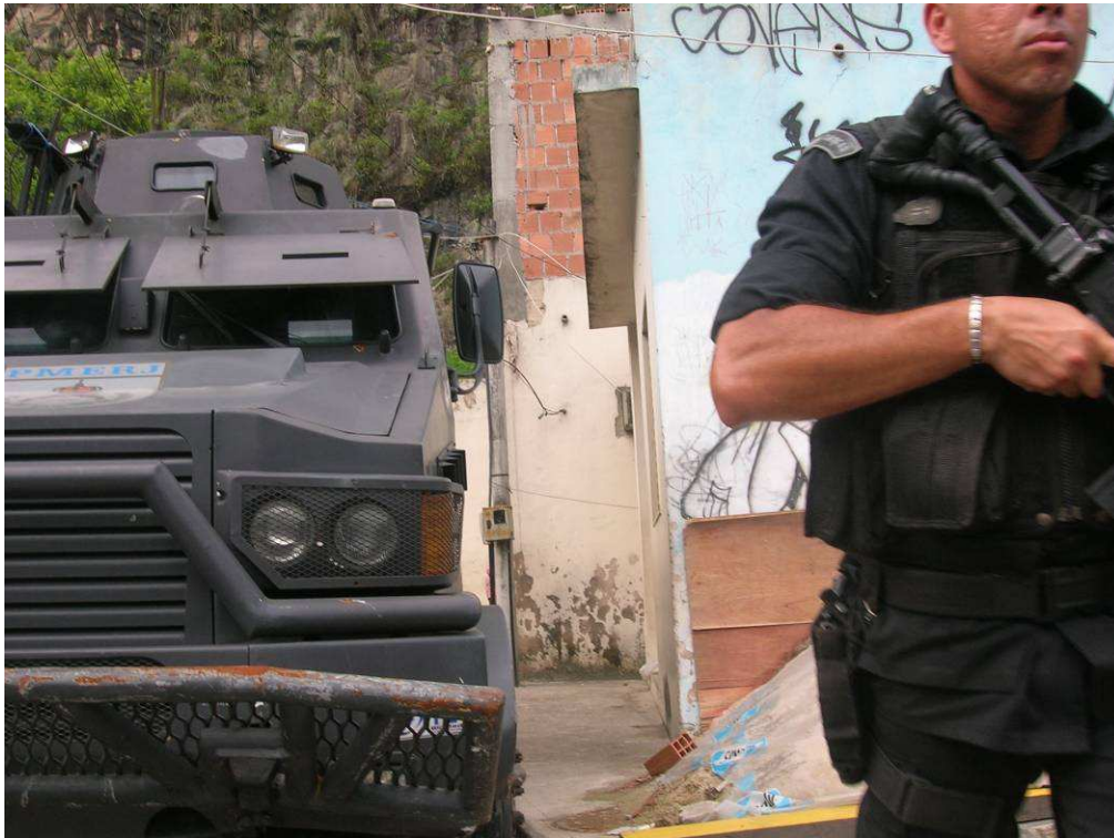
A member of the Rio de Janeiro State Police Special Operations Battalion (BOPE) stands guard next to an armoured vehicle, popularly known as the caveirão in the Morro da Fé favela.

militaristic approaches to public security, including the sporadic use of the armed forces. Corruption and criminality remained embedded in law enforcement agencies. And in a more recent development which threatens to further destabilise the city, para-policing groups' or " milícias " have begun contesting control of favelas in the vacuum left by the state.