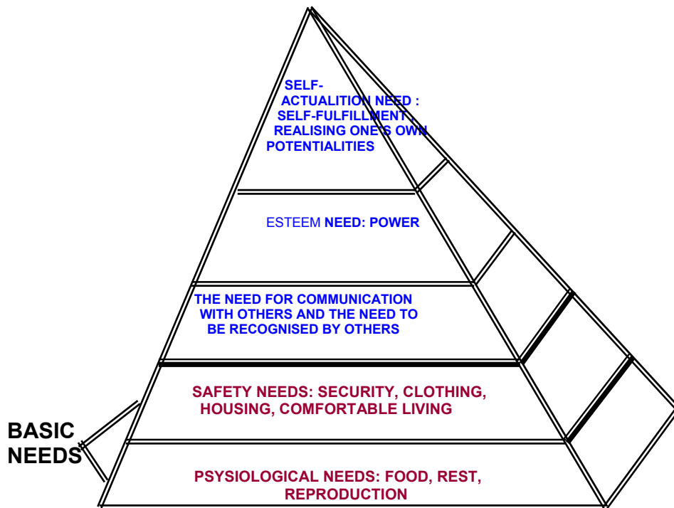
Diagram 1: Pyramid of Needs, A. Maslow