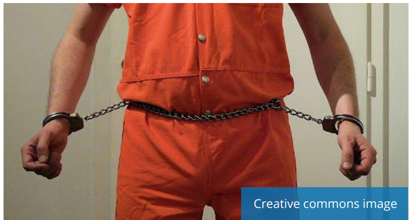
Creative commons image