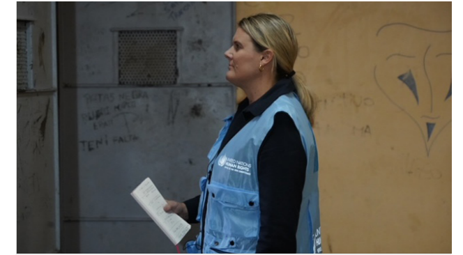
Official Visit to Chile.

In 2023 the Special Rapporteur was invited by the Government of Chile to speak at a Human Rights Council side event, "50 years after the Military Coup: Chile and the United Nations mechanisms to support victims of torture, enforced disappearance and extrajudicial executions", where she spoke about the legacy and lessons for the United Nations' anti-torture architecture from the darkest period in Chile's history.