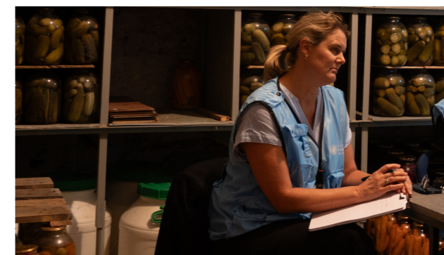
Official Visit to Ukraine