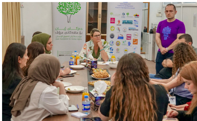
Study visit in Northern Iraq