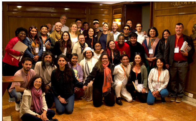
'Hearing for Healing' in Bogota, Colombia