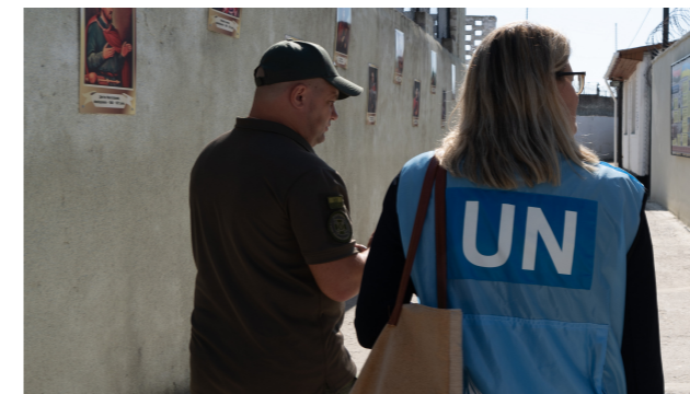
Official Visit to Ukraine