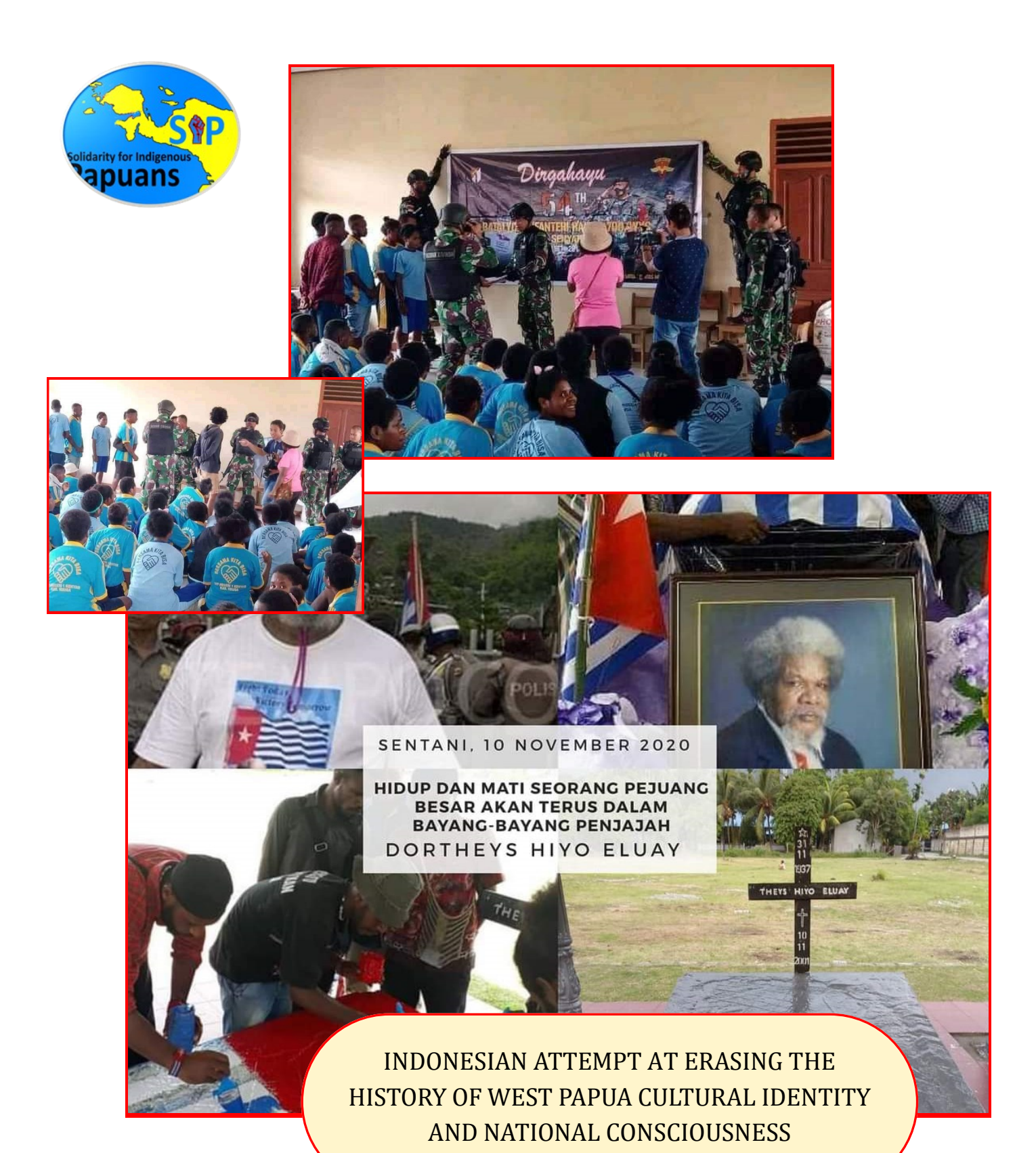
Photo No. 1 & 2: Indonesian military in one of the schools in Jayapura putting up posters in the classroom indoctrinating students.

Photo No. 3: The Tomb Stone of West Papua leader Theys Eluay murdered by Indonesian Intelligence in 2000 was painted by Morning Star flag but the Indonesian military repainted it (to the right). West Papuans are painting again after the destruction (left), November, 2020. The destruction of tomb stone engravings are occurring throughout the region, Indonesian military and police go into graves and deface the graveyards of West Papuan leaders. In 2020 alone, they defaced a graveyard of a West Papua National Committee Leader in Yahukimo and the tomb of Yudas Kogoya in Nduga one of the military commanders of the West Papua National Liberation Army.