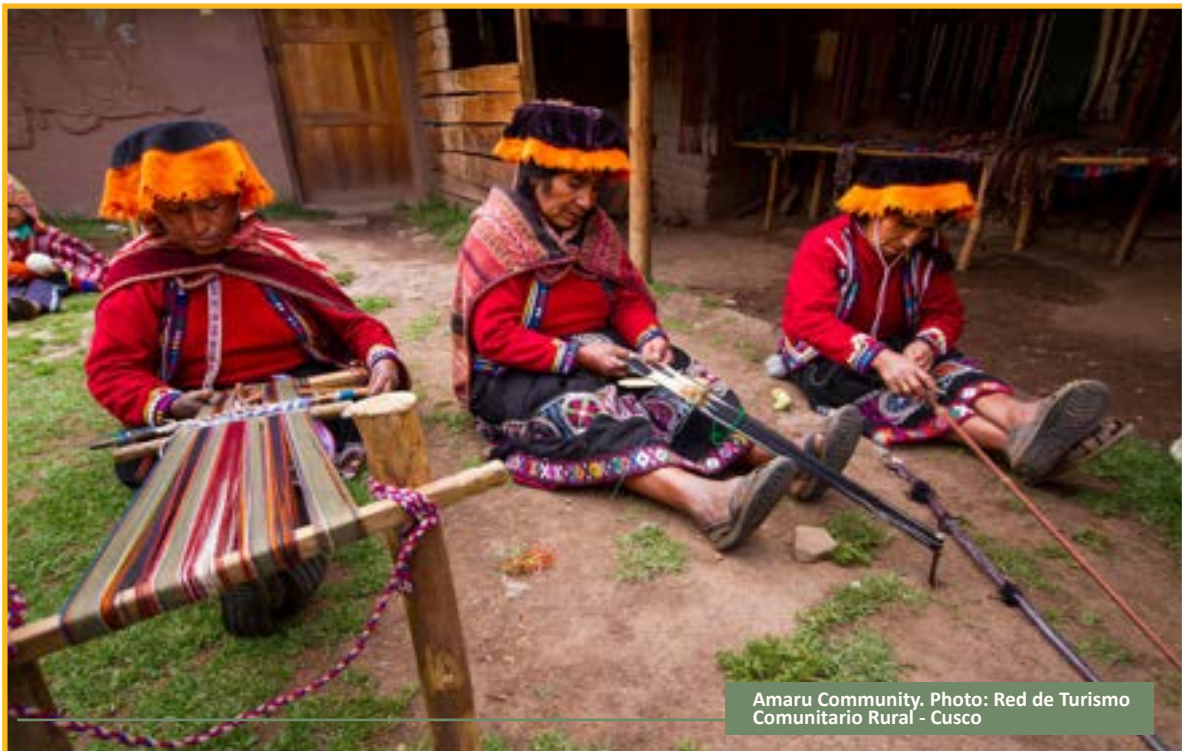
Amaru Community.