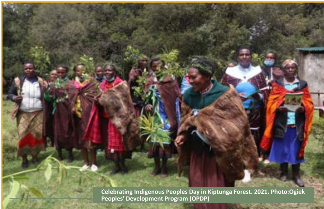
Celebrating Indigenous Peoples Day in Kiptunga Forest. 2021.

The Samburu community in Northern Kenya has experienced displacement and human rights violations due to the expansion of conservancies on their lands and territories. In 2014, the Samburu community was forcibly evicted from their ancestral lands in the name of conservation, with private companies and NGOs operating the conservancies denying them access to water and grazing lands. 10 This situation has resulted in significant challenges for the Samburu community, who depend on these resources for their livelihoods and cultural practices.