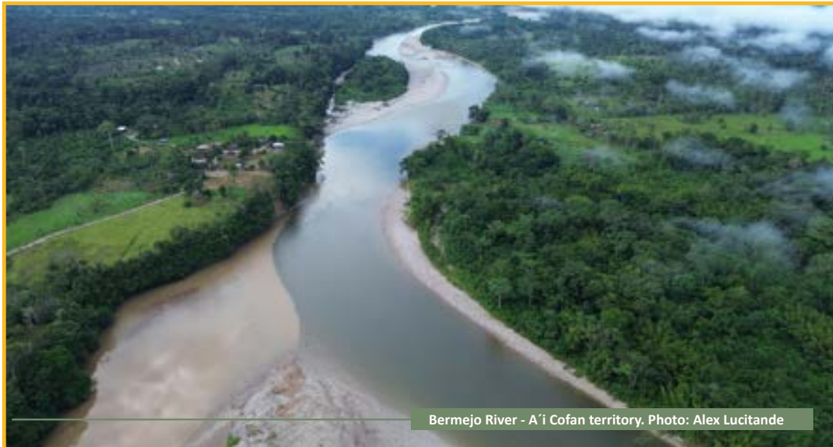
Bermejo River - A'í Cofan territory.

Historically, the indigenous peoples of Latin America have been victims of highly exclusionary nation-state and territorial planning projects that have prevented or structurally restricted the full exercise of their political, economic, social and cultural rights.