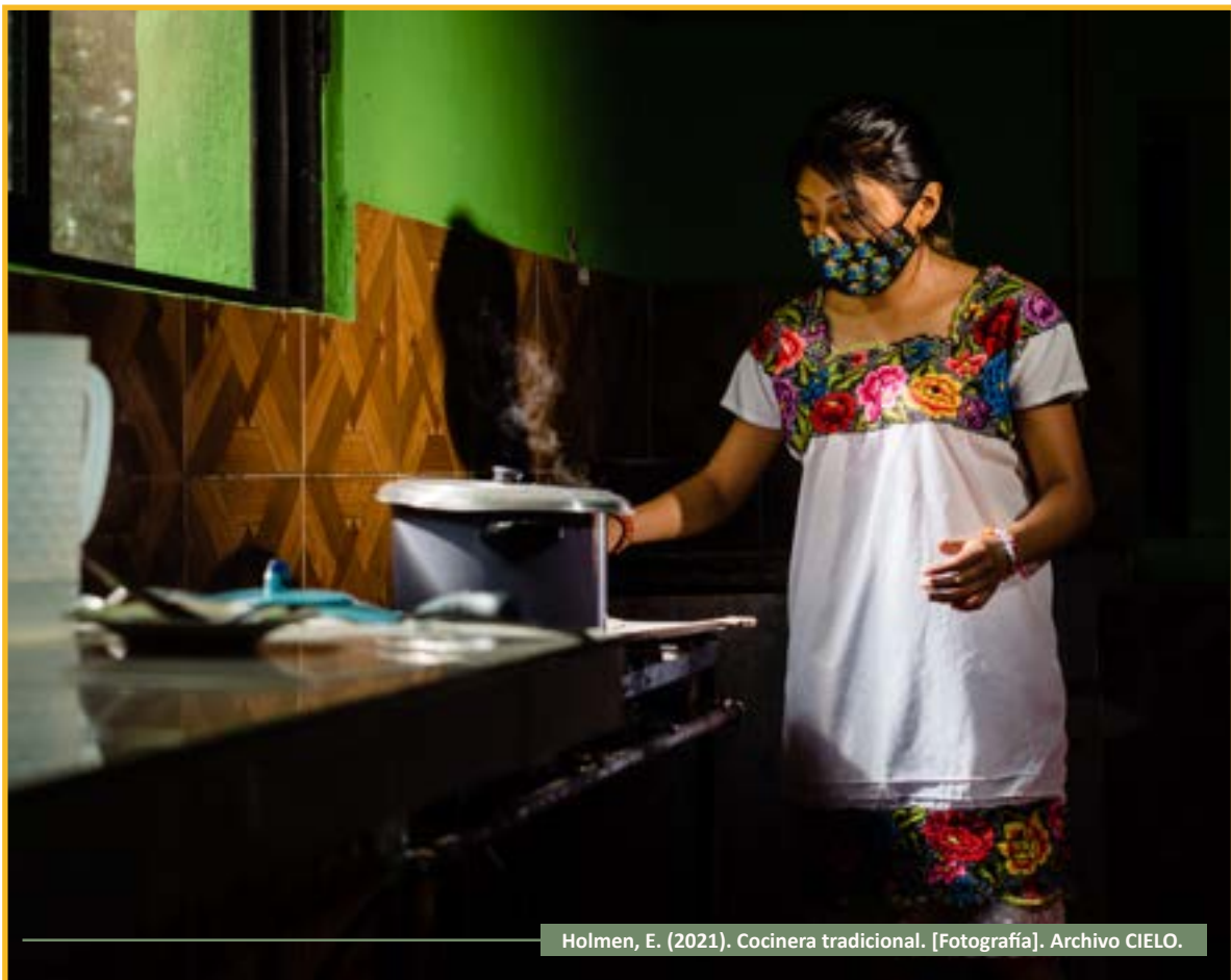
Holmen, E. (2021). Cocinera tradicional. [Fotografía]. Archivo CIELO.

And what happens if the community itself works for the company? From the outside, various benefits can be observed such as professional training and education; however, the problems they cause are far greater, for example, lower wages for local workers versus external workers, deculturalization of the destination, extreme commercialization of local traditions, incivility, gentrification, etc. This situation turns us, the Indigenous Peoples, into objects, because we dress, dance, sing, and generally act and are seen and viewed only as merchandise for tourist consumption.