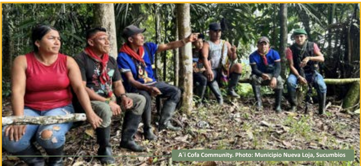
A'í Cofa Community.

b) Right to prior consultation: the constitutional framework, and a good part of the legal framework, recognizes the right of indigenous peoples and communities to be consulted and to give their prior and informed consent before any activity or project that may affect their territories and resources, including tourism operations and projects.