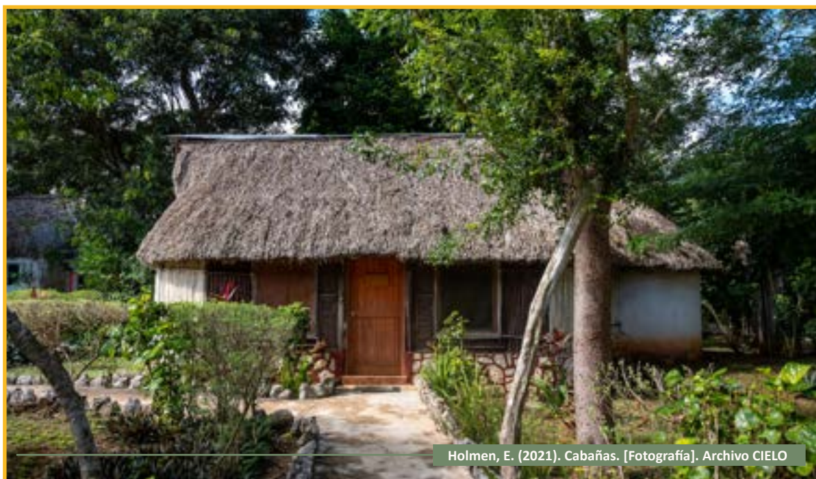
Holmen, E. (2021). Cabañas. [Fotografía]. Archivo CIELO

Of the 99.08% Indigenous inhabitants in the community of Ek Balam, 76.23% speak the Indigenous Mayan language (Pueblos America, 2020). Continuing to support the creation of Indigenous businesses will mitigate migration and thus contribute to the social and cultural fabric, preserving and nurturing governance as a path for the development and Good Living of our peoples.