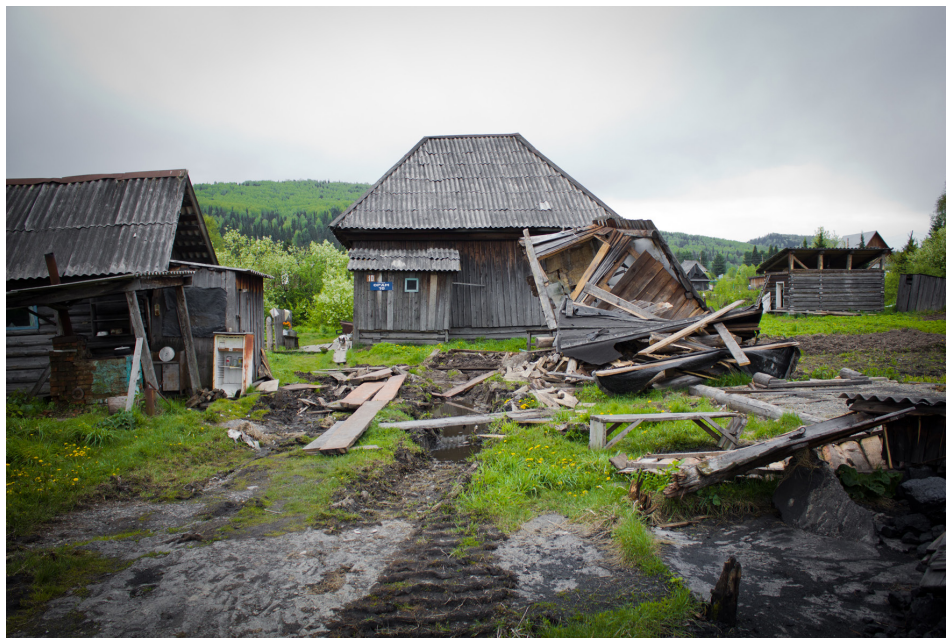
Destroyed houses of the inhabitants of the Kazas village

These threats were realized: between November 2013 and March 2014, the homes of people who did not agree with the sale were burned down by unidentified people. Criminal cases were opened, but the guilty parties were never found, even though the only way to enter the territory was through a checkpoint equipped with video cameras, which should have been able to record the arsonists' arrival: