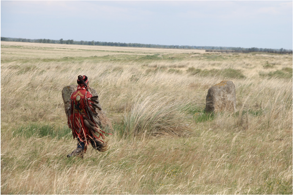
Chaatas in the Koybalskaya steppe of Khakasia.

In 2013–2014, the Shor village of Kazas was destroyed by a coal company. Even though a cemetery was located on the territory of this village, entry was closed to any visitors. A checkpoint and security were installed at the entry to the former village, and the Shors cannot freely visit the graves of their loved ones. The situation has not changed in spite of numerous complaints to Russian and international bodies.