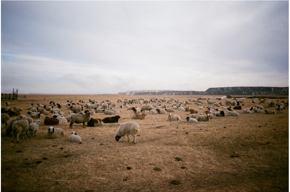
Pasture with the coal waste piles at the background, Aal Khizil Salda of Altai district of Khakasia.

On March 15, 2019, the Subsoil Use Department of the Central Siberian District published an order concerning the seizure of 36 land plots for the state needs of the Russian Federation in connection with the use of subsoil. Thus, by falsifying the results of the public hearings, neither the coal company nor the regional authorities obtained the de facto consent of the local population to make amendments to the locality's general plan and Mayrykhsky Mine did not have the right to seize the territories. The prices offered by the coal companies for the plots were below their cadastral values. The owners were not offered any additional payments over these amounts. This meant that people working in agriculture and providing for themselves and their families in this way were forced to cut back on or entirely liquidate their farming activities: