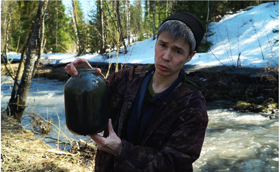
Water from the Bolshoy Kiyzas River.

The Bolshaya and Malaya Tetenza rivers are regularly polluted by coal dust from the industrial road laid along the ridge that separates the two rivers. Coal dust covers the ground up to hundreds of meters from industrial roads; this dust then enters rivers from the soil. As required by law, coal collection canals have been built along the roads, but all they do is collect dirt and discharge it back into the Bolshaya Tetenza.