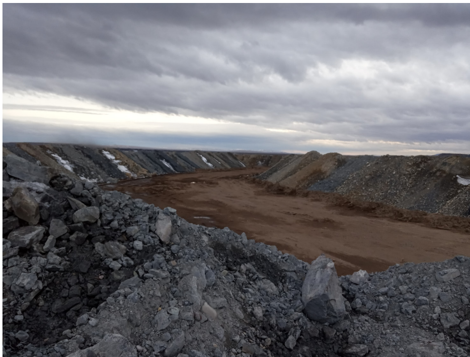
Coal waster piles near the village of Shalginov.

In addition, the exploitation of coal leads to the formation of waste piles of overburden - artificial embankments consisting of coal production waste and the waste rock that covers coal deposits and is removed during open-pit mining. The waste piles, like the pits themselves, have forever destroyed the thin, fertile layer of steppe soil and are laying waste to the exceedingly fragile ecosystem of Koybalskaya Steppe. Environmentalists estimate that the over 1,000 hectares of land on the steppe have been disturbed by the exploitation of coal deposits.