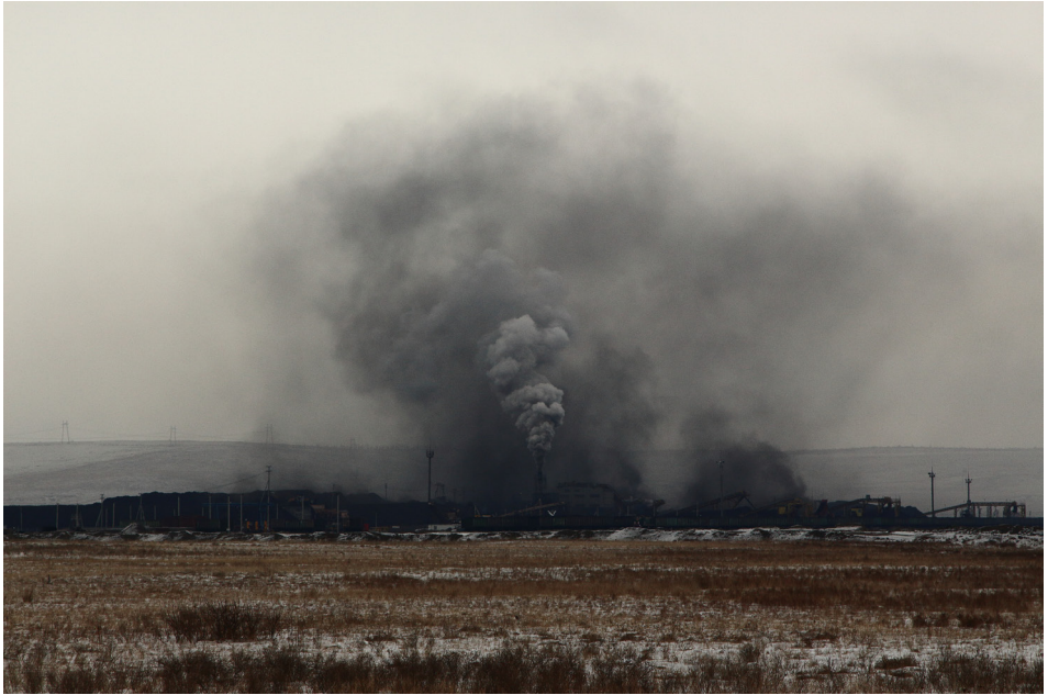
"Coal Dragon" of Mayrykhsky Mine.

"You can barely see them during the day, but there's still a lot of dust. I rode my horse on the steppe today. My workers didn't recognize me when I returned to the aul. My whole face was black from the coal dust, like a miner. Only my eyes and teeth were visible. At night, when the "dragons" are turned all the way up, enormous clouds of dust fly across the steppe. If you go out on the street and look at the streetlamp, you can see black flakes. In the morning, the snow and grass are black. When we spoke with representatives of the mines and complained that we were suffocating from the coal dust, the deputy director of Arshansky told us that the coal dust had the same effect as activated charcoal tablets. (Resident of Shalginov Village. Interview with ADC Memorial, March 16, 2020.)