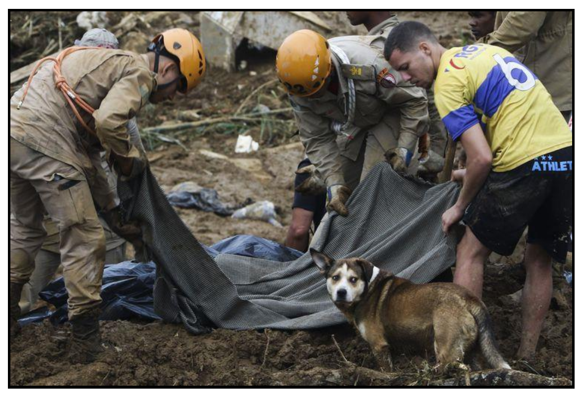
* Rescuers during an operation in Petrópolis (2022).