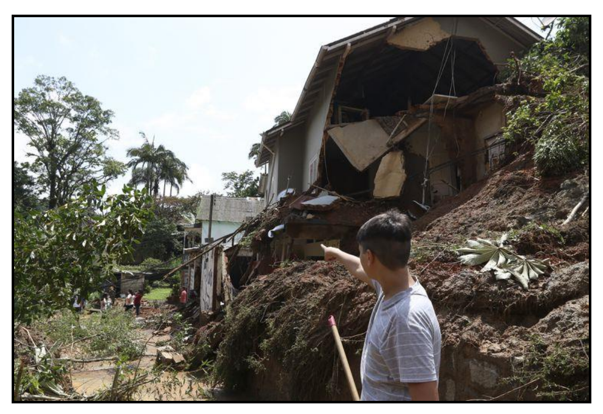
* Houses destroyed by landslides in Petrópolis (2022).

which children and the elderly are particularly vulnerable<sup>36</sup>); iii) the loss of furniture, appliances, clothing, memorabilia and other personal goods of inestimable sentimental value; iv) the relegation of living standards; v) homelessness and displacements; vi) the cut of social ties; vii) unemployment; viii) among others.