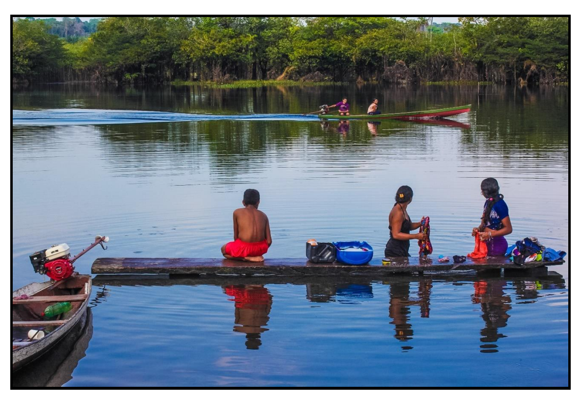
* Resex Renascer - Prainha, Pará. 2014.

These lands are seen as of crucial importance for the country's ability to preserve biodiversity and mitigate climate change, as they encompass, v.g. , vulnerable zones of mangroves, apicuns, sandbanks, dunes, rocky shores, islands and contours of islands, including blue carbon zones (especially mangroves and apicuns).<sup>59</sup>