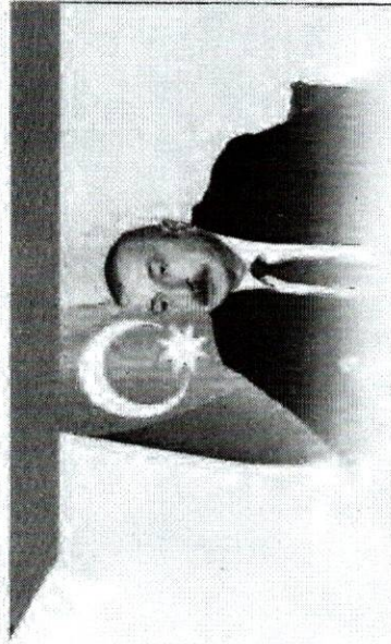
"We are in the process of donating around 1 million doses of vaccines to 14 NAM Member States."

President of the Republic of Azerbaijan H.E. Ilham Aliyev at the UNGA debate on Galvanizing Momentum for Universal Vaccination February 25, 2022