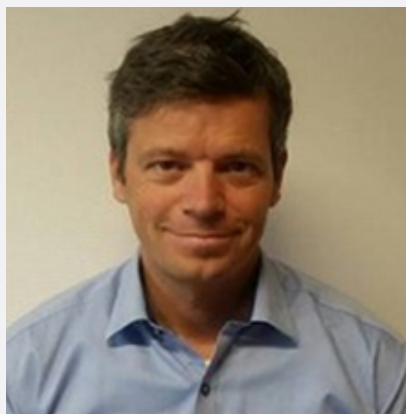
Mr. Nicolas Fasel

Nicolas Fasel is Chief Statistician at the Office of the United Nations High Commissioner for Human Rights (OHCHR). He coordinates OHCHR's program on human rights indicators and data, including reporting on SDG indicators and supporting collaboration between national statistical offices and national human rights institutions to operationalize a human rights-based approach to data. He was seconded to the Office of the United Nations High Commissioner for Refugees (UNHCR) to oversee the conceptualization of the first Global Compact on Refugees Indicators Report. Previously, he worked for the international statistical agency of the European Union and the national statistical office of Switzerland.