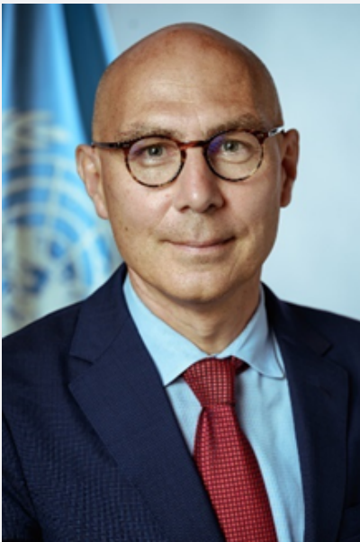
Mr. Volker Türk

Mr. Türk is the current United Nations High Commissioner for Human Rights. He took up his official functions as High Commissioner on 17 October 2022.