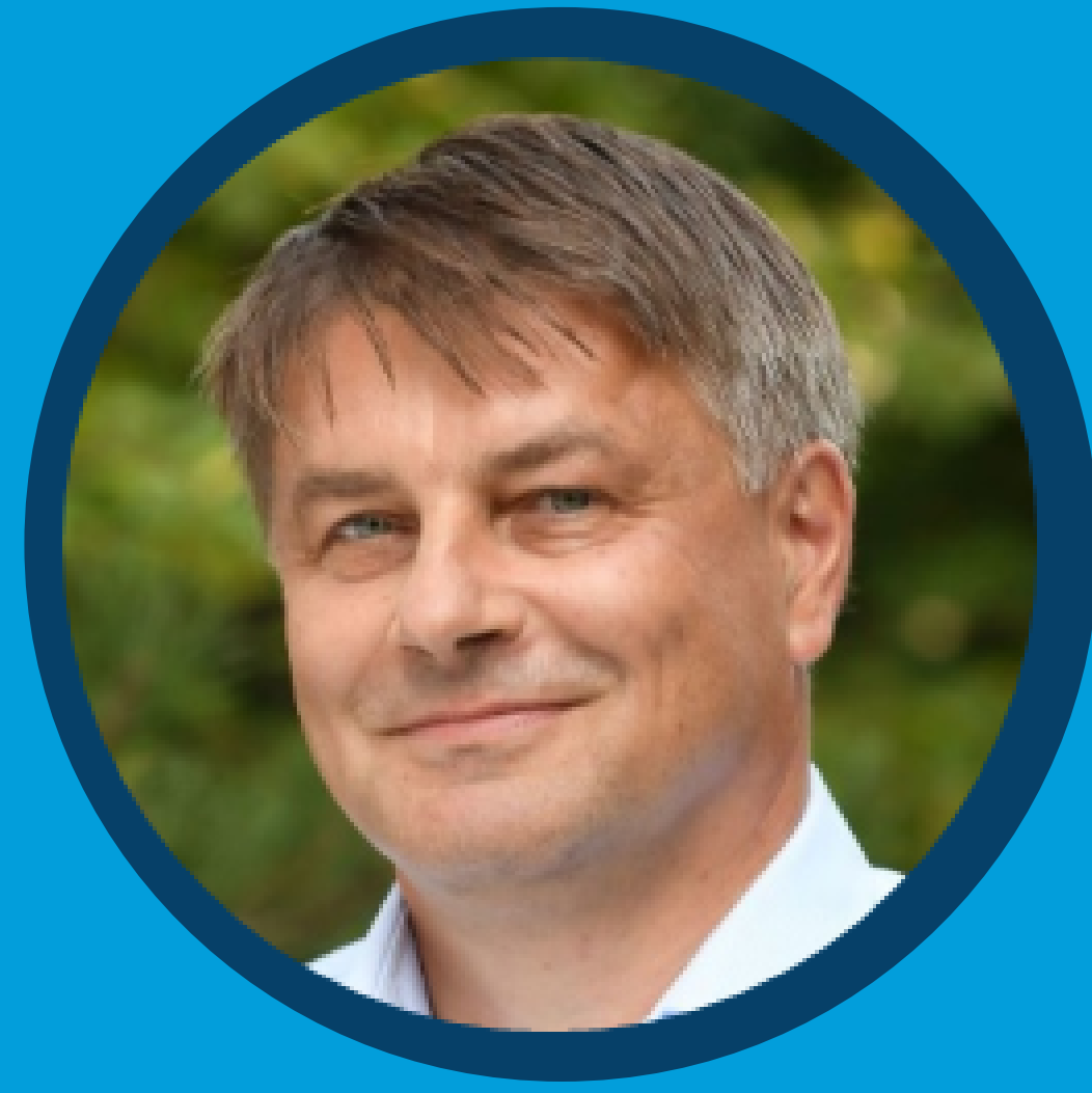
H.E. Václav Bálek