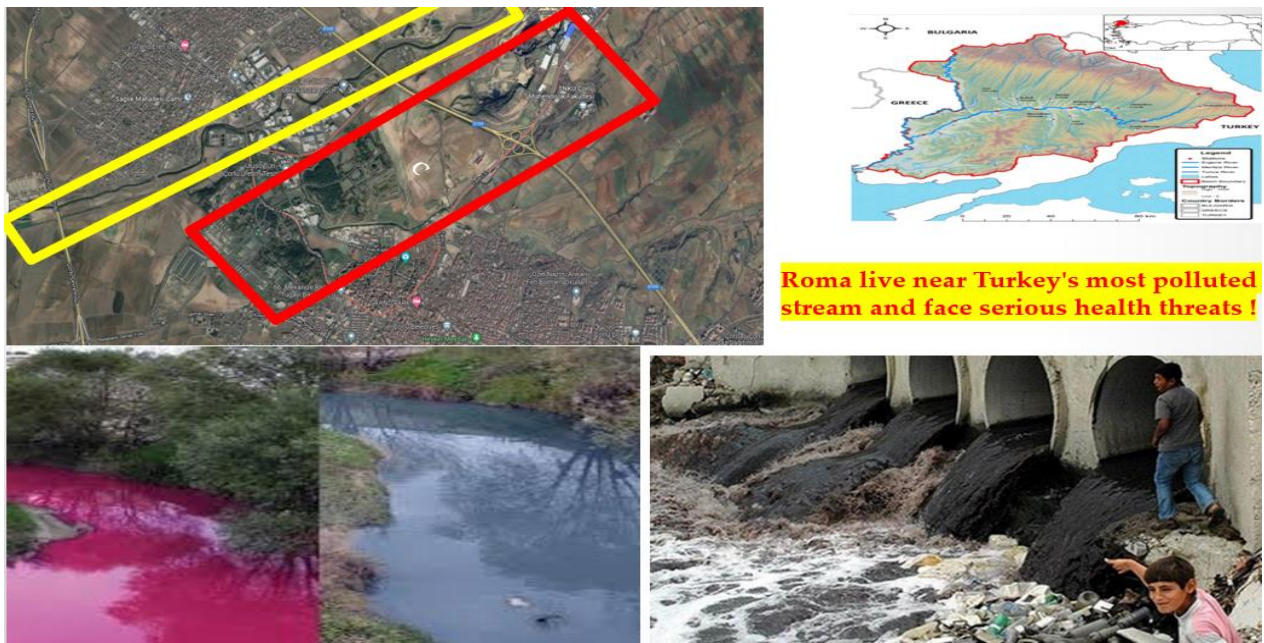
Çorlu - Koro (Hıdırağa) Neighbourhood - Çorlu Stream

According to the literature, environmental benefits and harms are not equally distributed, and ethnicity and class are determining factors in exposure to environmental health risks. Many Roma neighbourhoods in Türkiye are located in active or abandoned industrial zones, in the most desolate corners of the city, on the banks of streams where flood risk is high, and in areas where waste recycling facilities are located. Roma are also more exposed than non-Roma to environmental degradation and pollution from polluting industry and inadequate municipal infrastructure services.