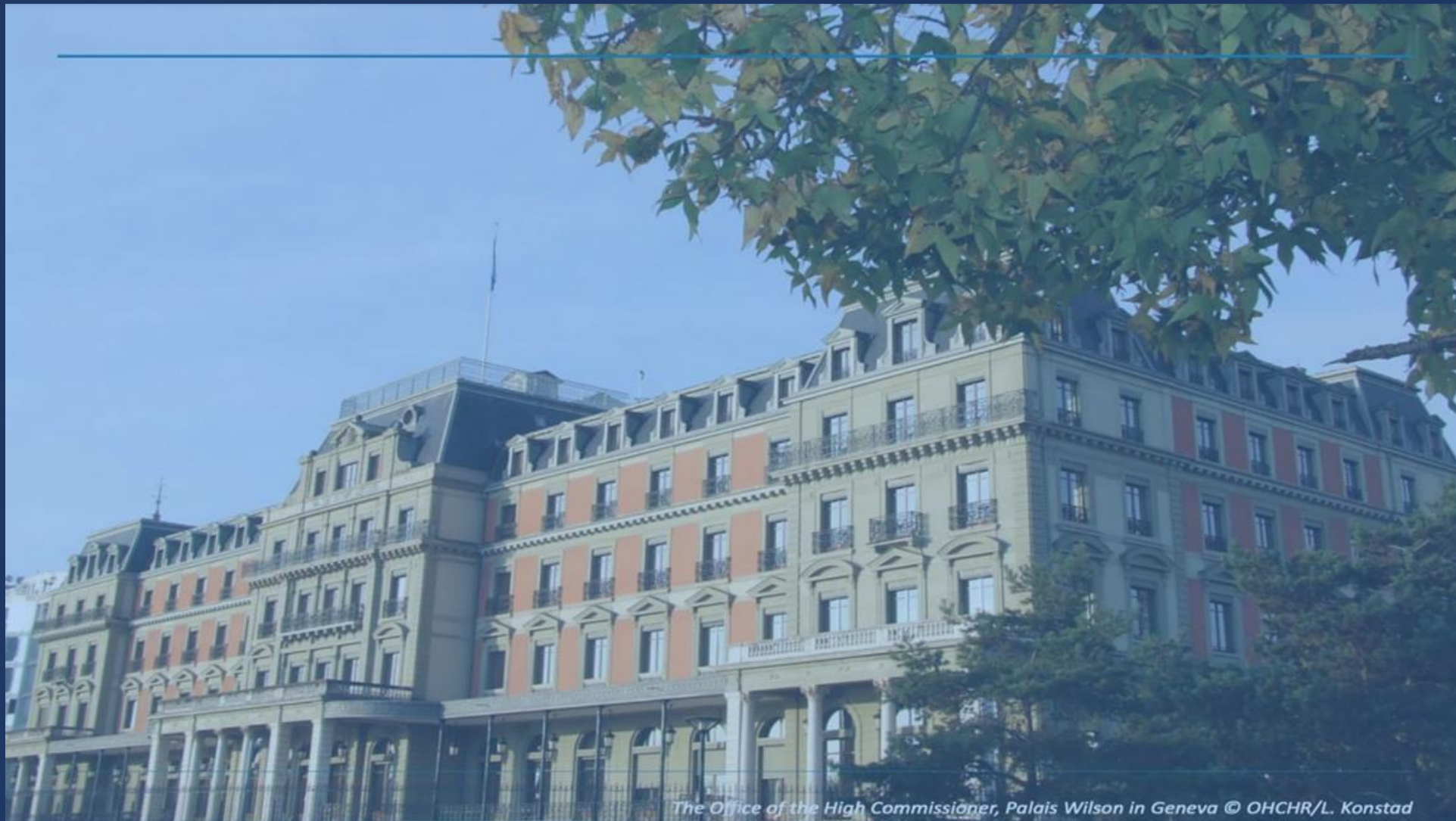
The Office of the High Commissioner, Palais Wilson in Geneva