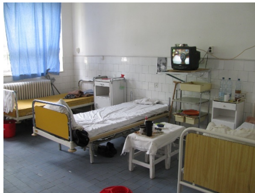
Ward at the Chronic Post-care Unit of Facility III of the Szeged Strict and Medium Regime Prison

In the 4-6-bed wards of the CPU, the size of living space per capita did not reach 6 square metres if 6 patients were placed there. There were not enough showers in the building, ventilation did not function in the lavatories, the toilet lids were broken or missing, and bedsheets were changed less often than required. The NPM asked the commander of the Szeged Strict and Medium Regime Prison to strive to ensure a space of 6 square metres for each detainee, and he made recommendations on establishing the appropriate number of showers and proper ventilation, repairing and replacing the toilet lids, as well as ensuring the change of bedding with due frequency.