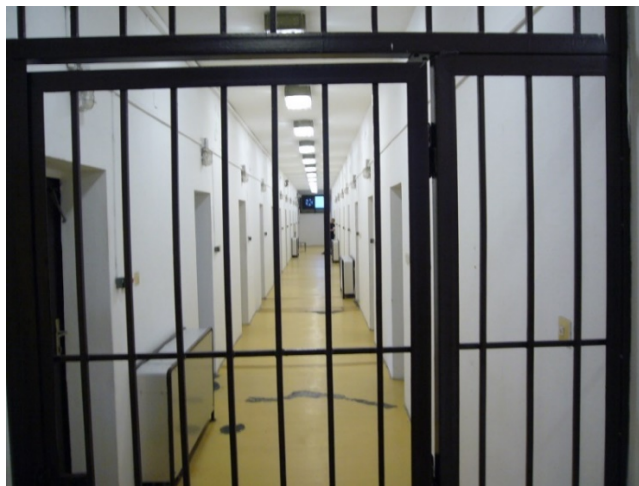
Corridor of the Holding Facility of the Nógrád County Police Headquarters

At the County Holding Facility, the "exercise areas" that were built for ensuring some fresh air time for the detainees were, in fact, closed wings of buildings on the floor of the holding facility where the windows had been replaced by bars. The size and design of these areas did not allow the detainees to exercise outdoors. The NPM asked the head of the Nógrád County Police Headquarters to take action for providing the detainees with an exercise area in the fresh air, which is to be ensured to the detainees by law.