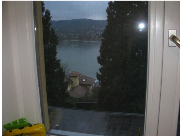
View of the River Danube at the Visegrád Aranykor Foundation Retirement Home

there is a beautiful view on the River Danube through the glass side wall. In the library behind the entrance hall, there is a television set, and comfortable armchairs next to the books. This room opens onto a bathroom and toilet for residents and a large community room. The majority of the residents' rooms were on the 2nd and 3rd floors of the building, with a view on the hills or the River Danube. Most of the residents lived alone or with one room-mate. There were only two rooms which had three residents each. Some of the rooms also had an own bathroom. The majority of the showers were in good condition.