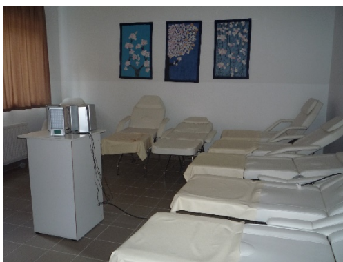
Relaxation room available for the patients and staff members at the Department of Psychiatry

The staff members of the Department of Psychiatry were in compliance with the statutory requirements regarding the performance of their tasks. The patients were served by 5 specialist medical doctors, 2 resident medical doctors, 5 psychologists, 3 qualified social workers, 3 health care administrators and 38 nurses. There was only one nurse with a BSc degree at the Department of Psychiatry, and only one quarter of the rest of the staff held qualifications as psychiatric-mental health nurses. In order to preserve the physical and mental well-being of the employees, to reduce the risk of burnout, furthermore, to moderate the high rate of turnover, the management of the Hospital introduced a matrix-type work regime for the employees working at the individual departments, as well as relaxation opportunities, high-standard further training sessions and professional events.