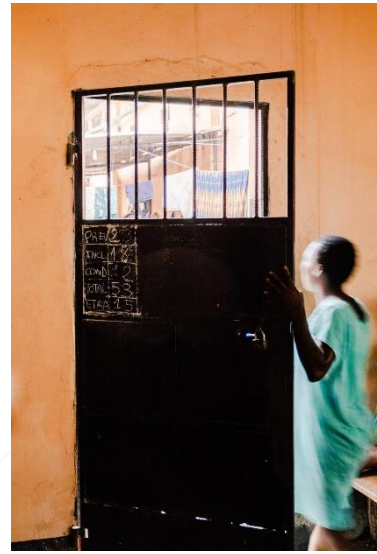
Special Fund project on decreasing pre-trial detention in Togo.

30,000 booklets 20,000 posters 500 guides 20,000 flyers 1,000 manuals, including in a number of minority languages.