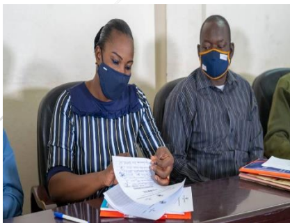
Special Fund project in Mali supporting capacity building of the National Preventive Mechanism, judiciary and law enforcement to prevent torture.

To help finance the implementation of the recommendations made by the Subcommittee on Prevention of Torture following a visit to a State party to the Optional Protocol, and to finance educational programmes of national preventive mechanisms.