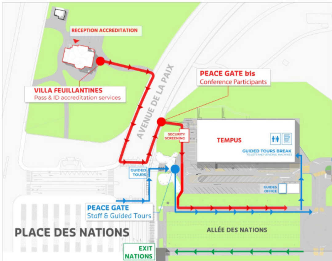
UPGRADE OF PREGNY BUILDING Temporary relocation of Pass & ID Accreditation Services from September 2022 to April 2023