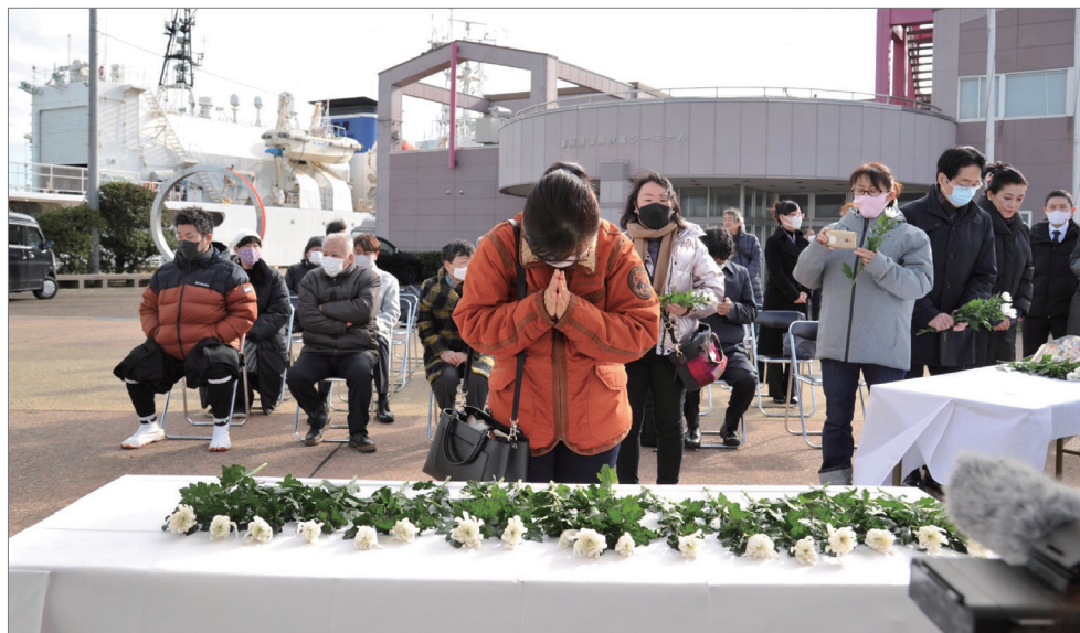
Memorial service held for victims of the Paradise on Earth campaign, held at the Port of Niigata, Japan, December 2021

textbooks and also take school trips to the region when they study freedom, democracy and human rights, as part of efforts to revitalize Niigata.” 192