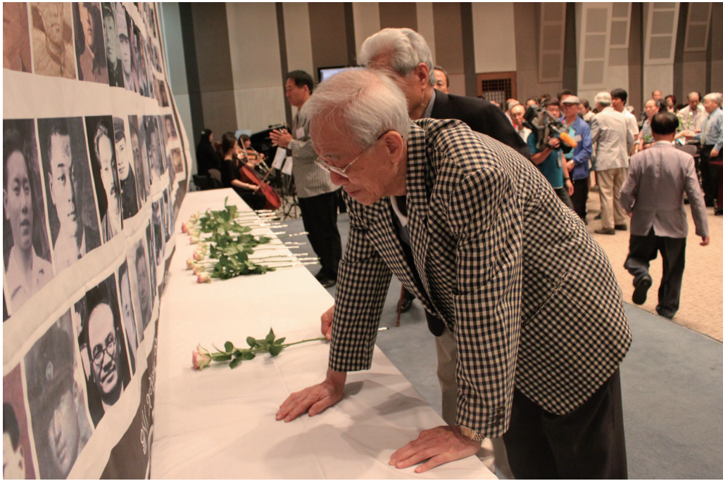
Families lay floral tributes beneath pictures of victims at the Korean War Abductees Remembrance Day event, Seoul, Republic of Korea, June 2012

Democratic People's Republic of Korea too ... I go to sleep fantasising, dreaming, that one day I might wake up to the news that this happened." 152