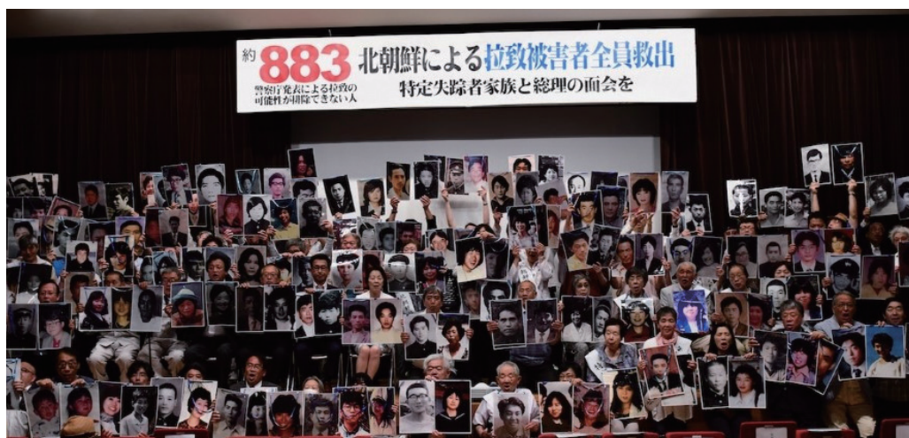
Participants at a rally held in Kobe holding photos of abductees and possible abductees by the Democratic People's Republic of Korea, Japan, March 2020

expect to receive a similar level of attention and support from the Government of Japan as the recognized abductees, to raise awareness at both the domestic and international level. One victim of the Paradise on Earth campaign who escaped the Democratic People's Republic of Korea in the 2000s told OHCHR: