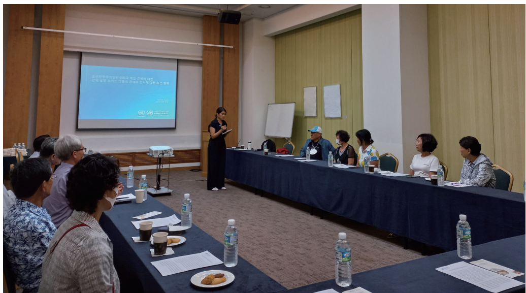
Meeting of abductees' families with the UN OHCHR Seoul office, Republic of Korea, August 2022

66. This section captures responses collected by OHCHR from victims, including relatives of forcibly disappeared persons, on their views and expectations about the realisation of their right to truth, justice including accountability and reparations. The aim is to emphasize a victim-centred approach to justice and accountability, and to bring attention to the needs and expectations of victims, who have long felt neglected. Whenever possible, OHCHR provided information to interviewees on judicial and non-judicial approaches. Most interviewees emphasized that all redress measures are important and meaningful, and their needs can be fulfilled only through collective efforts and a comprehensive approach.