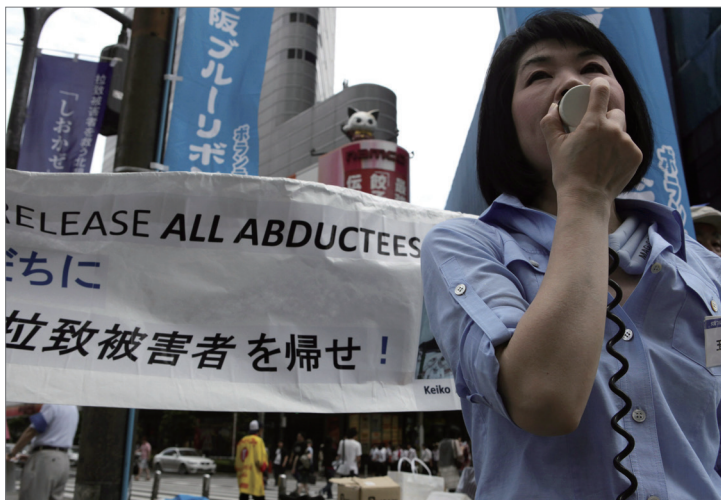
Protest against abductions by the Democratic People's Republic of Korea, in Japan, June 2009

investigated by the Government of Japan, as of January 1, 2023. 78