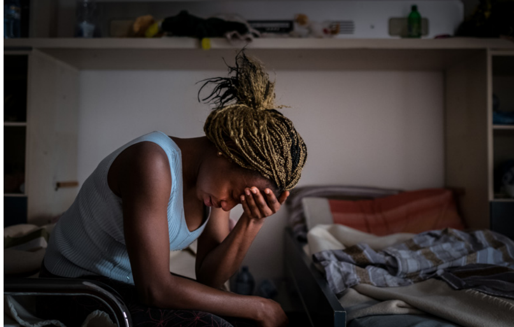
Above: Italy. Woman from Benin City in Nigeria, cries on a dormitory bed in the safe house where she now lives, on the outskirts of Taormina in Sicily.

Serious violations of international humanitarian law: Serious violations of international human rights law usually fall within the “Grave Breaches” regime of Article 147 of the ICRC Geneva Convention IV relative to the Protection of Civilian Persons in Time of War as well as those listed under Article 3 of all four Geneva Conventions. These cover willfully killing, torture or inhuman treatment, including biological experiments, willfully causing great suffering or serious injury to body or health, the passing of sentences and the carrying out of executions without previous judgment pronounced by a regularly constituted court, unlawful deportation or transfer or unlawful confinement of a protected person, compelling a protected person to serve in the forces of a hostile power, or willfully depriving a protected person of the rights of fair and regular trial, taking of hostages and extensive destruction and appropriation of property, not justified by military necessity and carried out unlawfully and wantonly. Victims of gross violations of international human rights law and serious violations of international humanitarian law have a right to remedy and reparation, as outlined in United Nations General Assembly Resolution 60/147, Basic Principles and Guidelines on the Right to a Remedy and Reparation for Victims of Gross Violations of International Human Rights Law and Serious Violations of International Humanitarian Law .