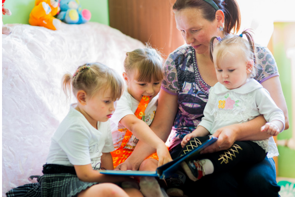
Above: Kazakhstan. Woman and her children at a crisis centre in Temirtau.

Programming could provide training to justice actors on violence against women, support the establishment of specialized services and provide legal aid