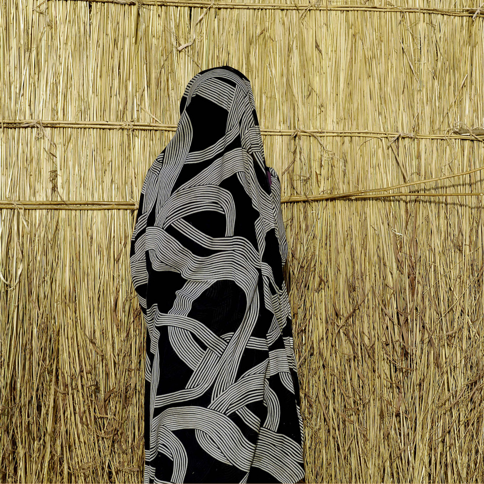
Above: Sudan. A Misseriya woman stands in front of a thatched shelter.