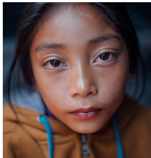
Above: Nepal. Girl in a UNICEF-supported child-friendly space in a camp for earthquake-displaced people in the town of Charikot.

To secure the rights provided for in international law, constitutions and legislation, programming must consider whether justice and security sector institutions are equipped to prevent and respond to violence, including facilitating women’s ability to navigate across the justice chain. Process matters for how survivors experience justice: the manner in which they are treated when accessing services and the information they receive along the way will, in the end, play a significant role in determining justice outcomes. For this reason, justice and security sector institutions which deal with different forms of violence must meet the criteria of being available, accessible, able to provide appropriate and enforceable remedies, good quality and accountable.