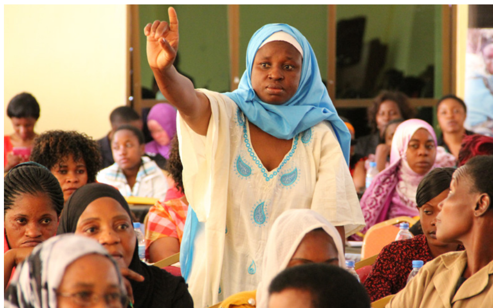
Above: Tanzania. Women claim their space in the electoral process.