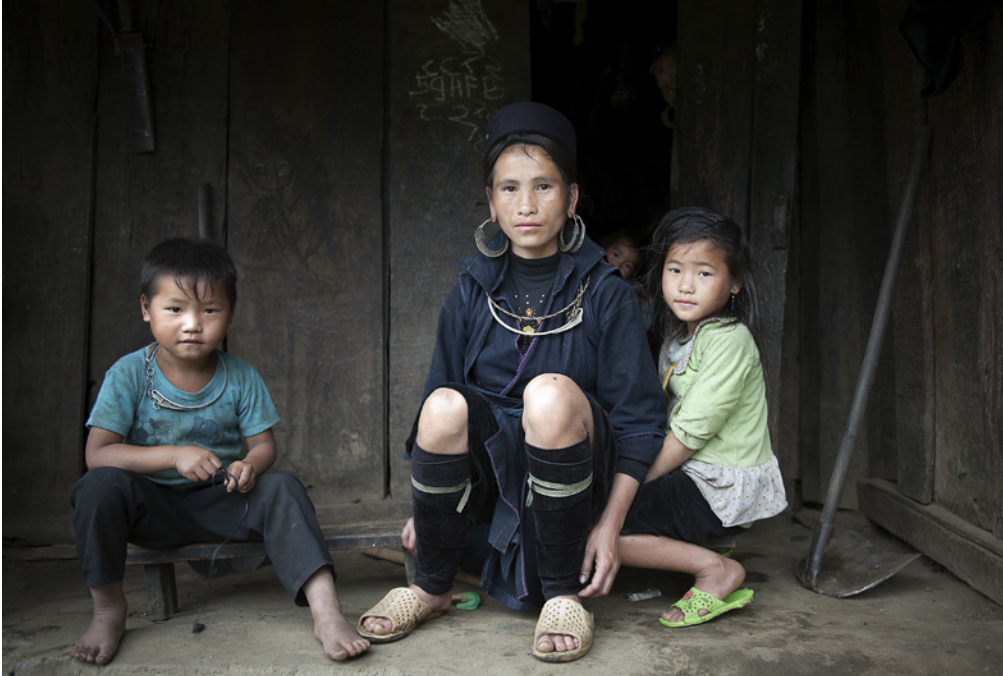
Above: Vietnam. A H'mong family in Sin Chai hill tribe in the village of Sapa.

Telecommunications form a critical part of measures to empower women and ensure that they have access to information in a timely and cost-effective way. SDG 5 Target 5(b) calls for States to enhance the use of enabling technology, in particular ICT, to promote the empowerment of women. One global study found that 93 per cent of women felt safer and 85 per cent felt more independent because of the security offered by owning a mobile phone. 94 However, care should be taken with regard to the impact of information technology on human rights defenders, monitoring staff and journalists who are engaged in investigations and monitoring activities that are politically sensitive or viewed as threatening, in which case, women can be placed at a heightened level of risk as a result of their activities. 95