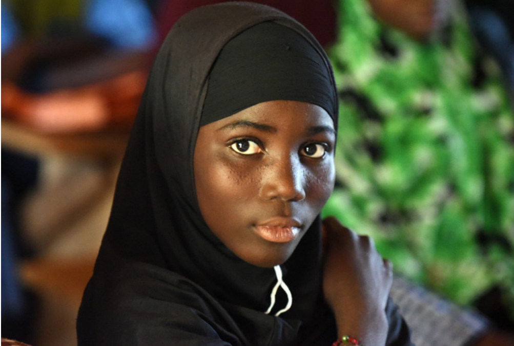
Above: Côte d'Ivoire. Student in class at a French-Arabic school in the town of Korhogo, in the South West of the country.

occurrence of violence against women or the responsiveness of justice systems to this violence.