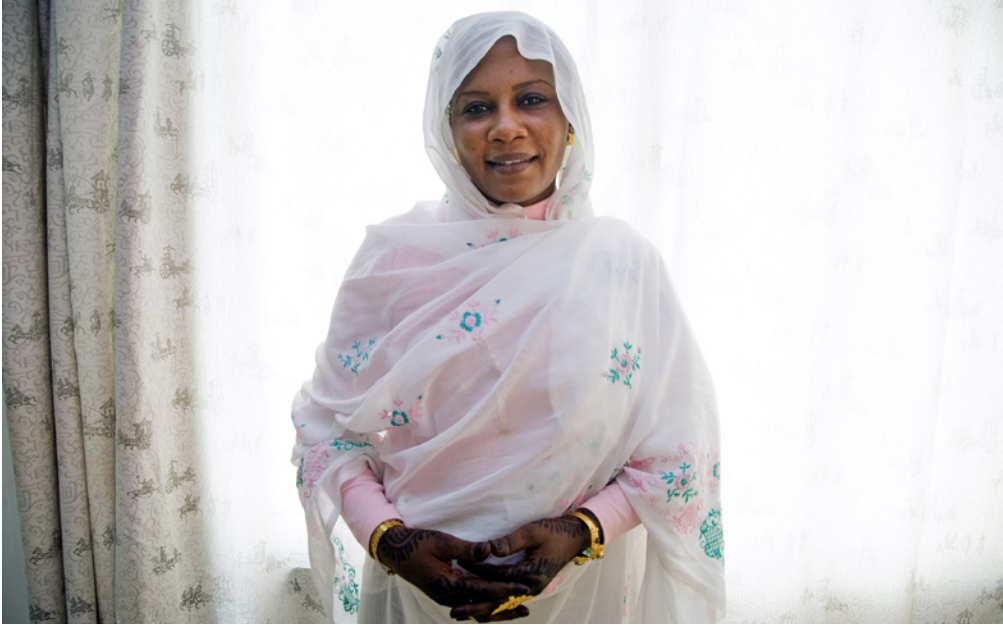
Above: Sudan. Lawyer from Nyala.