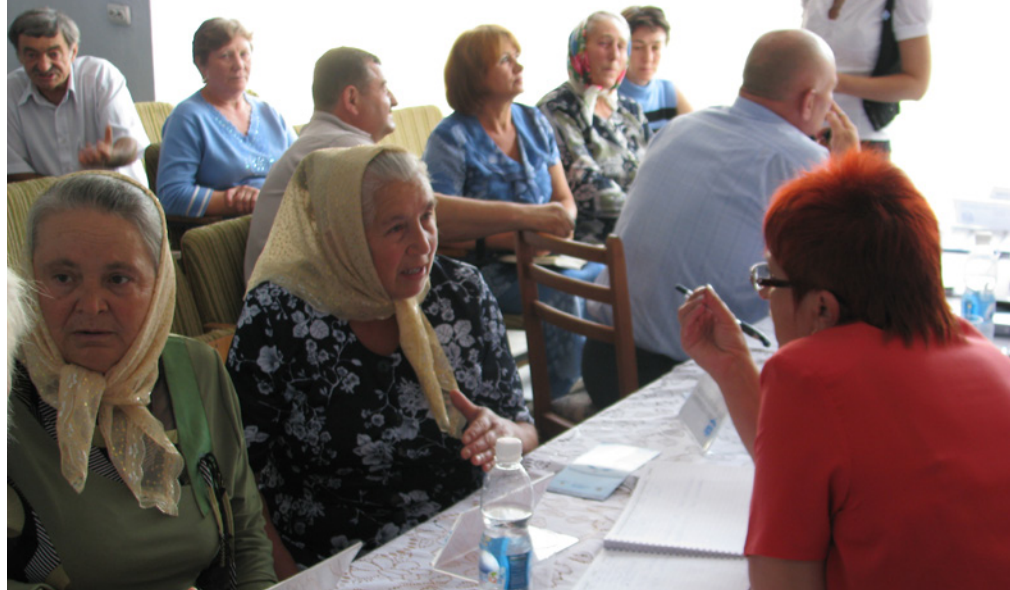
Above: Moldova. Joint Information and Services Bureau representative consults elderly women on their social entitlements in district of Singerei.

Accountability sustains investments made in family law justice institutions and ensures their integrity