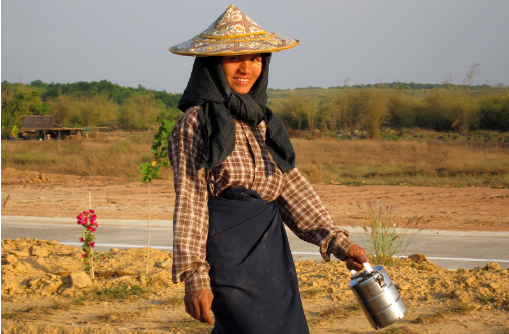
Above: Myanmar. Woman walking home from work along the road from Naypyitaw.