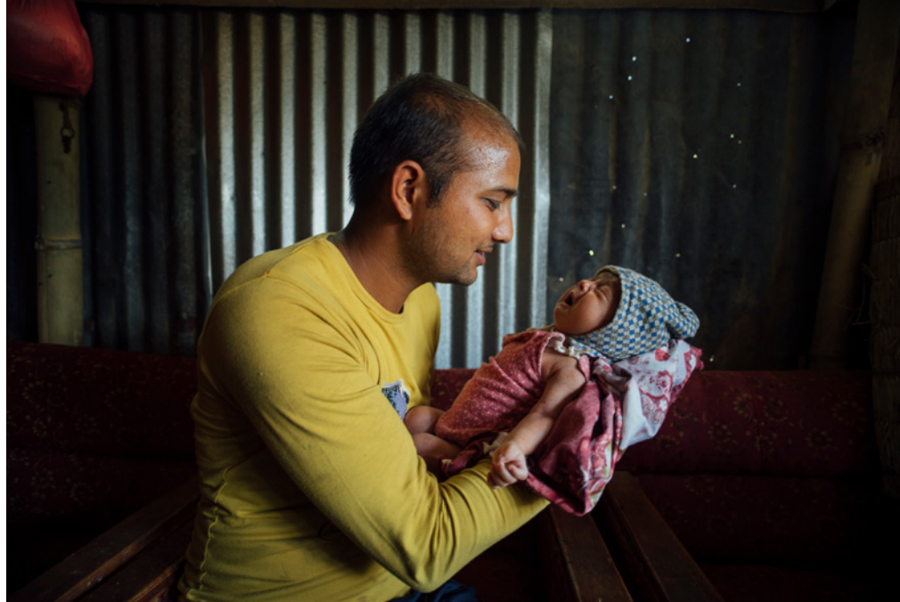
Above: Nepal. Father holds his crying 22-day-old son, in a building in the earthquake-affected town of Singati.

Marriage and family issues may be relegated as social issues and therefore, less of a national priority