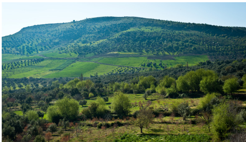
Above: Morocco. The village of Ait Sidi Hsain, near Meknes.

Land tenure security arrangements: A set of interventions by formal State structures or informal community/traditional institutions that seek to protect different types of interests in land that a person may possess. This may include situations where an individual or group of individuals are outright owners through purchase or inheritance from a purchaser; a person who has leased the land for a period of time; a person who enters into a profit or crop sharing arrangement; or a person who has been granted rights of access to land by virtue of being a member of a land-owning family or lineage.