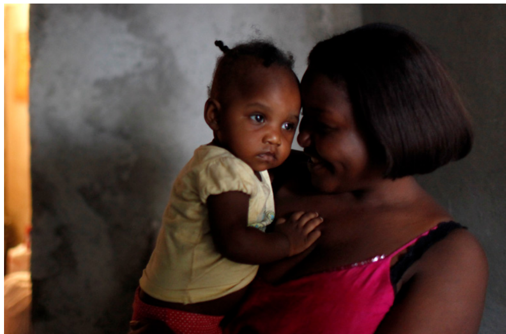
Above: Haiti. Woman at home with her daughter.

Accessibility in the context of marriage, family and property rights is paramount, because women may face the double burden of lack of financial resources to access the justice system and lack of child and/or spousal maintenance and alimony (see Figure 2.2). In some instances, women claimants may also be survivors of violence, and in this context, may need to access multiple points across the justice chain. To address the potential challenges of navigating the justice system, streamlined processes and procedures