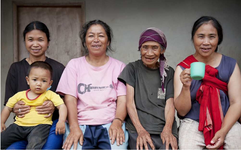
Above: Thailand. A family of women at Mae Salong, H'mong hill tribes.