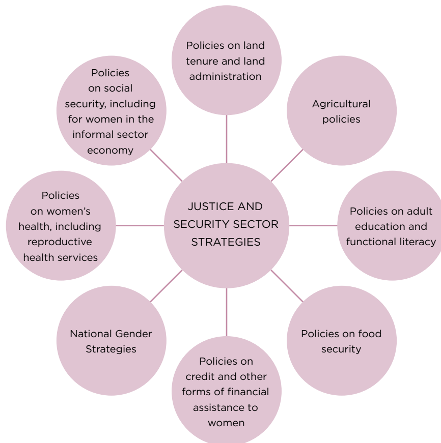
FIGURE 2.1 Protecting women’s property rights through cross-sectoral policy linkages

Marriage, family and property rights cut across different policy domains