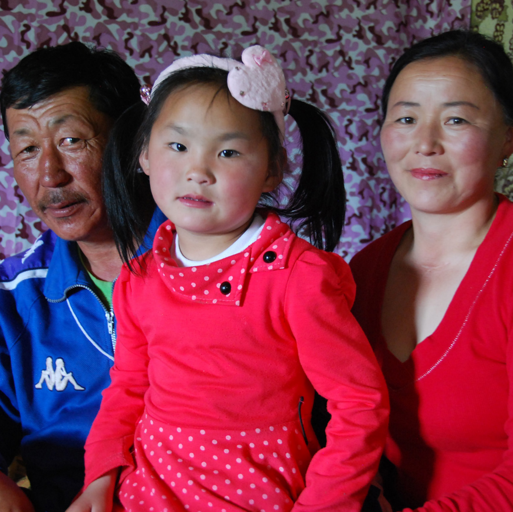
Above: Mongolia. Child and her adoptive parents.