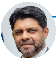
Hon. Attorney-General Aiyaz Sayed-Khaiyum, Minister for Economy, Civil Service, Communication and Minister Responsible for Climate

ALTHOUGH THERE ARE CHALLENGES TO INCORPORATING BUSINESS AND HUMAN RIGHTS, POSITIVE ACTION CAN BE TAKEN BY THE PACIFIC PRIVATE SECTOR.