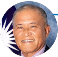
H.E. David Kabua, President, Government of the Republic of the Marshall Islands

H.E. David Kabua noted the key role businesses play in socio-economic development and numerous challenges that COVID-19 has brought to both businesses and States. Closing the borders brought negative implications such as disrupted supply chains, slowed development, and laid-off workers. President Kabua highlighted health, economic, and climate crises that the Pacific face and the interlinked solutions that would help build back better and stronger. In seeking remedies to fight these crises, he emphasized the need to find innovative solutions for green recovery, investing in renewable energy and taking advantage of ICT resources. President Kabua noted fisheries, especially on tuna, as a major economic driver for the Republic of the Marshall Islands (RMI). Highlighting the need to continue assistance in building capacity and the need for a stronger political will from the full range of international actors, he noted that collaboration between the Pacific States and fisheries players will be a textbook example of the UNGPs. President Kabua stated, “It is particularly important that the UNGPs on business and human rights are equally applied to all nations, large and small, without exception and further that their obligation is a matter of transparent and objective accountability that support implementation, not political lip service.”