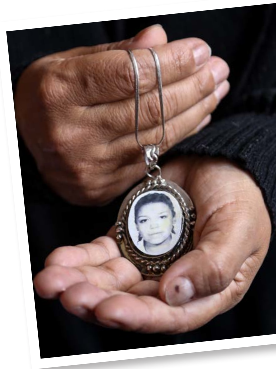
A mother shows a picture of her murdered daughter in Mexico City, Mexico

Several United Nations entities are supporting Member States in taking action against gender-related killing. This booklet aims to raise awareness among criminal justice practitioners, policy and decision makers, as well as United Nations staff and civil society. It presents the recommendations and the tools and assistance offered by the United Nations Office on Drugs and Crime (UNODC), UN-Women, the Office of the United Nations High Commissioner for Human Rights (OHCHR) and the United Nations Population Fund (UNFPA) to implement them.