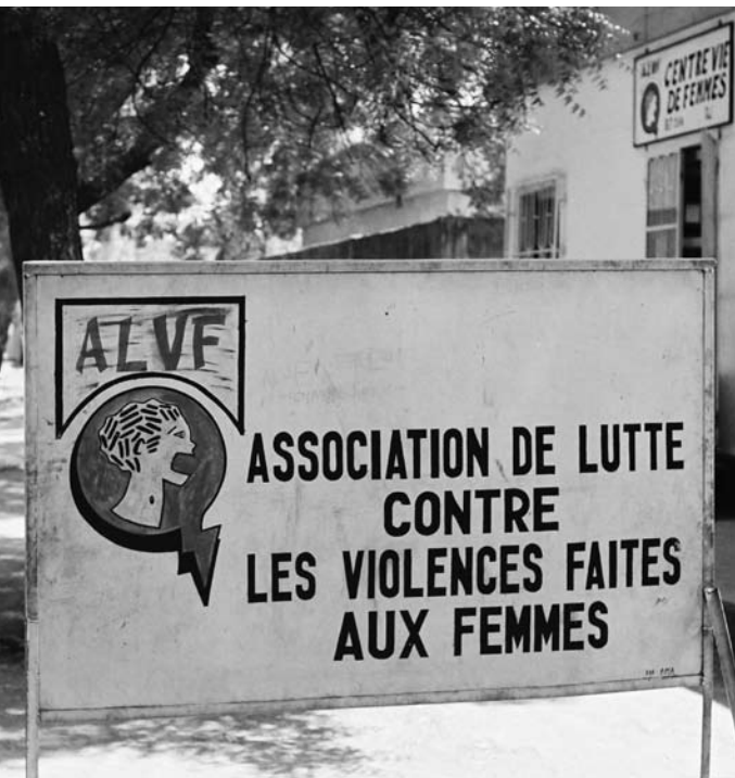
The Center for Women’s Lives is housed in the ALVF building just down the street from the palace of the traditional leader. The choice of location was a risky, but strategic decision for an openly feminist organization.

The offering of services started very slowly, and in its first few years of operation, the Center handled only about ten cases a year. Siké and her colleagues used the time to learn more about these women’s lives and needs, including what had led them to become trapped in a cycle of violence and dependence. Echoing what they had learned in their initial outreach, they found that, typically, these women’s problems had been set off by a forced, early marriage.