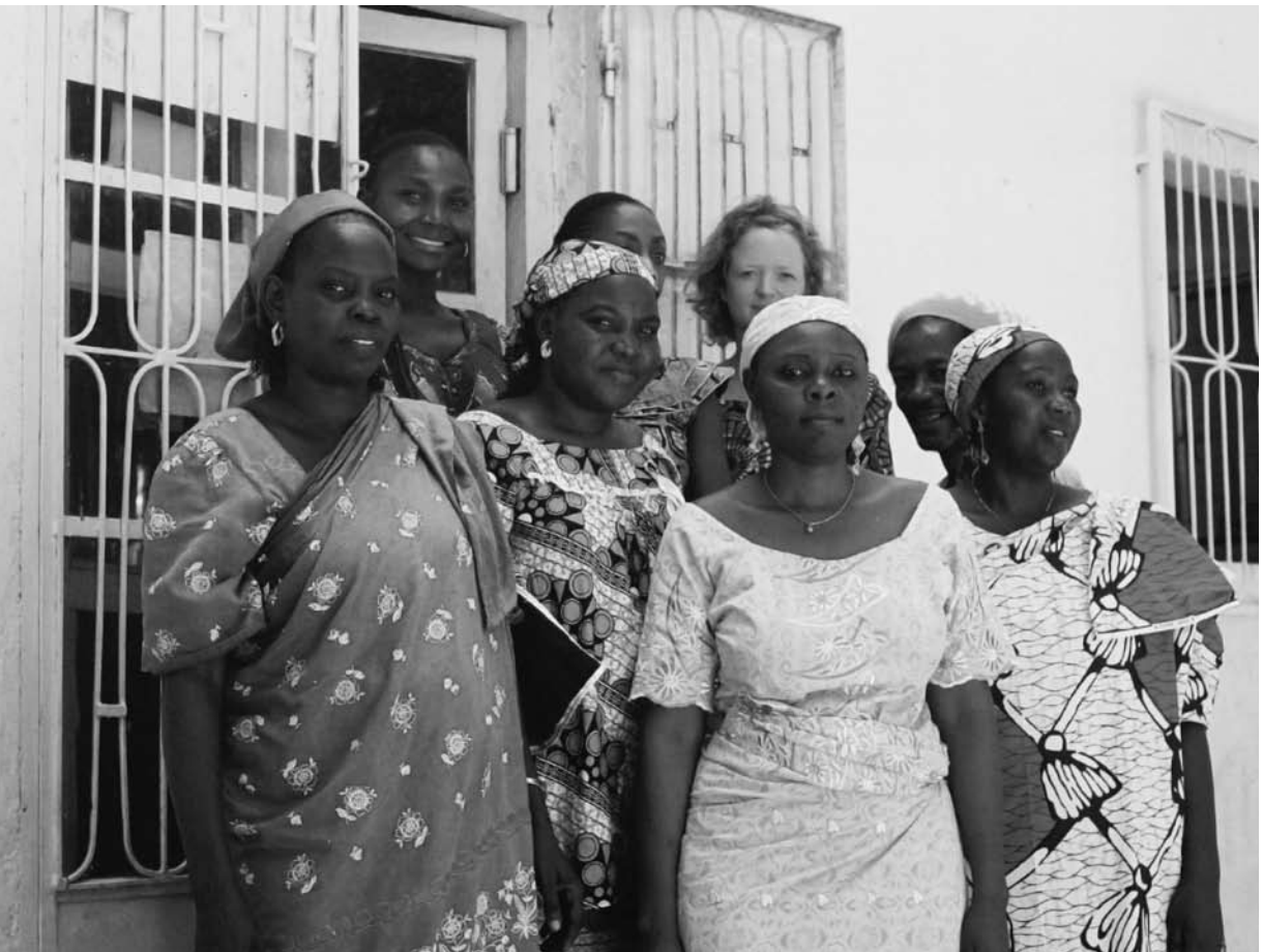
The proud staff of the Maroua chapter of the Association for the Struggle Against Violence Against Women.

In addition to providing women who attend the Center with direct services, the staff of ALVF carry out advocacy and lobbying, alliance building, public education, and communications.