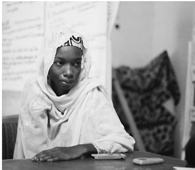
ALVF explains that at the root of child marriage is power and control over women.

As they listened, one issue emerged again and again: forced and early marriage. Yet public debate about child marriage was virtually nonexistent: No organizations were focused on identifying and addressing its root causes, or on supporting the women whose lives had been torn asunder by this abusive practice [see box on page 4].