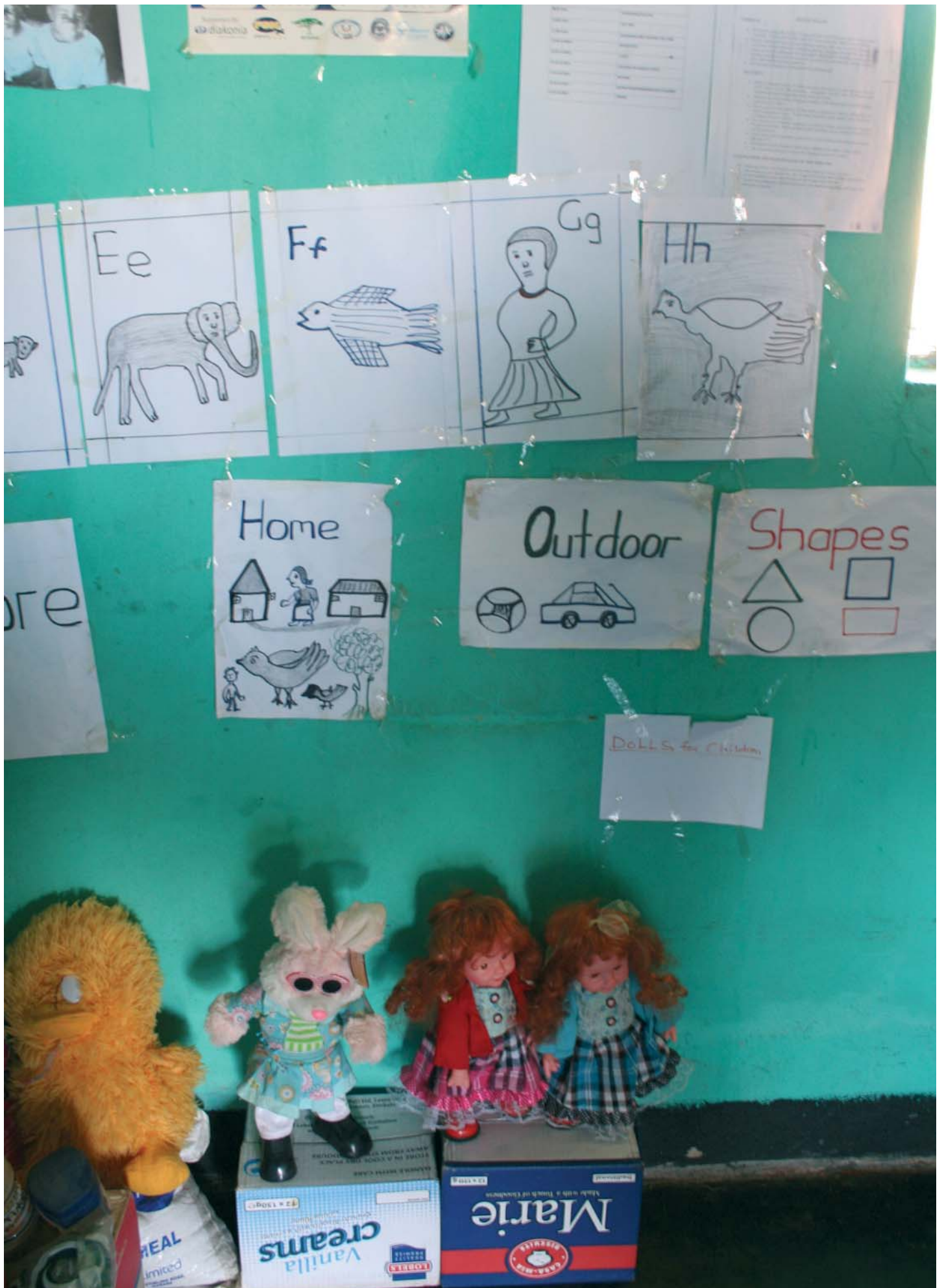
Children's toys, Chikomba shelter (Bethan Cansfield)