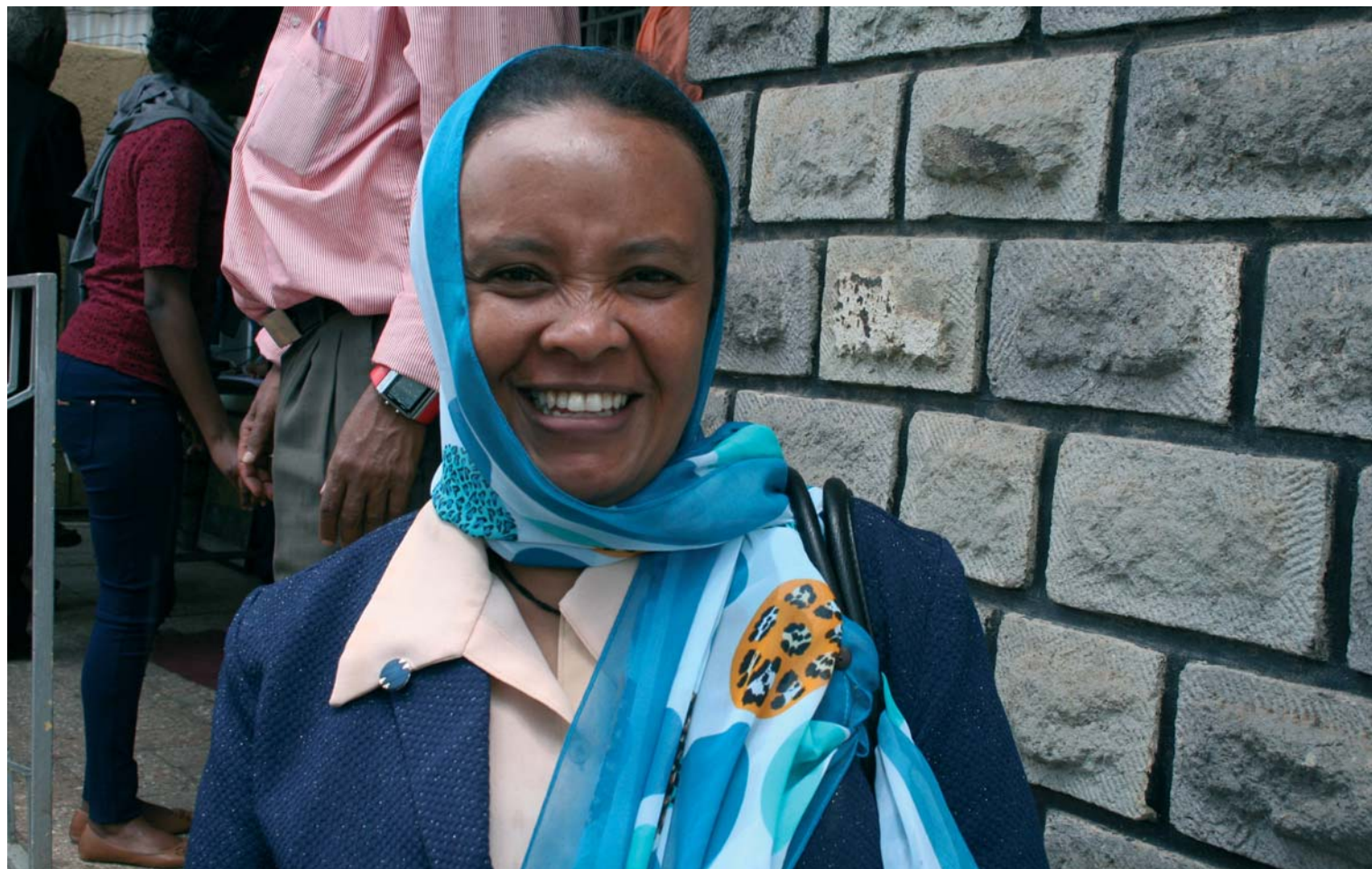
Local leader who has received training and support from AWSAD

training. A police commander and officer told us that “AWSAD is the best of the best” and that the various trainings provided were very helpful in supporting them to respond to VAWG. Similarly, MOWA officers who took part in the documentation stated that “AWSAD has helped us in so many ways, including through skill training.”