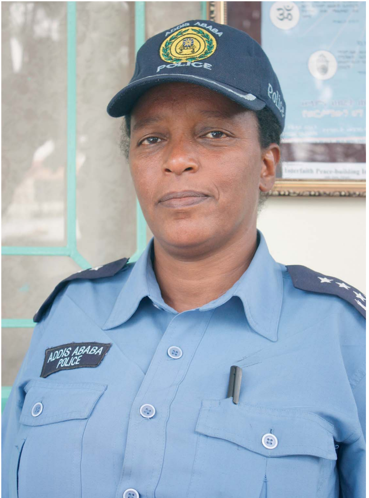
Police commander, Addis Ababa