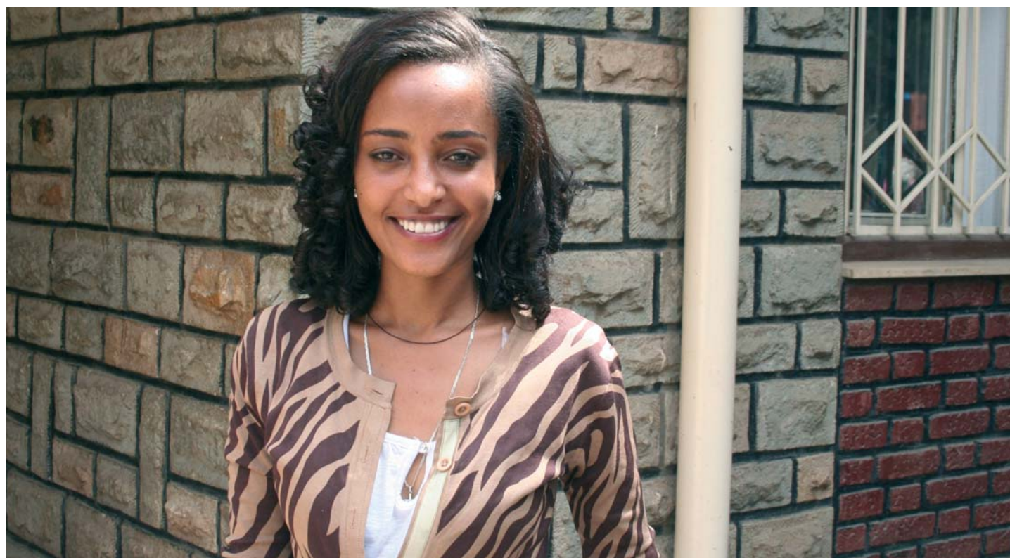
Shelter counsellor, Addis Ababa shelter