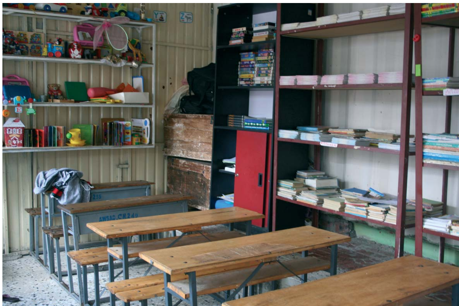
Learning area, Addis Ababa shelter (Bethan Cansfield)