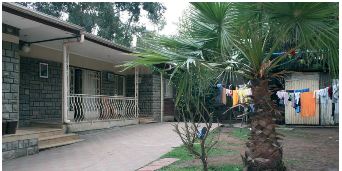
Exterior of Addis Ababa shelter

"I used to be afraid and have no self-confidence. But now I have self-confidence." Former client, Addis Ababa shelter