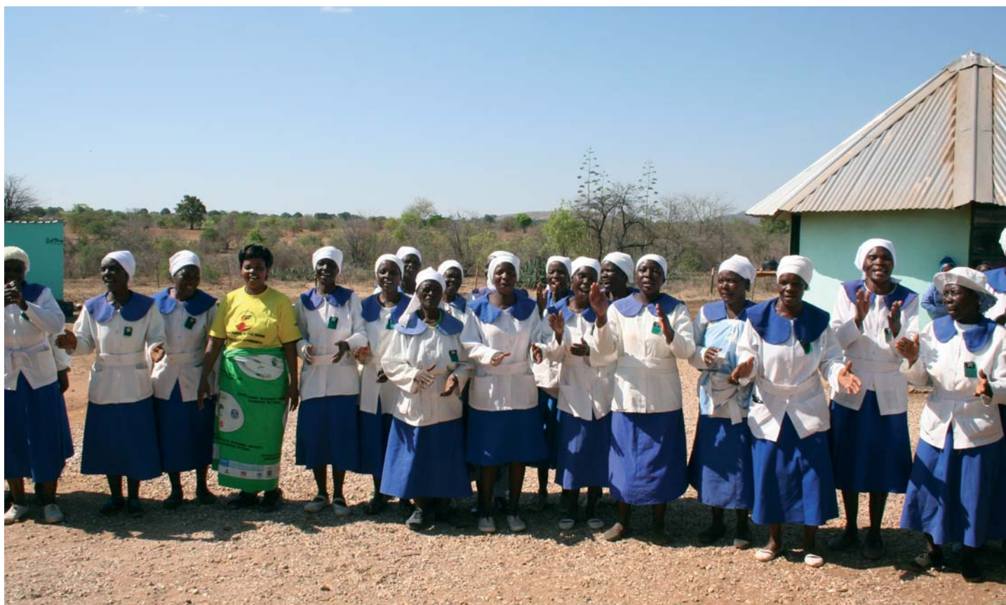
Church members, Gutu shelter

The referrals, profiles of the clients and services are similar to the Chikomba shelter.