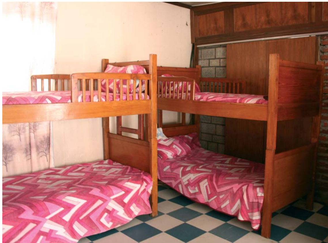
Beds, Addis Ababa shelter (Bethan Cansfield)