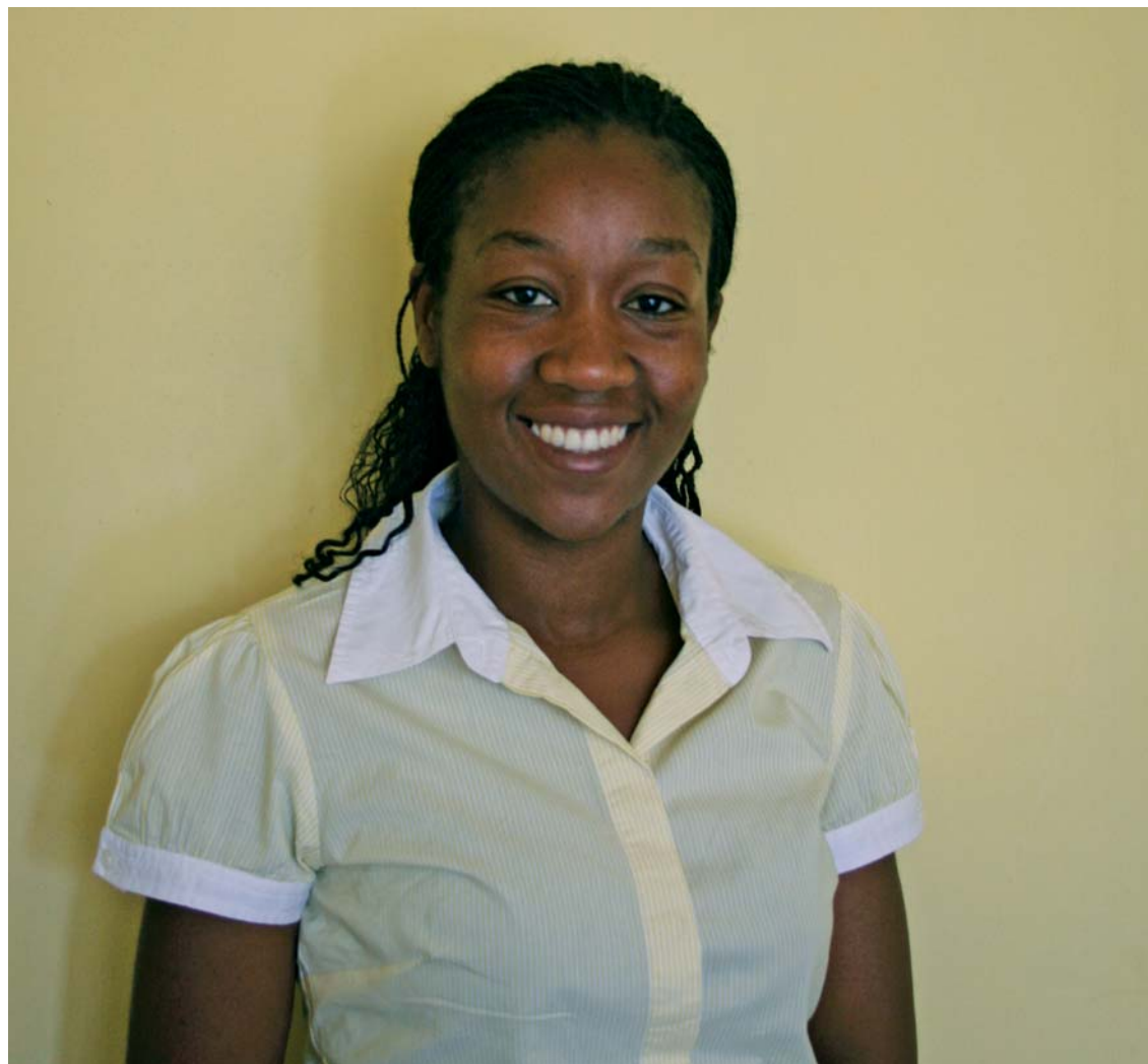
ZWLA lawyer working in One Stop Centre, Harare

minors (under 18) MSF makes referrals to the Department of Child Welfare. However, this department does not provide accommodation for girls who are pregnant, therefore MSF will refer pregnant girls to Musasa's shelter in Harare.