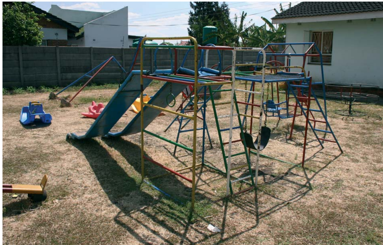
Play area, Harare shelter (Bethan Cansfield)