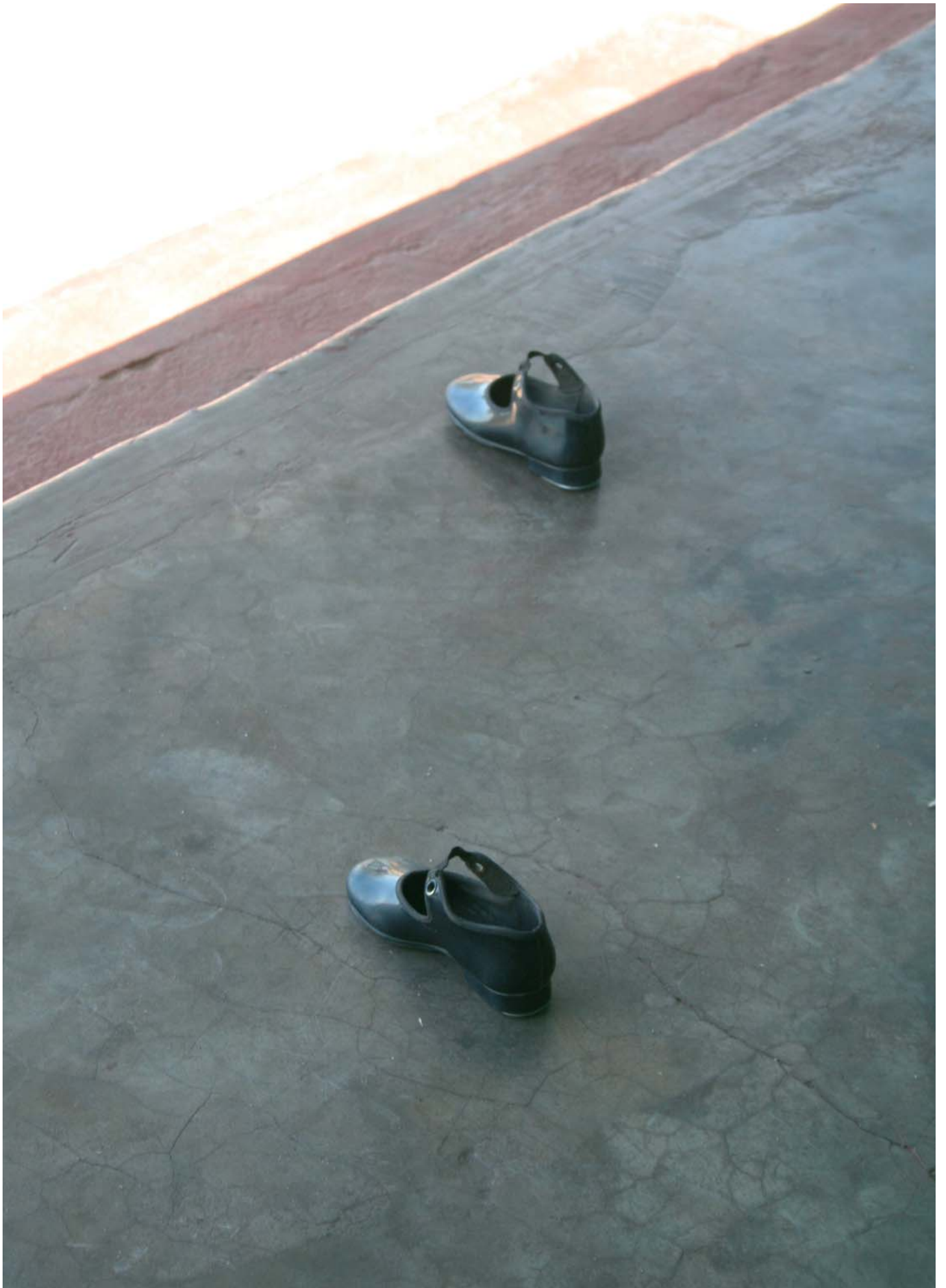
Girl's shoes, Chikomba shelter (Bethan Cansfield)