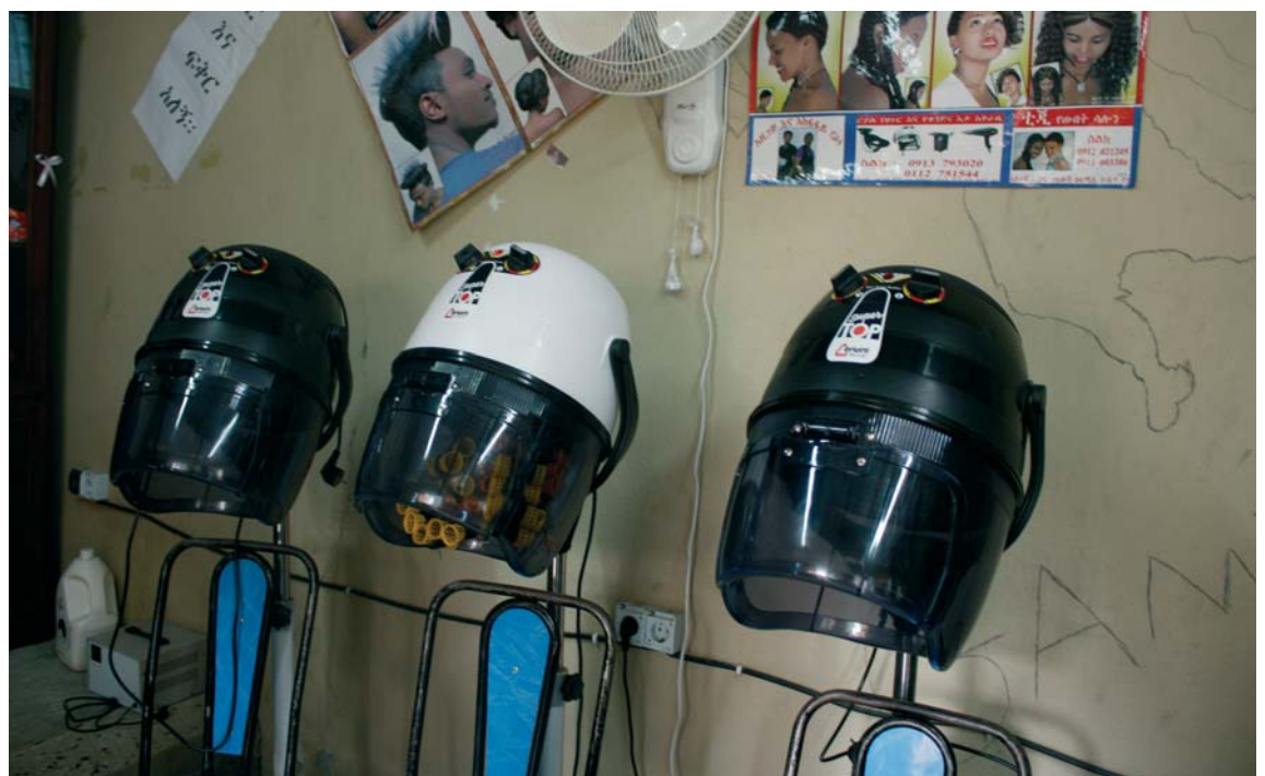
Hairdressing IGA training, Addis Ababa shelter

At present, AWSAD provides clients with skill training in the following IGA: embroidery and sewing, hairdressing, bamboo and leather making, carpet weaving, food preparation and packaging, baby-sitting and modern spinning. The length of the training varies from two to four months.