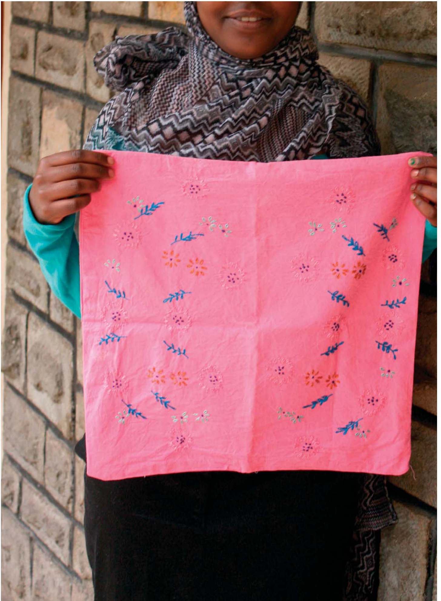
Current client holding up embroidery she made in income generating activities training, Addis Ababa shelter (Laura Brown)