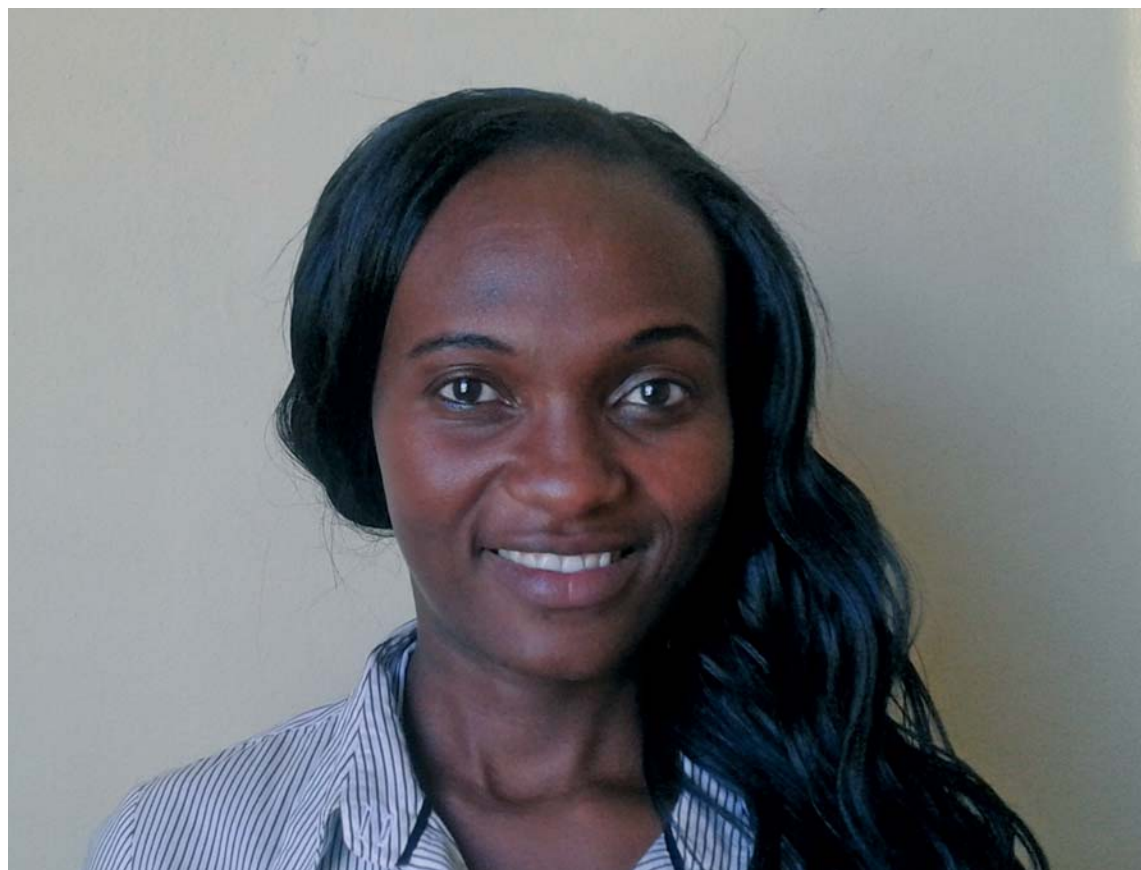
Toll-free line counsellor, Harare

take a survivor-centred approach. Musasa provides training to a wide range of stakeholders, including the Ministry of Women's Affairs, police, health providers, social welfare officers, traditional leaders, religious leaders, representatives from school and judicial officials. A policewoman in Chikomba stated that Musasa supports the police to respond to VAWG by providing workshops. Musasa has delivered multi-sectoral training across 26 districts. The number of trainings per district depends on the need and the challenges faced.