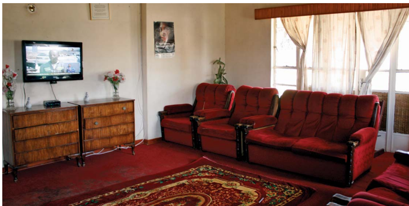
Interior of Harare shelter