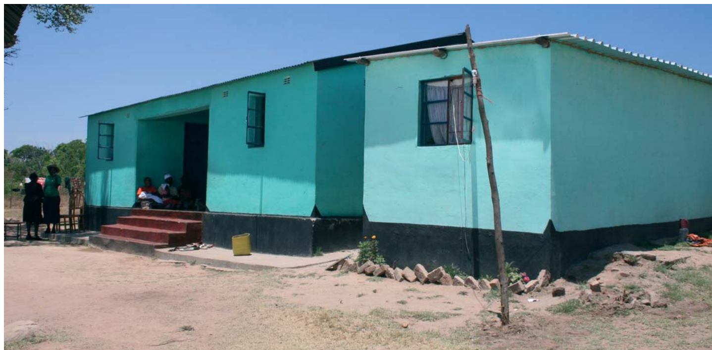
Exterior of the Chikomba shelter (Bethan Cansfield)