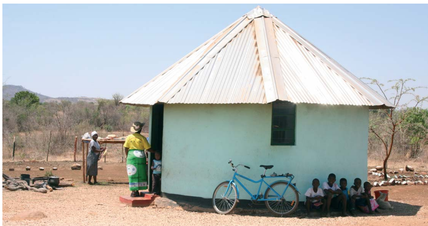
One of the Gutu shelter's buildings (Bethan Cansfield)

Musasa sees the partnership with the Zion Christian Church as critical. The church has a large following and has sometimes been accused of perpetuating harmful traditional practices, including early and forced marriages.