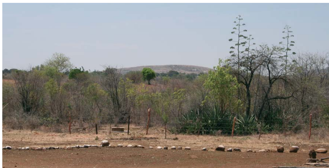
Gutu, Zimbabwe (Bethan Cansfield)