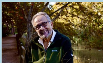
Defending the 'blue soul of life' Pedro Arrojo-Agudo, from Spain, is the United Nations (UN) special rapporteur on the human rights to safe drinking water and sanitation.

Responses received by the deadline (15 April) are available .