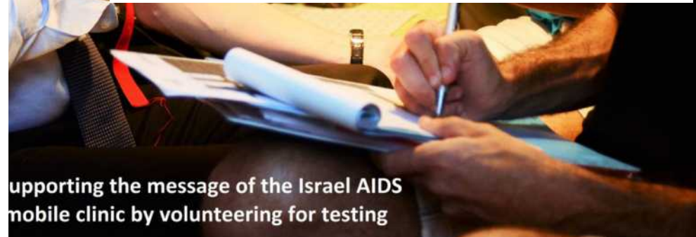
Supporting the message of the Israel AIDS mobile clinic by volunteering for testing