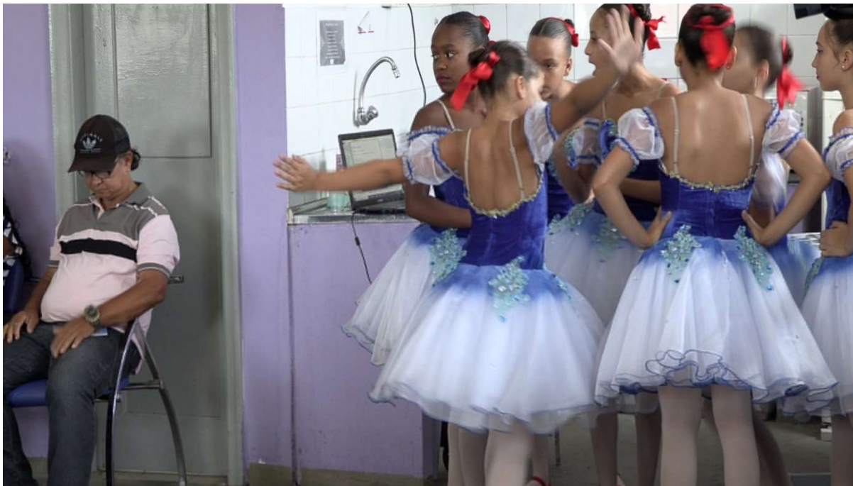
Ballet de Manguinhos, from Right Now I Want to Scream (2020)

We posit that the collective impact on communities of harms to mental health from militarised policing is greater than the impacts of each separate mental health harm. Each new death may reawaken trauma in the families of people killed in earlier operations. Each time a helicopter strafes the neighbourhood or children have to hide under school-desks from police fire, it not only traumatises the individuals immediately affected, it may also add another layer of trauma to community life.