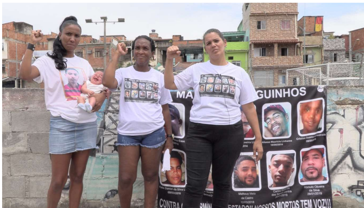
Mothers of Manguinhos, with a banner commemorating children killed in Manguinhos, from Right Now I Want to Scream (2020)

Militarised policing operations in Rio de Janeiro routinely last several days and employ high levels of force. During filming in 2019 the research team had to turn back three times because of Whatsapp message from our interviewees informing us that an operation was ongoing, and that it was not safe to meet – on one of these occasions someone was killed.