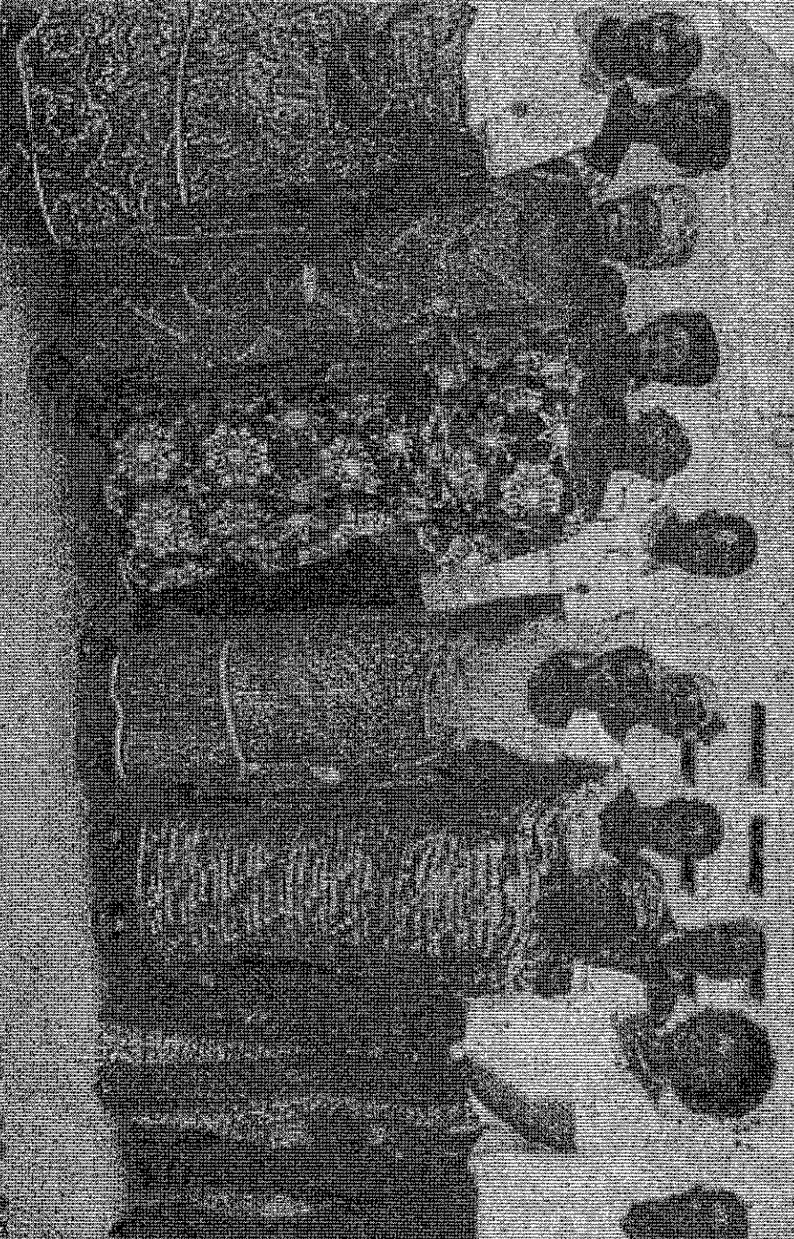
A group picture of members of the foundation

He advised parents who deliberately ignored the responsibilities of their children to change and be good parents so that they would receive support for their children in their old age.