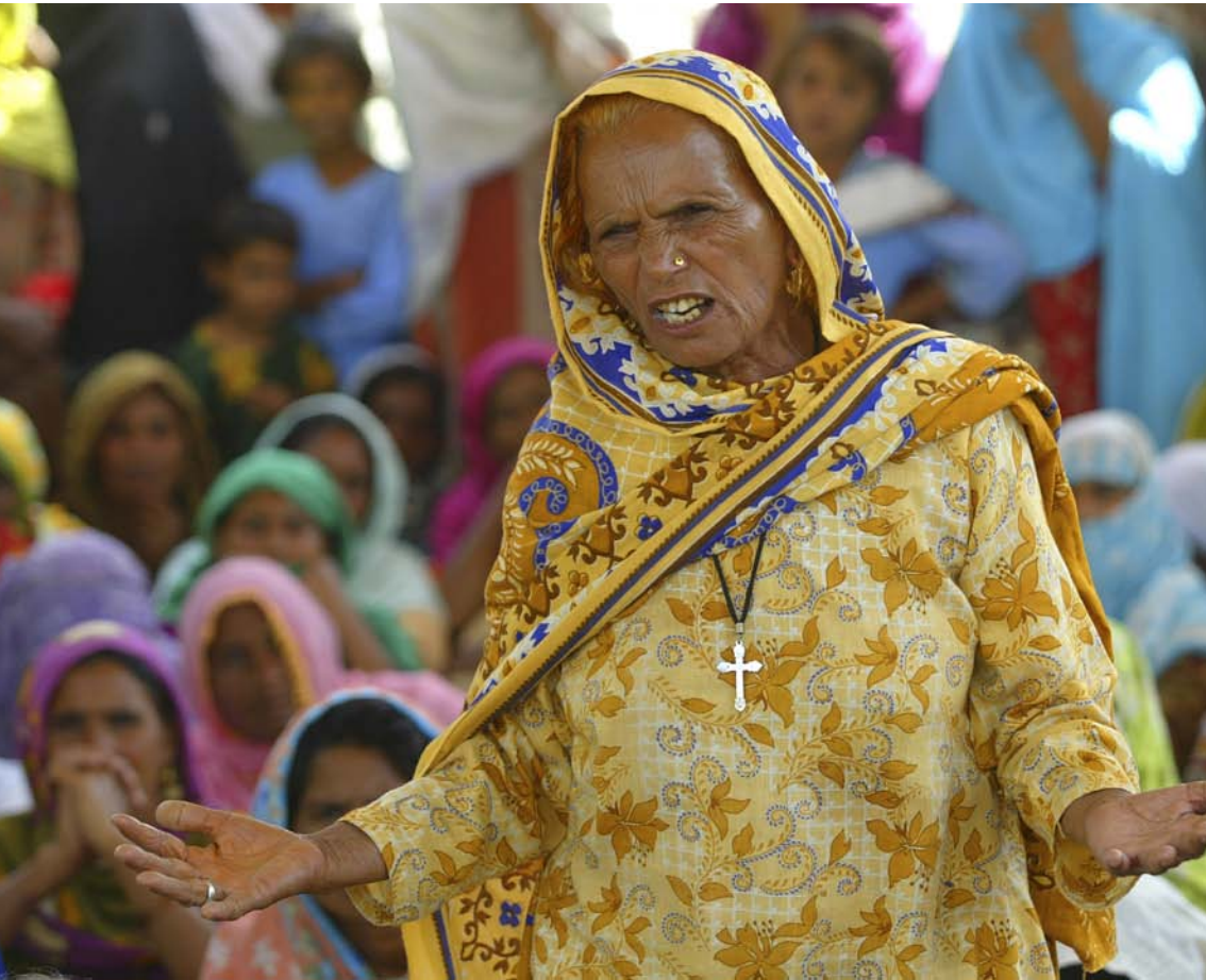
A Christian tenant farmer, South Asia.