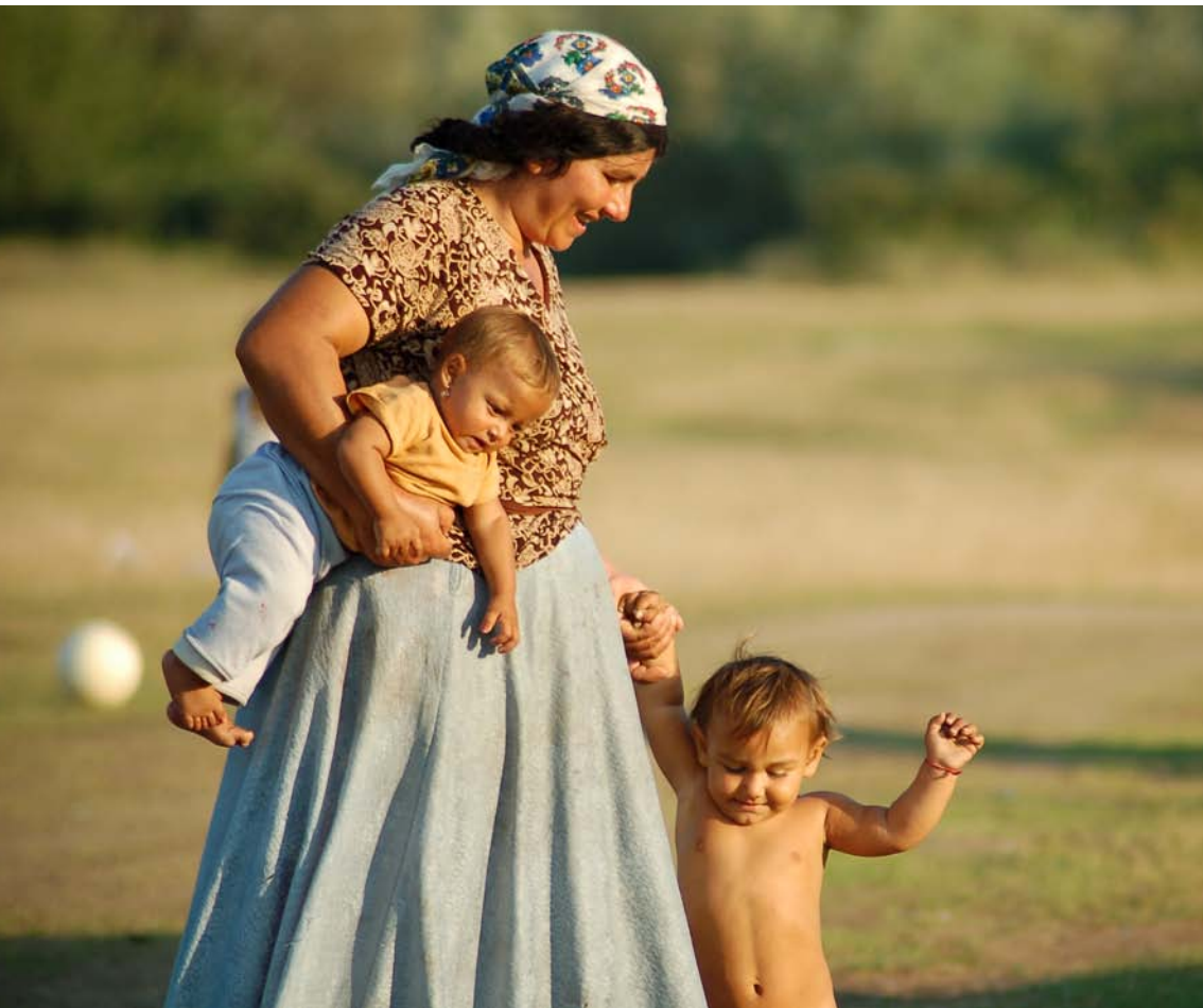
A Roma family, Eastern Europe.