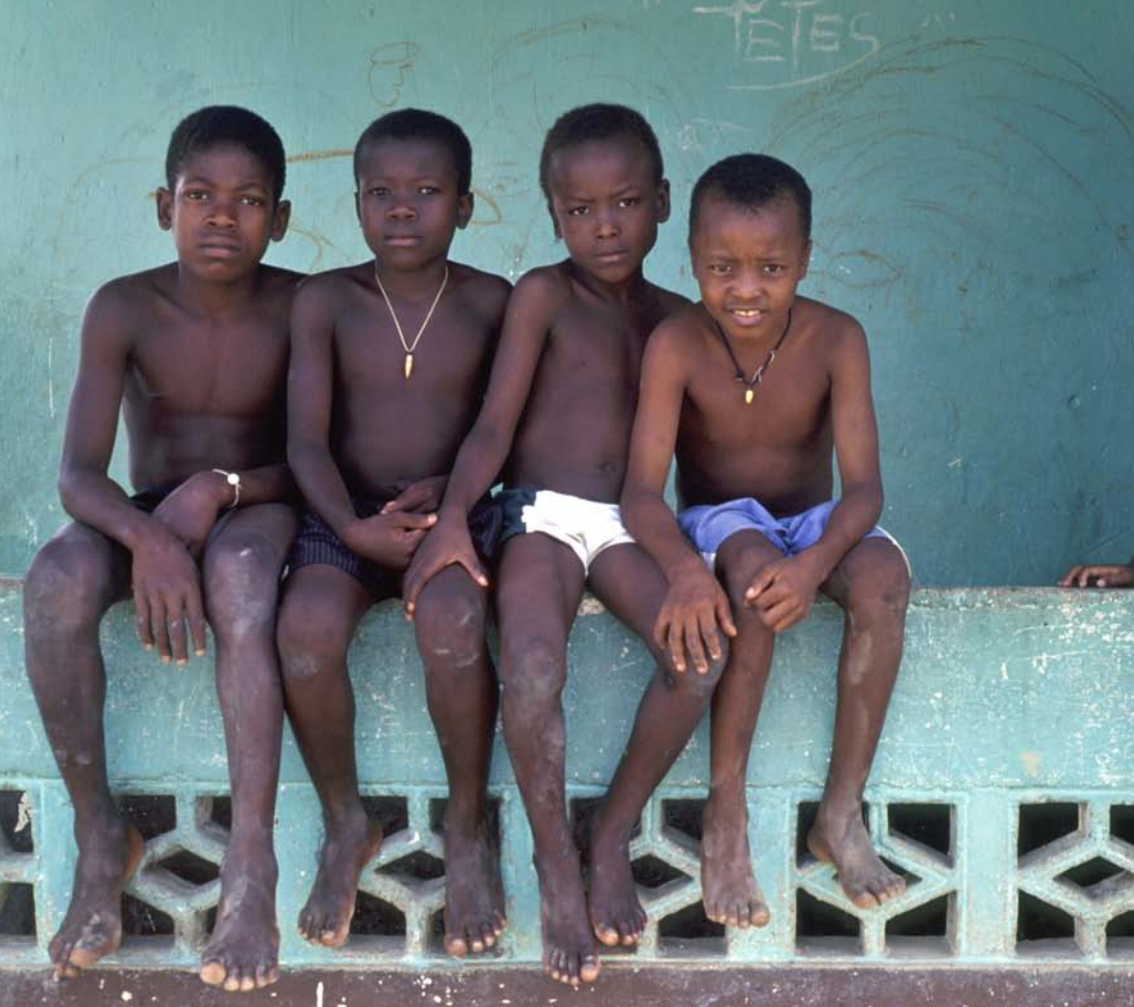
Afro-descendant children, South America.