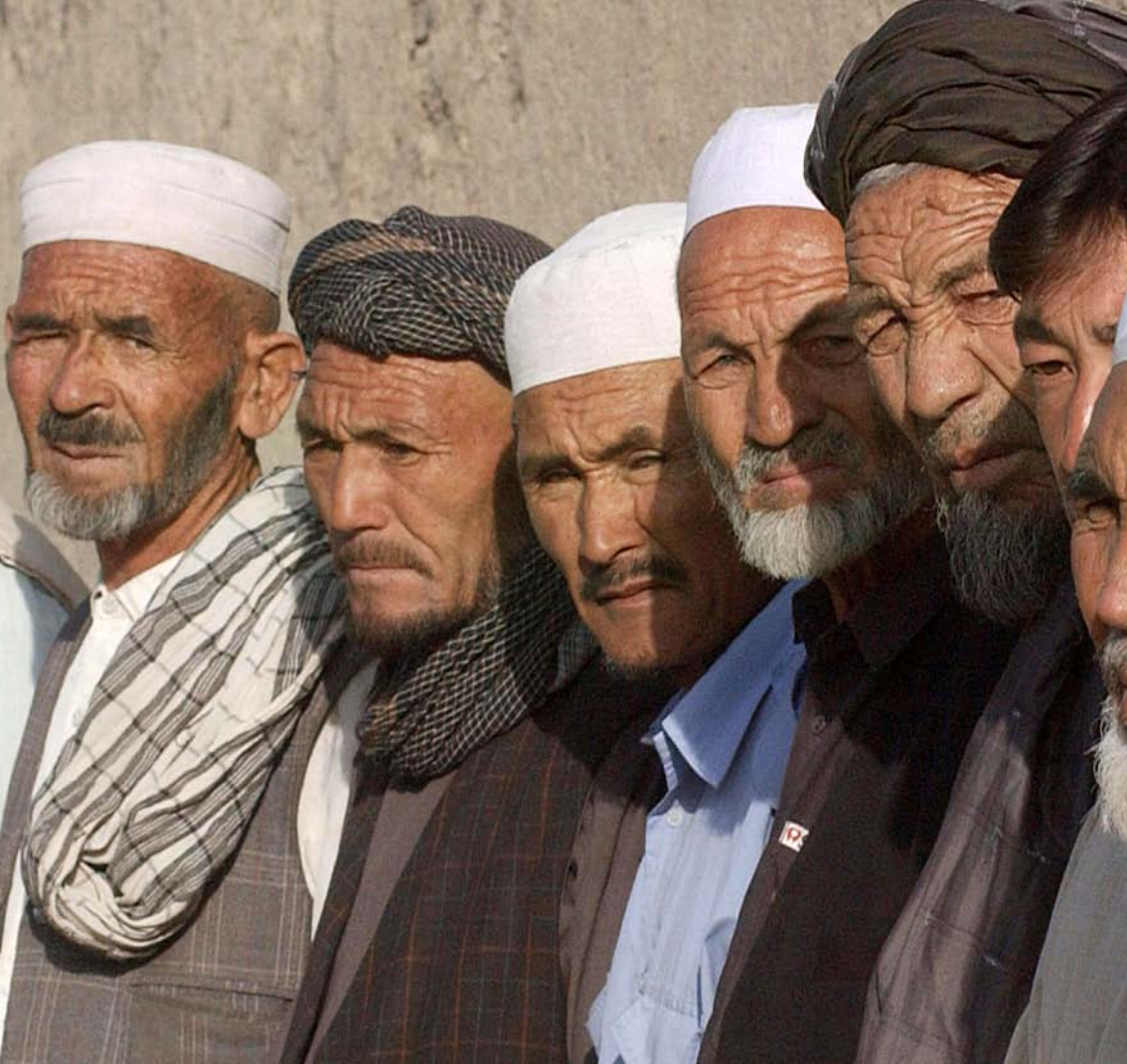
Hazara men queuing to vote, Southern Asia.