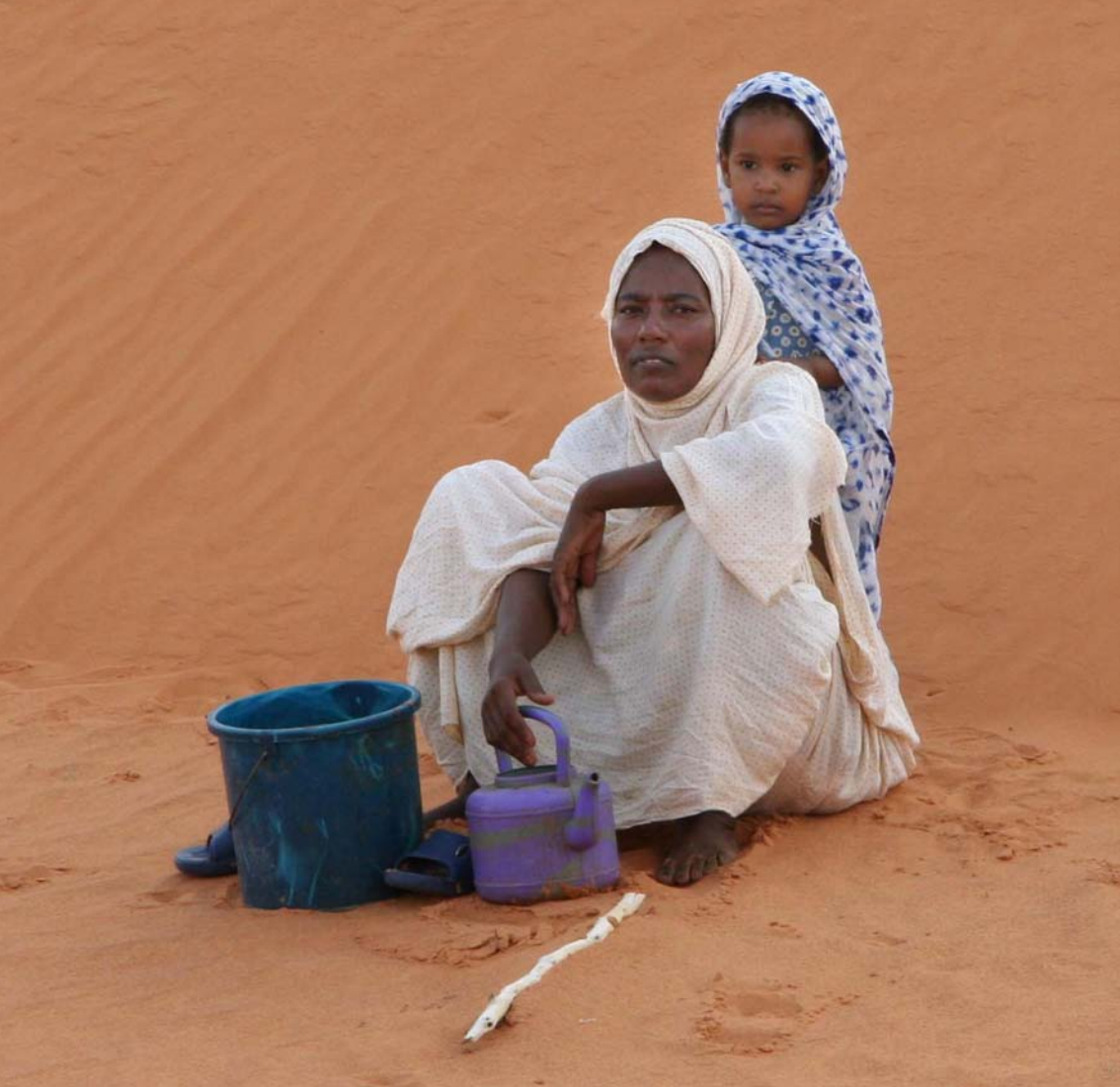
A Haratin mother and child, West Africa.