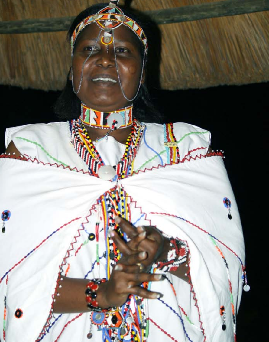
A Maasai woman, East Africa.