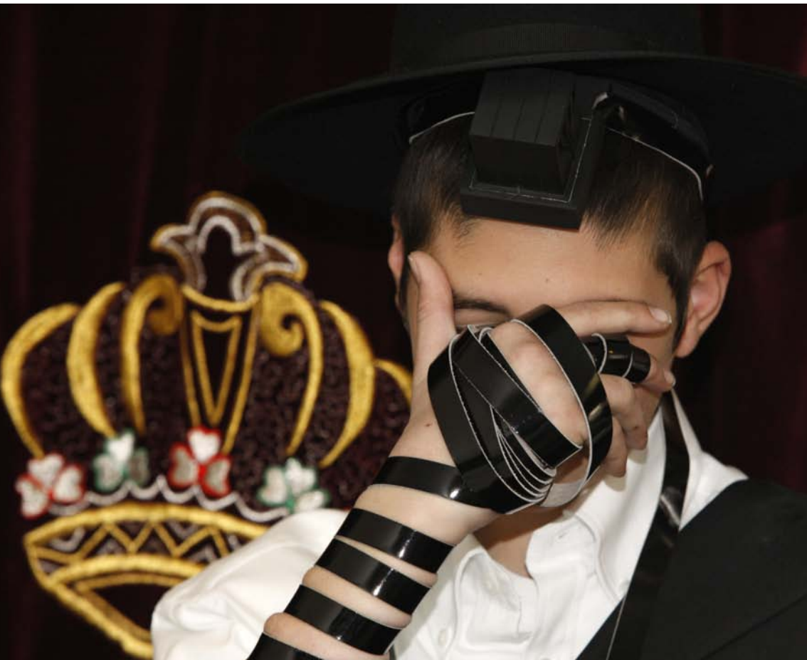
A Jewish boy in prayer, Western Europe.