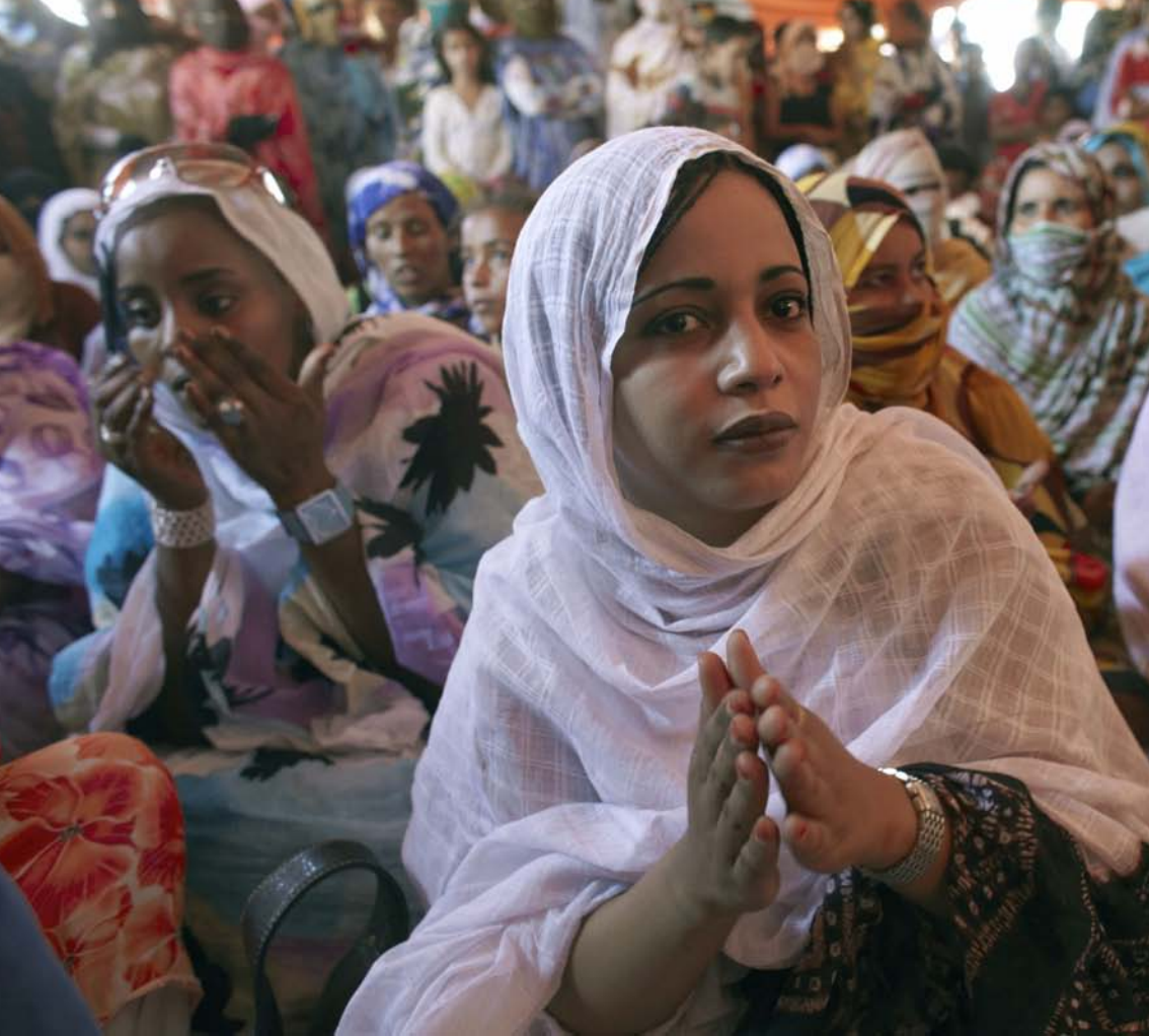
Saharawi women gathering for a wedding, North Africa.