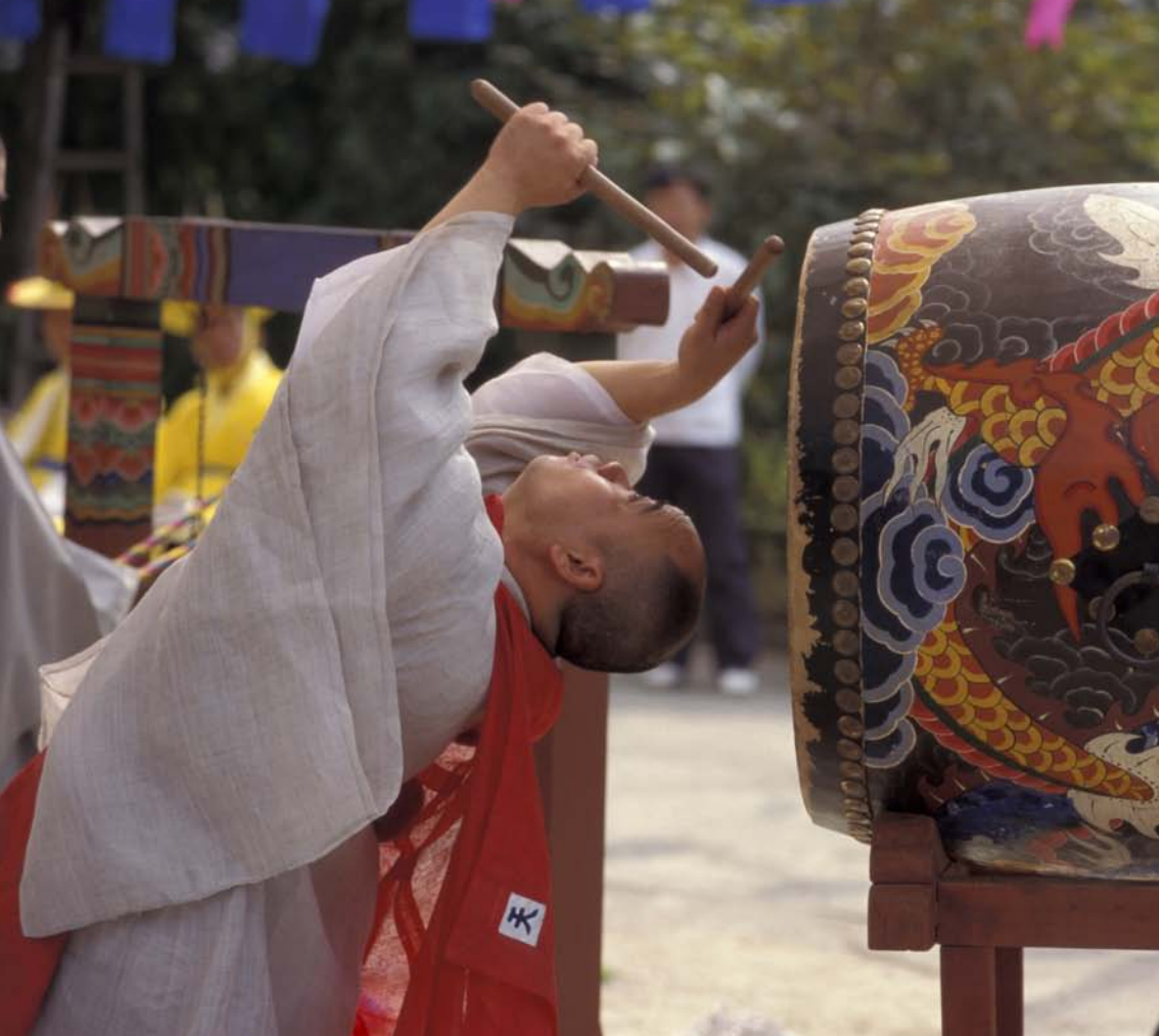
A Buddhist funeral rite, East Asia.