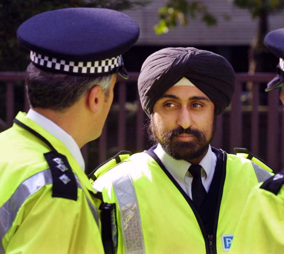
A Sikh police officer, Western Europe.