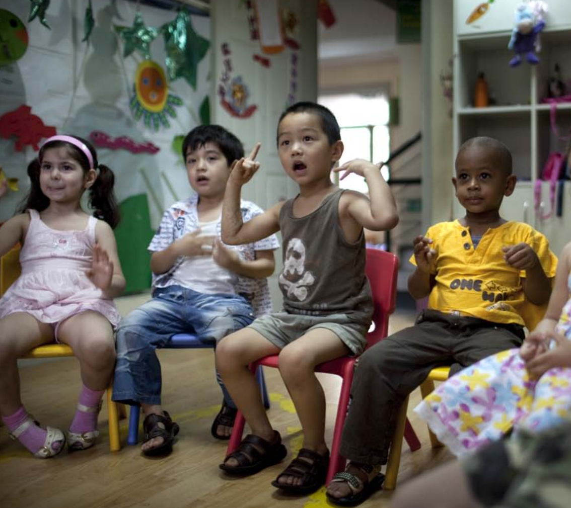
Muslim kindergarten pupils, East Asia.