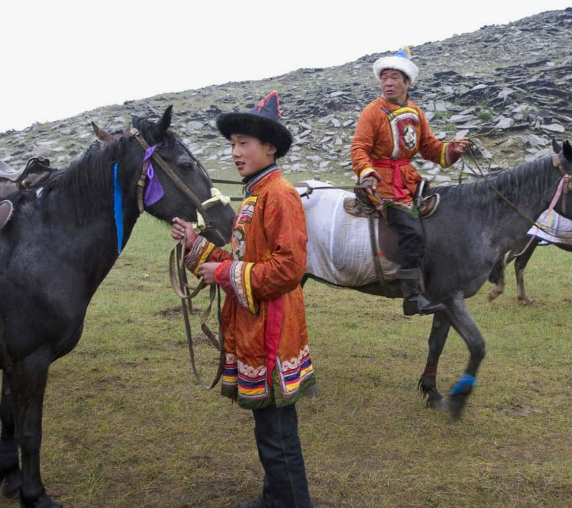
Buryat riders preparing to celebrate a festival, Central Asia.