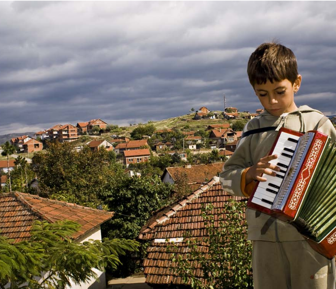
A Roma child making music, Southern Europe.