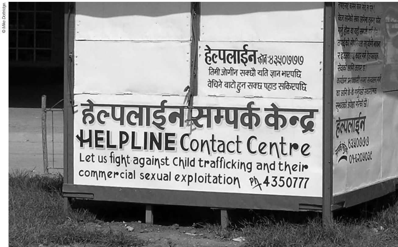
Photo 5 Advertisement for a Helpline in Kathmandu Bus Station (Nepal)

About 16 per cent of the calls in 2006-2007 were from children who had left home and wanted to return home, while 23 per cent concerned missing children (i.e., calls from either the parents of a child who had gone missing or from a child who had been separated from his or her parents or another concerned adult).