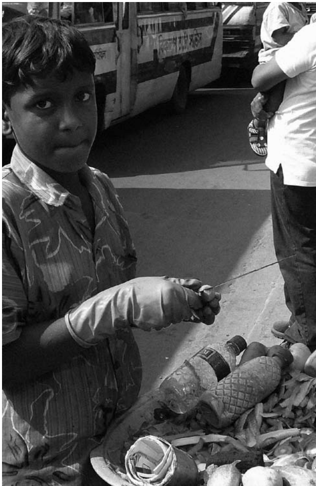
Photo 4 Boy selling food to travellers, Bangladesh.

Faced with large numbers of street children and the employment of vast numbers of young children (not just under 14, but even under 10) in agriculture, as domestics in private houses and in the informal economy, and the exclusion of most of these children from government-run schools, NGOs have developed schemes, over many decades, to prevent children from leaving home prematurely and to provide assistance to unaccompanied children who arrive in towns or