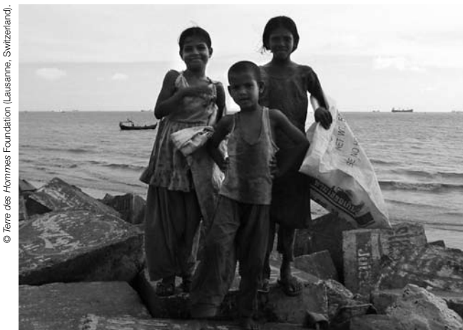
Photo 9 Girls working on Patenga beach (Bangladesh) after attending school.

that some alternatives and to empower them to make decisions for themselves, including the decision NOT to migrate in communities where this has become the norm. It seems that the recent priority given to the importance of attending school may have prevented some project planners from appreciating the importance of making other alternatives available to children, which are better than the ones facing them. If a child of 12 or 13 is faced with being sent away to work in harsh conditions, enabling the child to make money without going away, or enabling the child to find employment which does not involve such harsh conditions both represent an improvement.