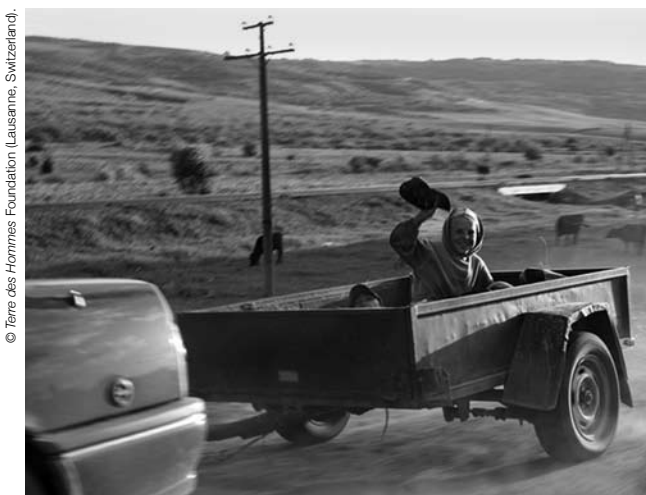
Photo 1 Children travelling in a trailer, Moldova.

As this quote suggests, a great deal of the attention given to child migrants and mobile children over the past couple of years has focused on identifying the ways in which such children are vulnerable to abuse, although there has been a gradual realisation that