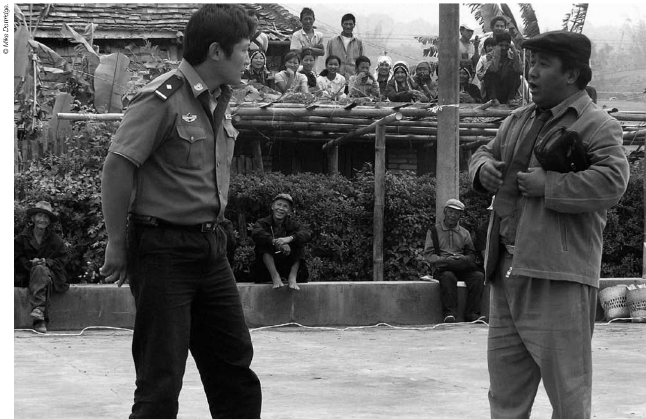
Photo 8 Policeman confronting a trafficker during a play about trafficking in persons in a village inhabited by an ethnic minority, Yunnan Province (China) 2006.