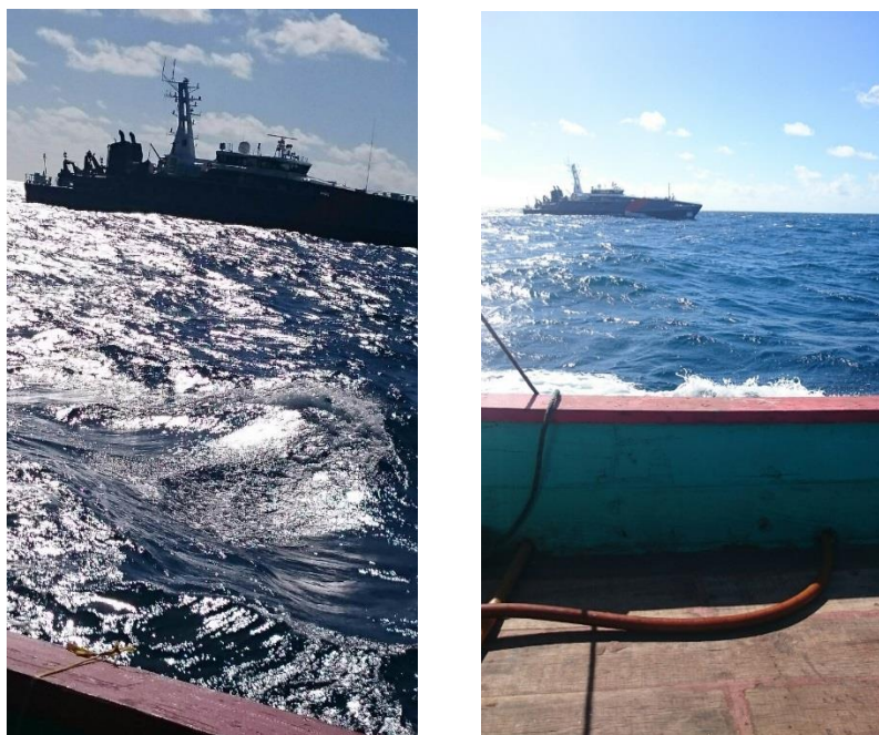
Australian border force ships, viewed from the deck of the asylum-seekers' boat, May 2015

The captain of the boat said he spent several hours on the Australian ship on 22 May, and spoke to a number of people. He told Amnesty International that a man who appeared to be "half-Australian and half-Indonesian" provided interpretation between himself and an officer from the Australian Border Force ship (although the captain of the asylum-seekers' boat also spoke English). Through the interpreter, the Australian officer told the captain that the Australians were worried about the people on the boat and wanted to help. He offered to take the passengers to Australia and send the crew by plane to Indonesia.