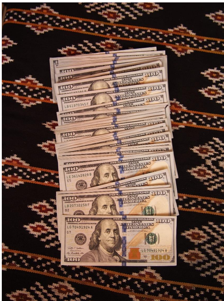
32,000USD which crew members told Amnesty International was paid to them by the Australian officials around 24 May 2015

The Indonesian police who detained the crew have confirmed publicly and to Amnesty International that the men had approximately 32,000 USD in their possession when they were apprehended. The police confiscated the money, and as of 19 August 2015, it was still in their possession. While on Rote Island in August 2015 Amnesty International researchers saw the money that was found on the crew, which consisted of dozens of new-looking 100 USD bills (see photograph), as well as a document listing the serial numbers of all the bills.