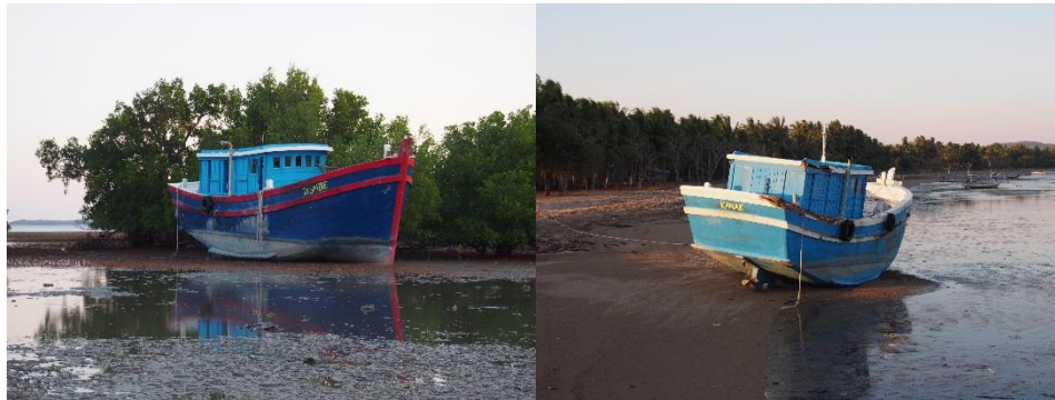
'Jasmine' (left) and 'Kanak' (right) having been towed to Rote Island by Indonesian officials, August 2015

Once everyone came on board Kanak, which was then even more overcrowded, the crew managed to steer the boat to Landu Island, another Indonesian island near Rote Island, where it struck a reef in the late afternoon on 31 May 2015. No one was injured or killed. Local people helped rescue them, and gave them food and dry clothes. Amnesty International delegates saw Kanak and Jasmine, which had been towed to Rote Island by Indonesian officials (see photographs).