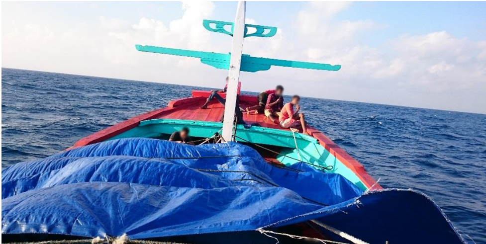
Photo taken by an asylum-seeker on the two-deck boat which had departed from Indonesia. The photo was taken prior to interception and transfer onto two smaller boats by Australian Border Force May 2015

“agents” in Jakarta, to undertake the journey. 24 The asylum-seekers said that the six crew were not armed. 25 Police officers told Amnesty International that five of the crew were Indonesian, and a sixth was Sri Lankan. 26