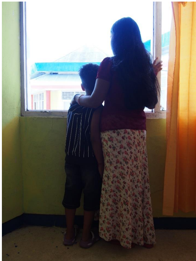
Asylum seekers in immigration detention in Kupang, East Nusa Tenggara after their boat was intercepted and turned back by Australian officials, August 2015

Letter to Amnesty International from the 65 asylum-seekers turned back by Australia in May 2015