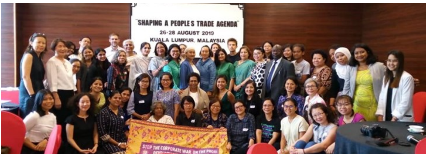
Delegates to the Asian –Pacific Forum , Kuala Lumpur discuss current democracy and trade related challenges in the region.

26 th –28 th August 2019: The 2019 Asia Pacific Forum on Women, Law and Development's regional consultation on 'shaping a peoples' trade agenda', Kuala Lumpur, Malaysia