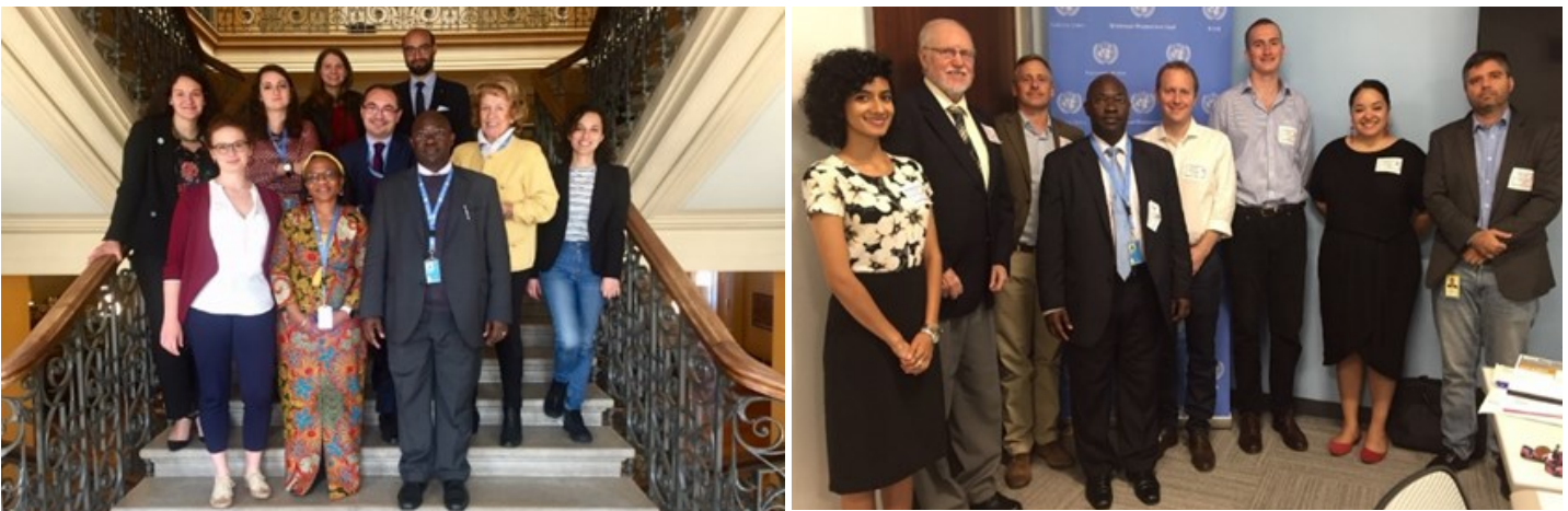
Participants at the informal consultations with civil society in Geneva (left) and Washington DC (right) in May 2019

In preparation of the two reports, the Independent Expert convened two informal consultations with civil society in Geneva and Washington DC in May 2019 (see photos), and sent out a questionnaire to Member States and civil society. Responses to the questionnaire can be found here: https://www.ohchr.org/EN/Issues/IntOrder/Pages/GlobalGovernanceSpaces.aspx