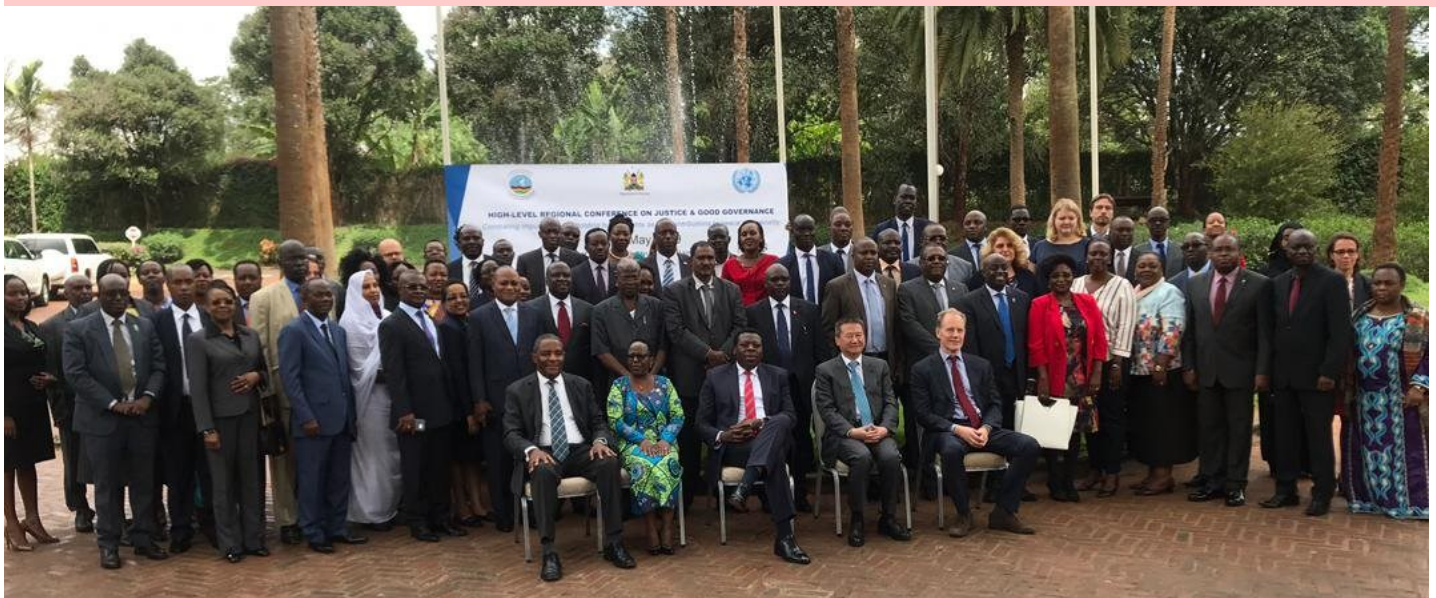
Delegates to the ICGLR with the Minister of Justice (Republic of Kenya) 3rd on the 1st row and UN Envoy to Great Lakes Region 2nd right and UN Assistant Secretary General for Human Rights 1st on the right.

The high-level regional Conference on Justice and Good Governance in the Great Lakes region, convened by the International Conference on the Great Lakes Region, the Office of the Special Envoy of the Secretary-General for the Great Lakes Region and OHCHR, Nairobi.