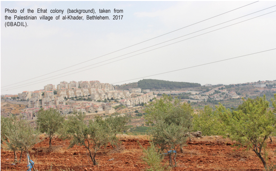
Photo of the Efrat colony (background), taken from the Palestinian village of al-Khader, Bethlehem. 2017.

After the 1967 occupation, legislation similar to the Israeli Absentee Property Law was extended to the West Bank vis-à-vis the properties of Palestinians