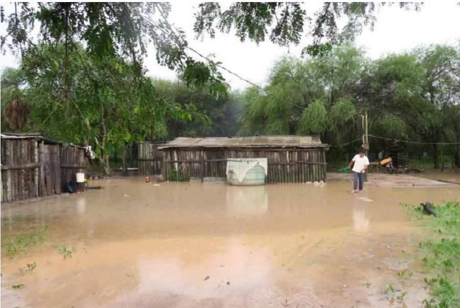
Yakya Axa community after floods, March 2019