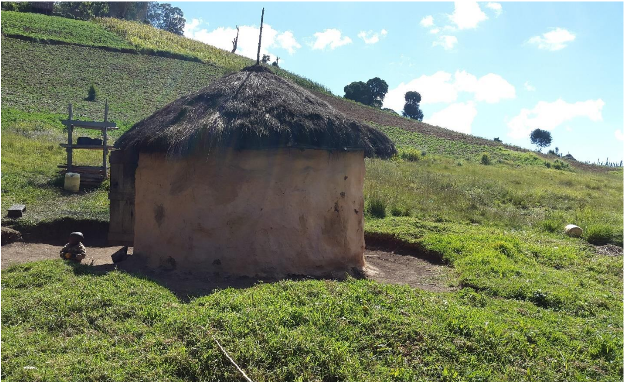
Former potato store, now housing evicted Sengwer family of 5, outside forest, 2017.