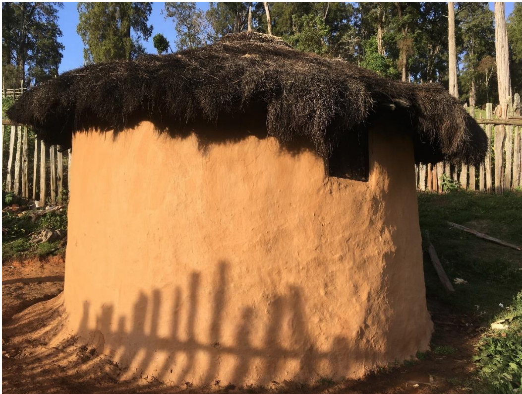
A traditional Sengwer hut in Embobut Forest