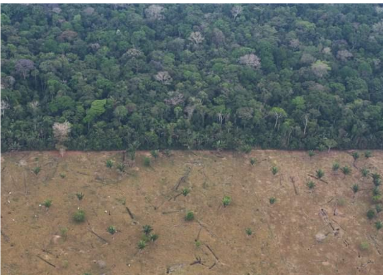
A boundary of Uru-Eu-Wau-Wau territory in Rondônia state, Brazil. The legal recognition of Indigenous territories can play a protective role against deforestation.