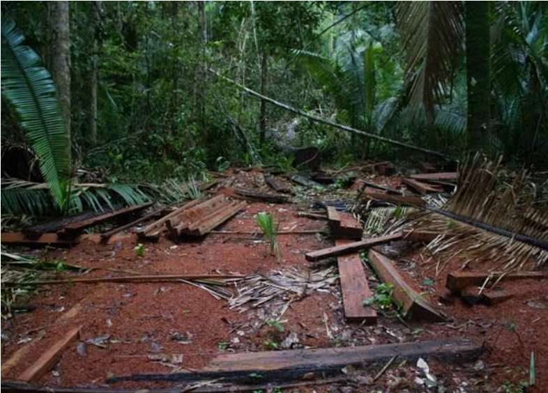
Illegally logged timber in Uru-Eu-Wau-Wau territory in Rondônia state, Brazil, 2019.