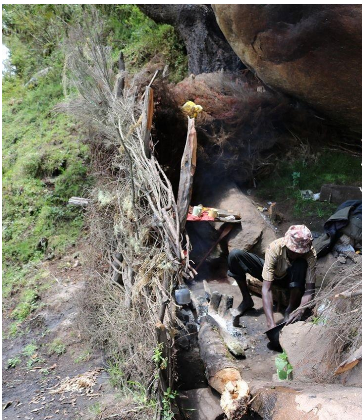
A makeshift dwelling in Embobut forest, December 2016