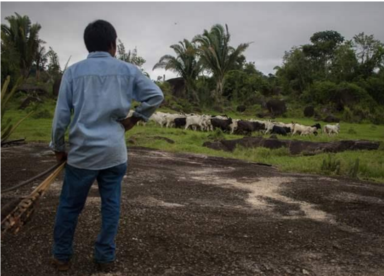
An Indigenous man observes cattle near Uru-Eu-Wau-Wau territory in Rondônia state, Brazil, 2019. Cattle ranching is one of the major drivers of deforestation in Brazil's Amazon.