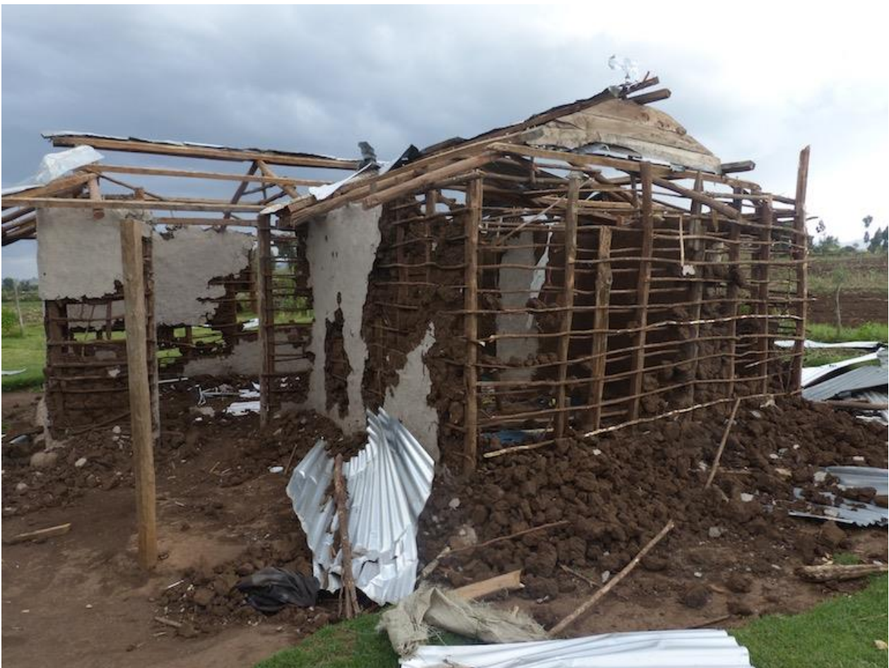
An Ogiek family's house inside the Mau Forest Complex. Police officers and civilians allegedly destroyed it during evictions of Ogiek from the forest.