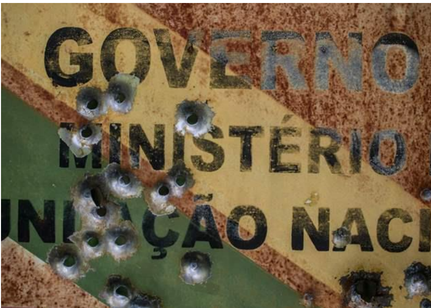
A sign from Brazil's National Indian Foundation (FUNAI) declaring the Uru-Eu-Wau-Wau territory (in Rondônia state, Brazil) "Protected Land" was shot following an intrusion in January 2019.