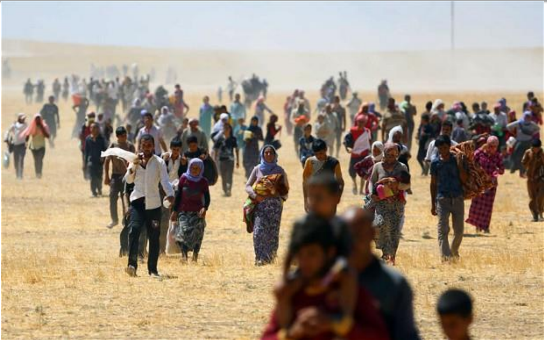
Yezidi refugees, Iraq