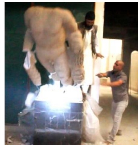
Nimrud & Mosul Museum, Iraq 2015