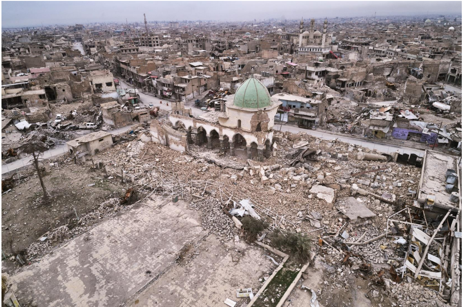
Al Nuri Mosque, Mosul, Feb. 2018 (UNESCO)