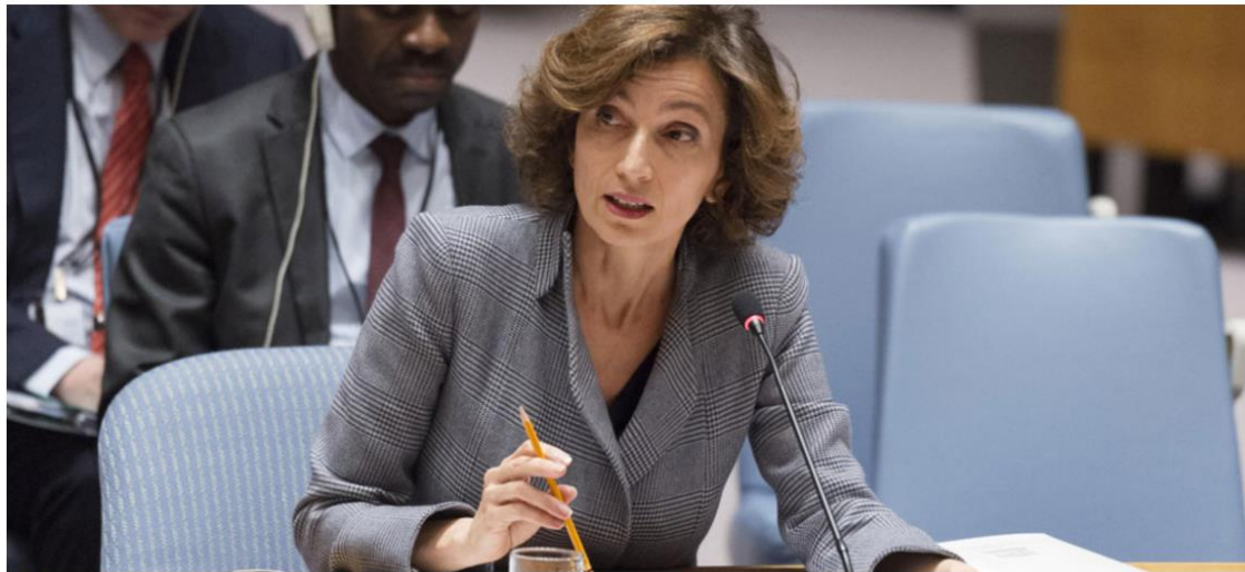
Audrey Azoulay, Director-General of UNESCO briefs the Security Council meeting on Maintenance of international peace and security, destruction and trafficking of cultural heritage by terrorist groups and in situations of armed conflict.

Security Council hears calls for 'all of UN' approach to stop destruction, smuggling of cultural heritage