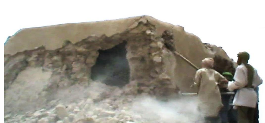
Destruction of 14 Mausoleums, Timbuktu, Mali