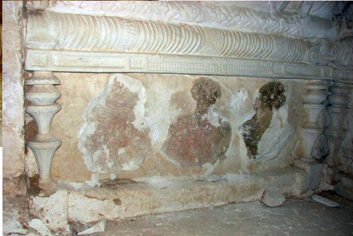
Taibul Tomb, Palmyra, Syria, November 2014