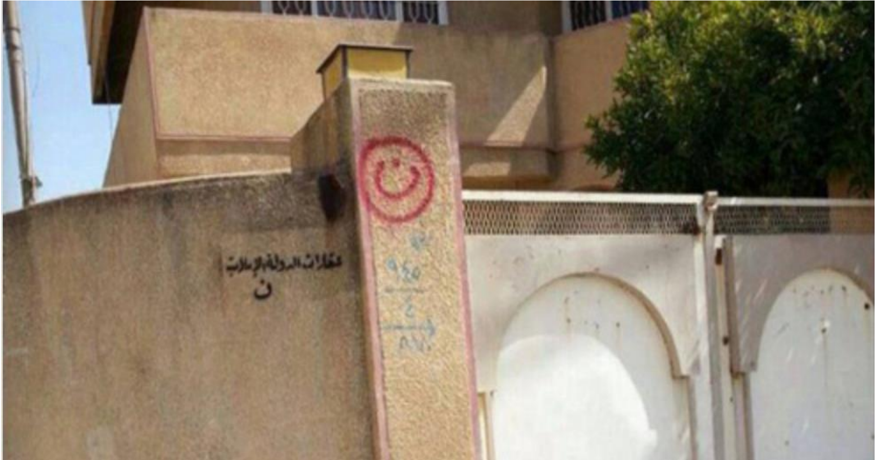
Christian homes marked with the letter « noun »