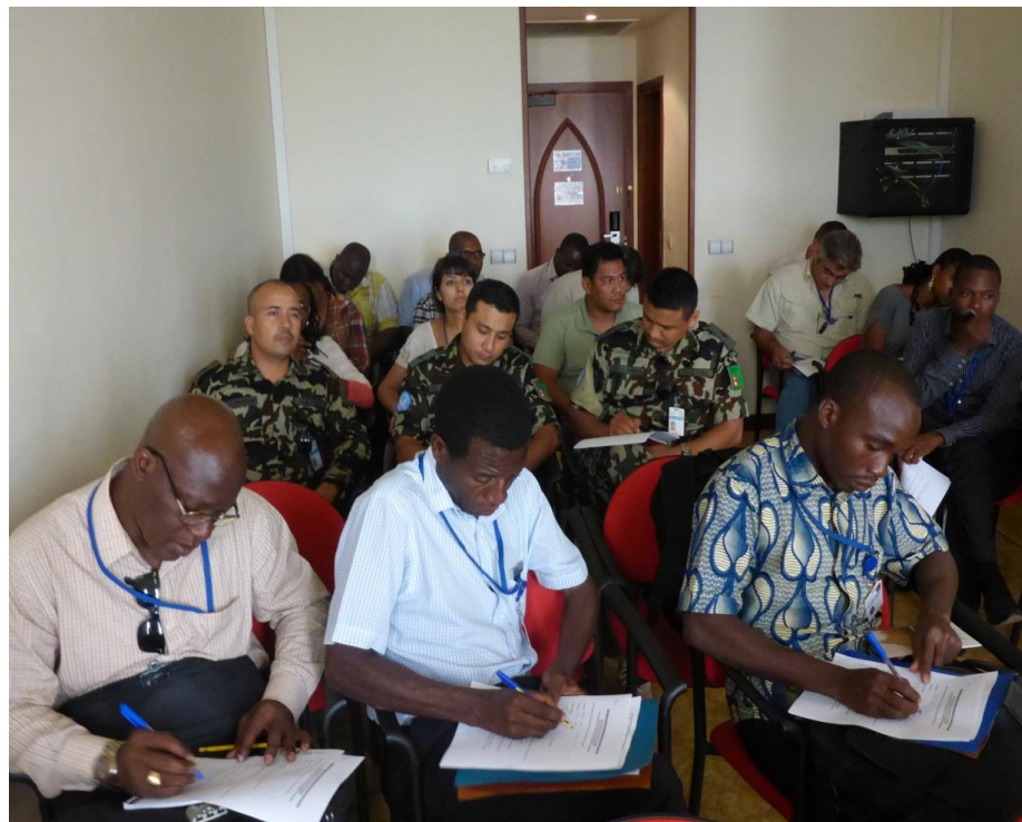
Workshop for the MINUSMA staff (Mali)