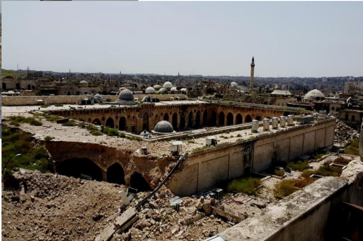
Omayyad Mosque, Syria