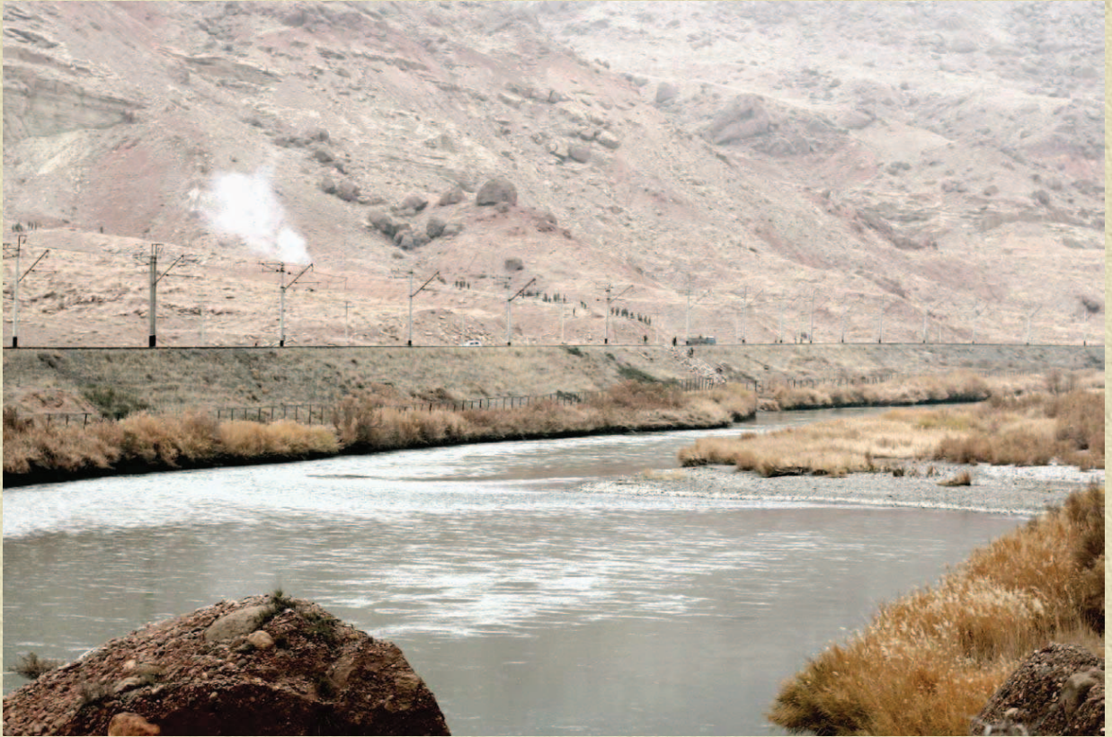
Photo: Armenian Apostolic Church Diocesan Council, Tabriz, Iran – 12/2005

Destruction of the Armenian Cemetery in Djulfa, Nakhichevan (Azerbaijan)