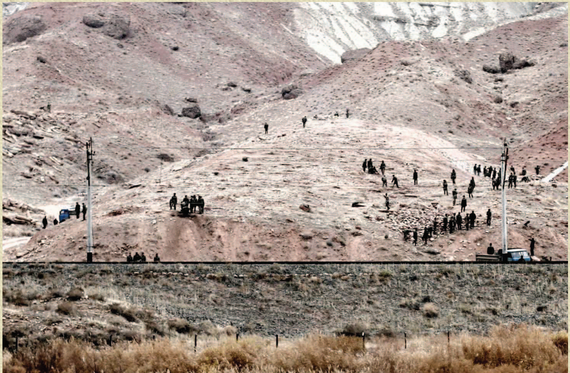
Soldiers removing remnants of the Djulfa Armenian cemetery graves.