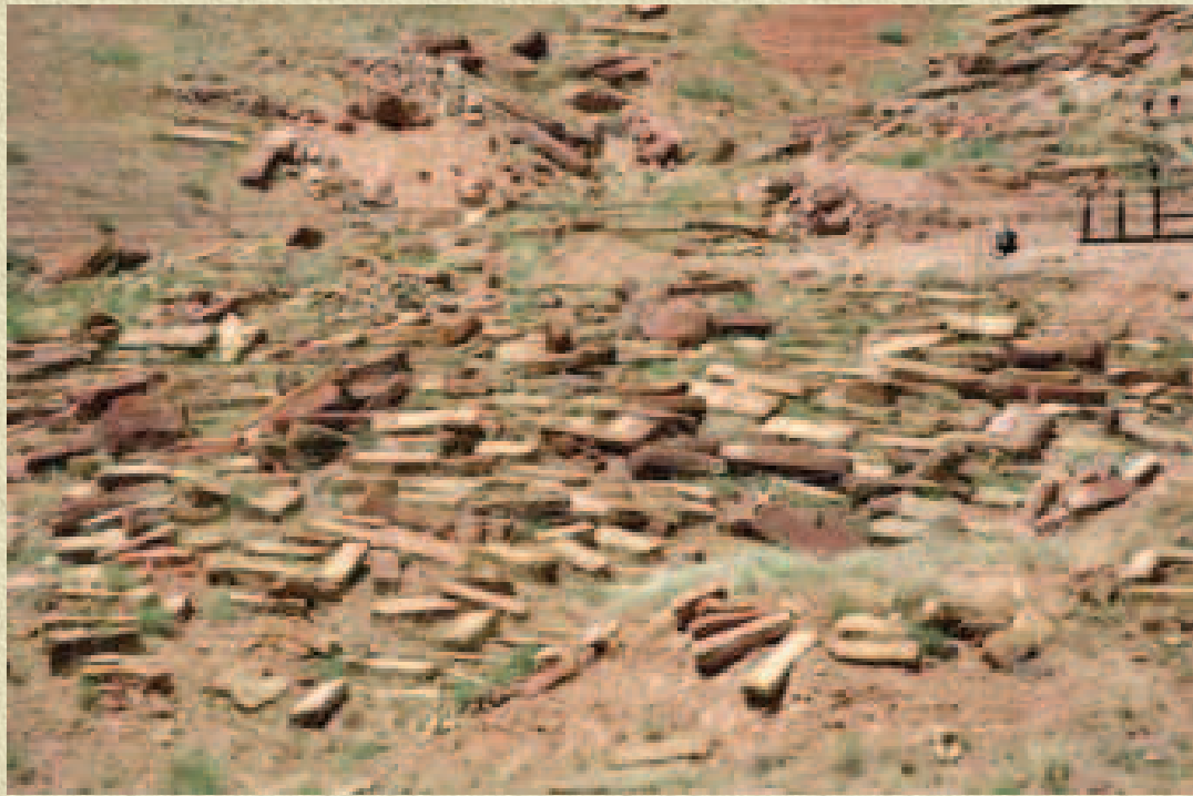
Armenian cemetery of Djulfa khatchkars in ruins.