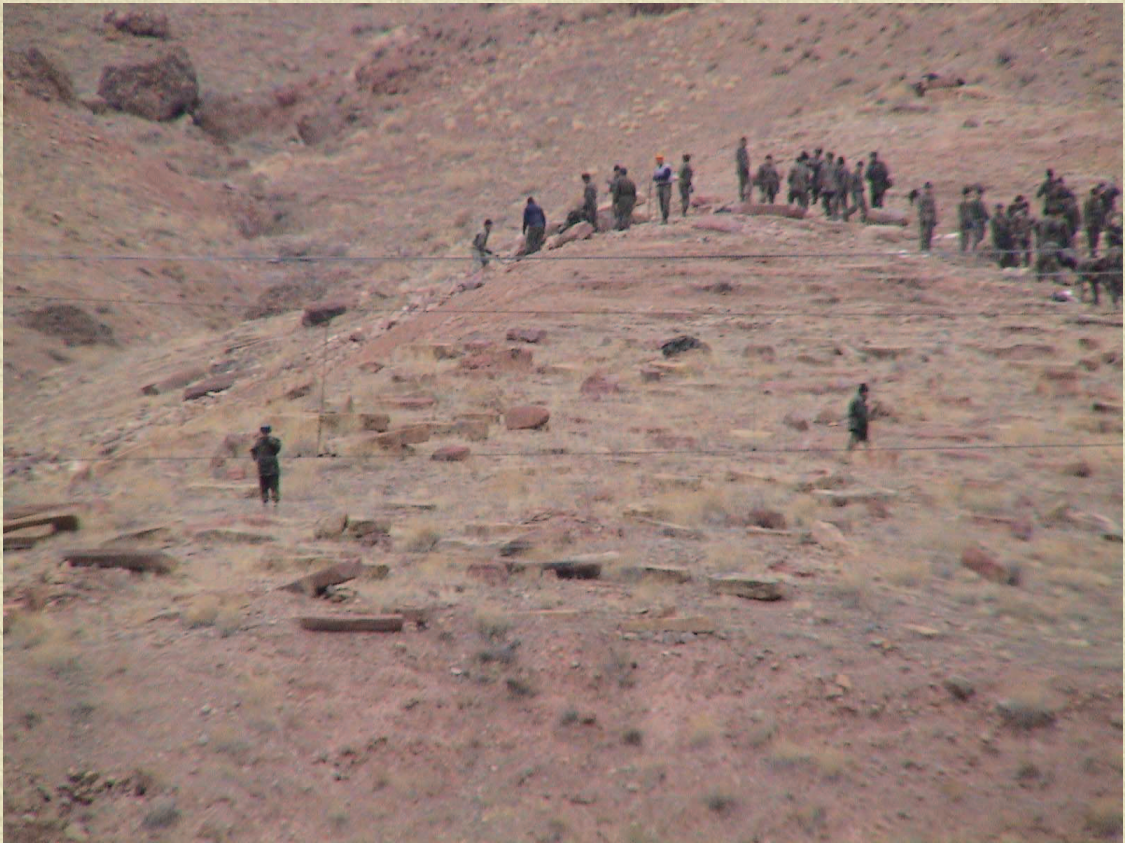
Photo: Armenian Apostolic Church Diocesan Council, Tabriz, Iran – 12/2005

Destruction of the Armenian Cemetery in Djulfa, Nakhichevan (Azerbaijan)