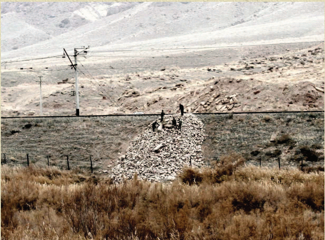
The broken cemetery stones were rolled down into the Arax river.

Photo Credit: Armenian Apostolic Church Diocesan Council, Tabriz, Iran – 12/2005