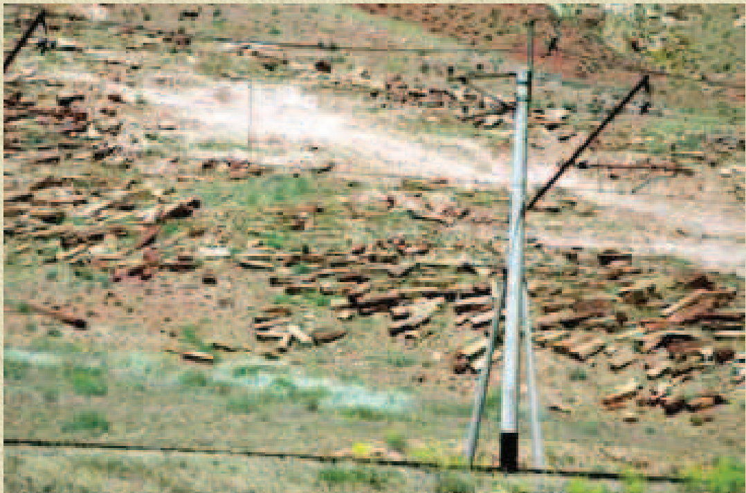
Armenian cemetery of Djulfa khatchkars in ruins.