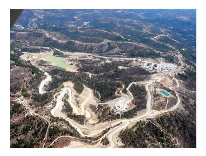
Photo Credit: Sipacapa and San Miguel Ixtahuacan, San Marcos Guatemala; This is an aerial shot of the mining company's operations, which cause destruction of biodiversity, contamination of water by cyanide, natural resources, etc..

Marlin 1 open pit strip mine, which uses highly toxic sodium cyanide for ore extraction, is located in the Indigenous municipalities of Sipacapa and San Miguel Ixtahuacán and has been the focus of controversy and opposition by local communities since it was established in 2004.