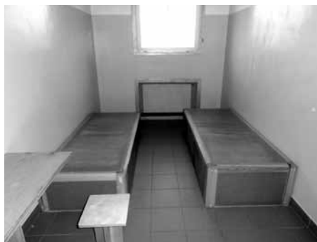
Room for detained persons at the PDR in Kartuzy