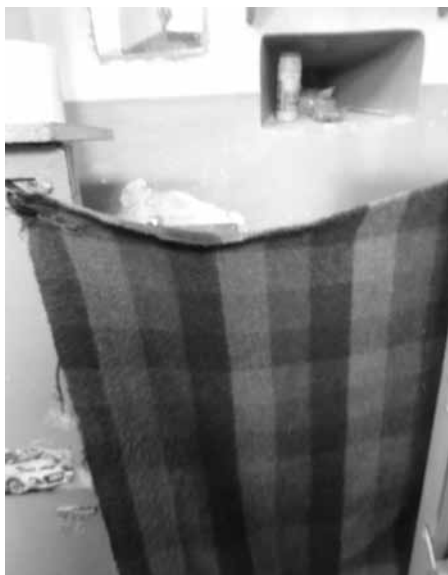
Toilet with a blanket instead of the door in the residential cell of the Prison in Racibórz