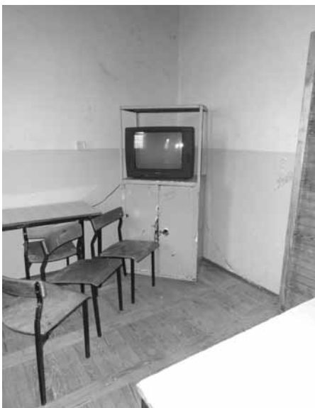
Community room for prisoners at the therapeutic ward of the Prison in Wronki