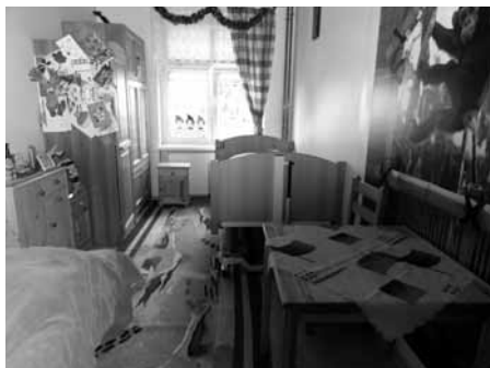
Room for residents at the Social Care Centre for children in Poznań