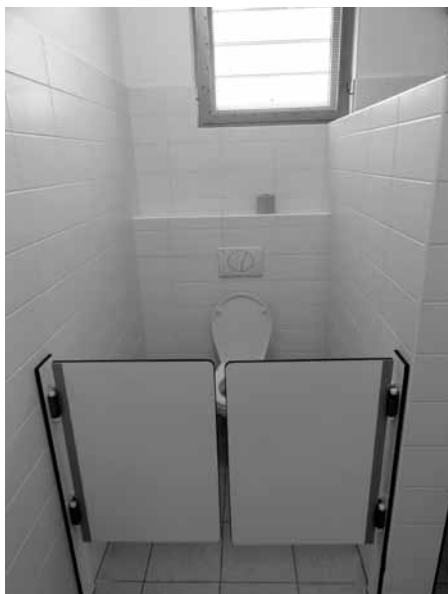
Toilet for detained persons at the PDR in Kartuzy