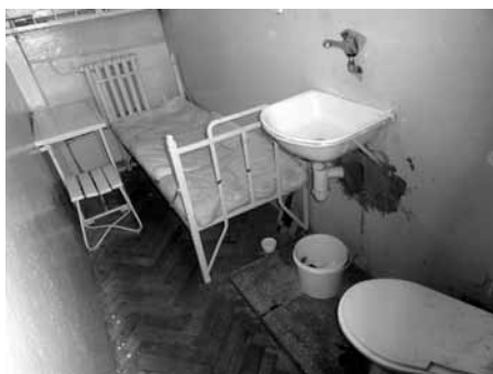
Isolation cell in the Prison in Płock