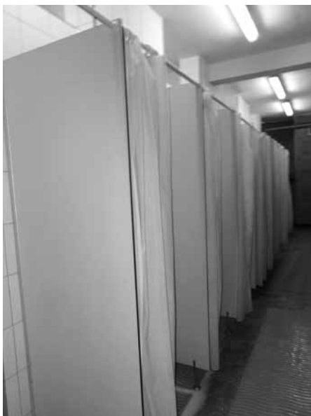
General bathroom with separate showers at the Prison in Wronki