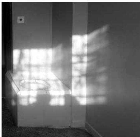
Toilet in the room for intoxicated persons at the Sobering-up Station in Konin