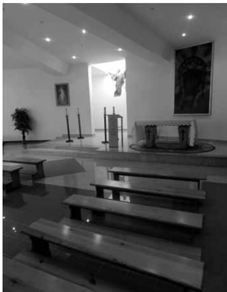
Chapel at the Social Care Centre in Wieleń