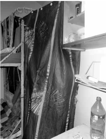
Residential cell in the Pre-Trial Detention Centre in Chełmno (view of the toilet)