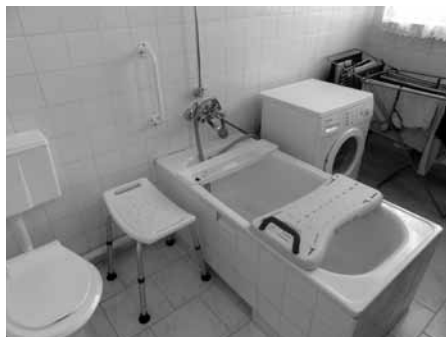
One of the bathrooms for residents at the Social Care Centre in Wieleń