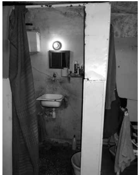
Residential cell in the Prison in Płock (view of the toilet)