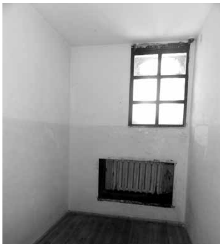
Separate residential room in the Juvenile Detention Centre and Juvenile Shelter in Świdnica