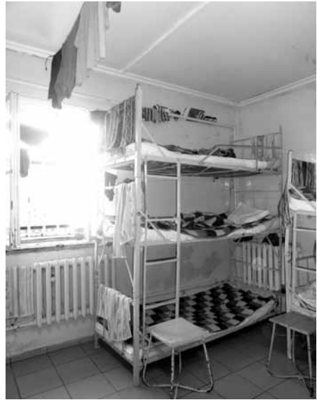
Three-storey bunker bed in a residential cell of the Prison in Stargard Szczeciński