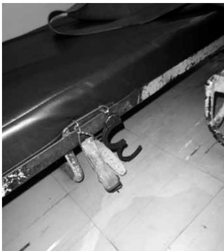
Bed for the application of a coercive measure (immobilisation) to intoxicated persons at the Sobering-up Station in Suwałki