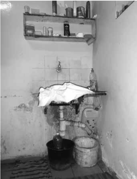
Toilet in the residential cell in the Prison in Stargard Szczeciński