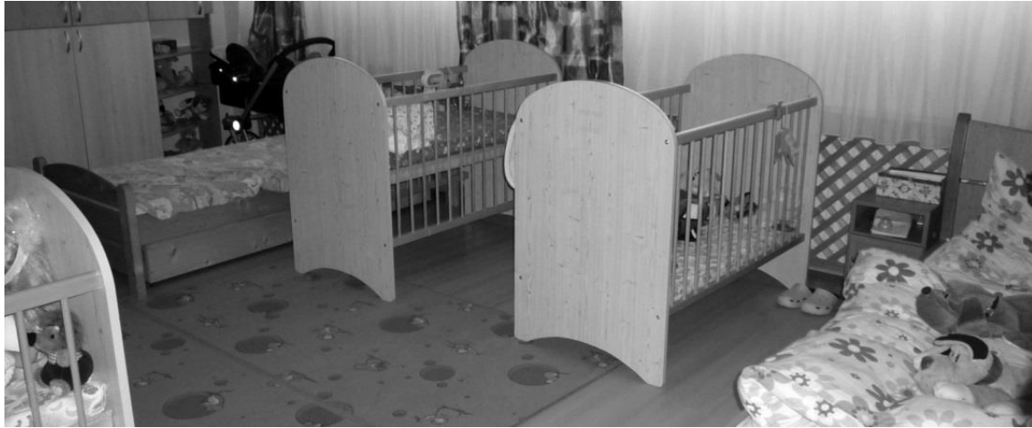
Reménysugár Children's Home

difficult by either serious disability or the need of the joint placement of siblings. The ten staff members of the children's home take care of the children under three in turns, which makes the formation of personal attachment impossible. The majority of children attended kindergarten or school outside the institution; their systematic development and engagement were ensured in the children's home as well.