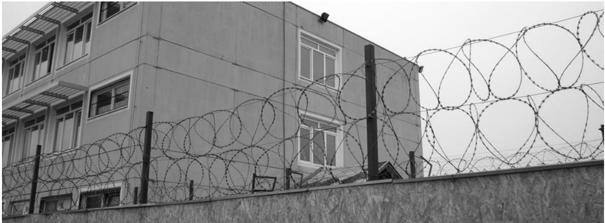
At the time of the visit, there were some children detained in the GRRC.

Despite the fact that even the longest period spent in the GRRC by one of its current residents was less than two weeks, this period had also left some psychological marks. Many of the detainees complained that, in the absence of organized programs, as a result of day-long inactivity, detention was rather wearing not only physically, but also mentally.