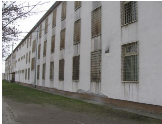
Juvenile Penitentiary Institution (Tököl)

The OPCAT is open to accession by any State that has ratified or acceded to the UN Convention against Torture and other Cruel, Inhuman or Degrading Treatment or Punishment. 2 Hungary acceded to the Protocol on January 12, 2012, more than two decades after ratifying the UN Convention. The Parliament designated the Commissioner for Fundamental Rights 3 as the national institution conducting regular, unannounced visits to places of detention (hereinafter the “National Preventive Mechanism, NPM” 4 ). I have to carry out this task as of January 1, 2015. 5