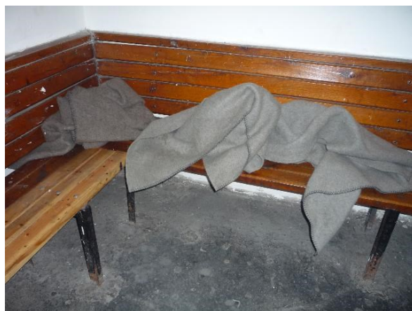
Custody room at the Police Department

to the custody rooms or elsewhere. Should an expecting woman or a woman with a child be arrested, they are placed not in a custody room but in the hallway of the reception area or in the adjacent room.