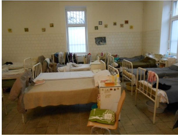
Ward in the FPMI

The FPMI's catering practices were in compliance neither with the relevant legal regulations on catering in inpatient institutions nor with state of health and lifestyle of the regular and sent-in patients. I requested the Head of the Office of the Chief Medical Officer and the Chief Medical Director to address this problem.