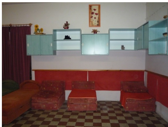
Residential room in the institution

There were apparently few personal items in the residents’ rooms. The shelves were empty except for some soft toys. I also pointed out that, in addition to the small living space, the residents’ private sphere was also compromised by the lack of personal items. I requested the head of the institution to make the residents’ immediate environment more personal, to encourage them, through the caretakers, to put items on the shelves to make their surroundings cozier.