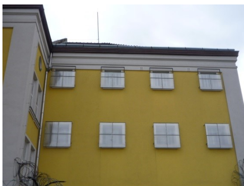
View-blockers on the cell windows of the Sátoraljaújhely Strict and Medium Regime Prison

There were view-blockers installed on the windows facing the street, which, obstructing natural lighting and ventilation, made staying in the cells intolerable in the summer heat. The situation would be a bit improved after replacing the upper third of the blocker with polycarbonates.