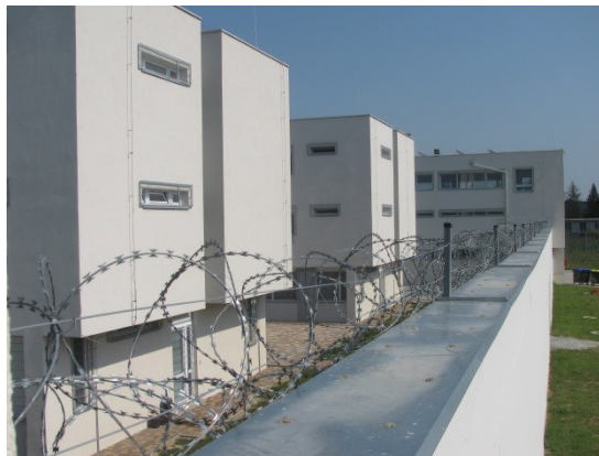
Reformatory, Nagykanizsa Unit

The selection of these locations was motivated by the opening of the Nagykanizsa Unit in late 2015, as a result of which the total capacity of the Hungarian reformatory system had increased by 25 percent. The Nagykanizsa unit is the sole reformatory in Western Hungary. The material conditions of placement in Nagykanizsa were excellent. In Debrecen, the sanitary unit was in need of renovation. The personal items of the detainees could not be seen at either location; the absence of such items was even more apparent in Nagykanizsa due to the bleak decoration. Impersonality was augmented by the prohibition to wear one’s own clothing.