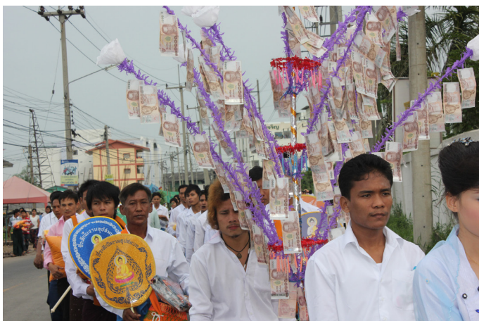
(Photo: Migrants from Myanmar celebrate traditional Buddhist festivals in Central Thailand)

In August 2010, rights groups campaigned for re-opening of migrant registration due to an increasing number of undocumented migrants in Thailand, increasing reports of extortion and corruption and so as to allow all migrants to enter NV. At the same time, employers called for a new registration to address ongoing shortages of low-skilled workers. Despite the Government's insistence that no new migrant registration would be allowed and only unregistered migrants returning to home countries and entering through MoUs could work legally in Thailand, in September 2010 the MOL announced there may be a new registration to ensure one million workers could become legal after all.