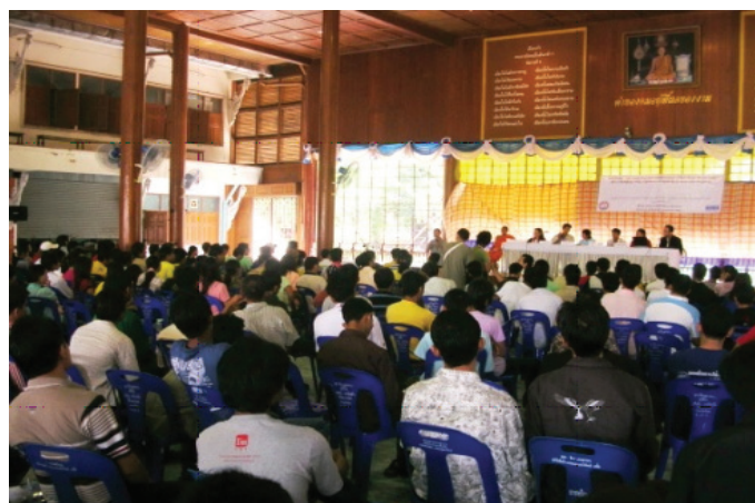
(Photo: Migrants from Myanmar in Samut Sakorn attend a Seminar on Migrant NV Registration in February 2010)

Since 2008, the TG announced plans to prioritise migrant regularisation, particularly NV for documented migrants already in the country, which by 2010 totalled 1.3 million persons. Negotiations between the TG and Myanmar to prevent Myanmar migrants, who make up around 80% of all migrants in Thailand, from having to return home to complete NV had been relatively unsuccessful over the years. The Governments of Cambodia and Laos PDR were amenable to sending officials to Thailand to carry out NV and issue Col’s and passports to their nationals. NV of Myanmar migrants actually began at the end of 2009, 3 years after the start of the process for Cambodian and Laotian migrants. Myanmar’s opening of a NV center in Ranong Province in Southern Thailand in July 2010 was a significant step forward for Thailand’s regularisation efforts. Many Myanmar migrants in Northern Thailand still must return to Tachilek Province in Myanmar to complete NV however