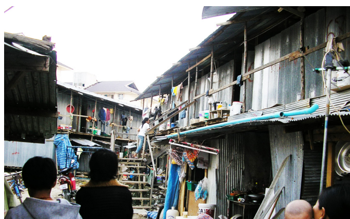
(Photo: A Shan migrant construction camp's accommodation in Northern Thailand)

This Cabinet decision was a significant reversal in migration policy as the TG had previously stated that only migrants