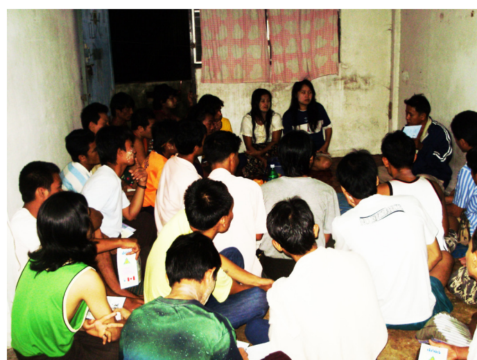
(Photo: Migrants in Central Thailand gather to listen to information on occupational health and safety and labour rights from NGO workers)

Thai officials made greater effort to make the latest semi-regularisation process, carried out between 15 th June and 14 th July 2011, more effective. The registration for fisherman was extended to 2 months (until 13 th August 2011) and one stop service centres opened in provinces with many migrants. Public awareness campaigns, although focused mainly on employers and not migrants, seemed more successful than previously, evidenced by steady flows of migrants registering during the 30 day period whereas previously, a rush at the end of registration was evidenced. Over one million migrants registered in 30 days. It remains unclear whether newly registered migrants are eligible for NV or not however.