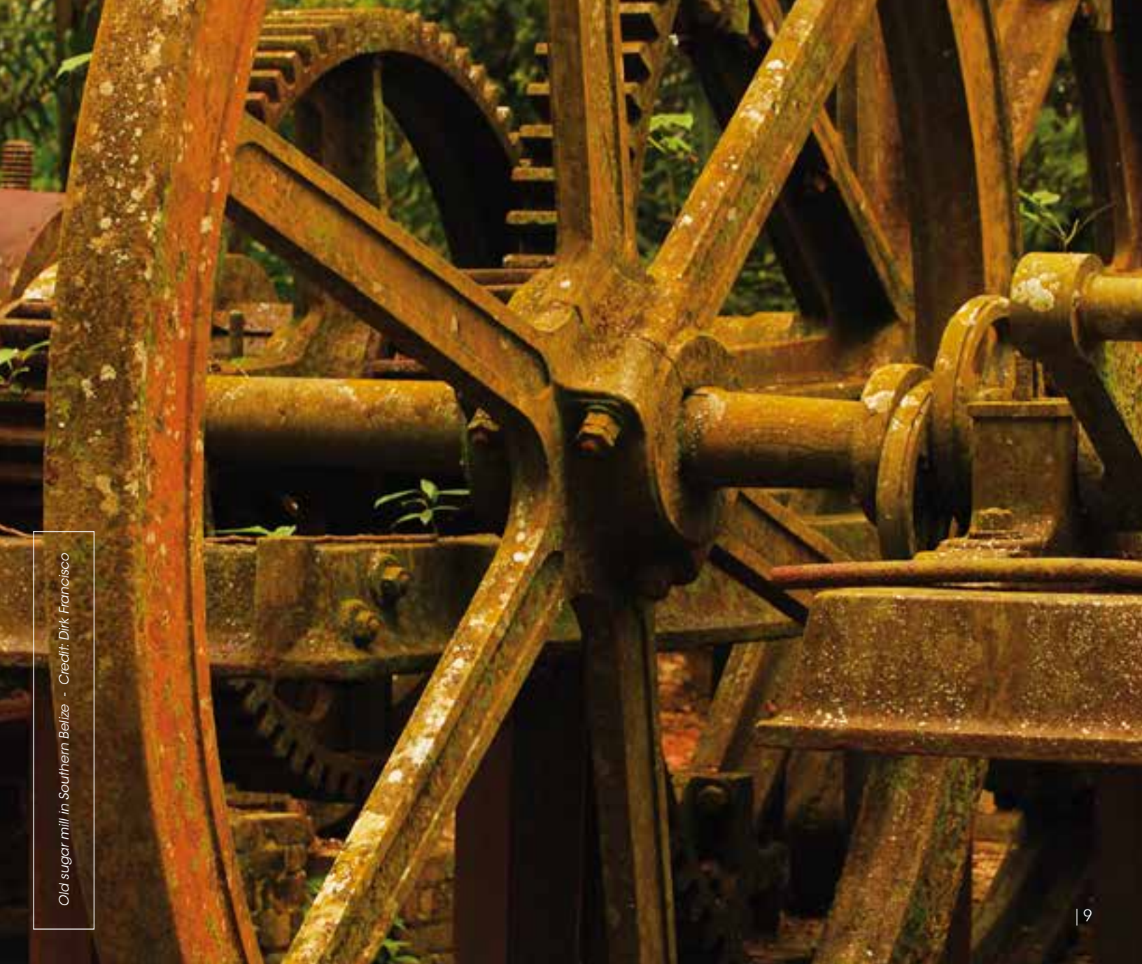
Old sugar mill in Southern Belize