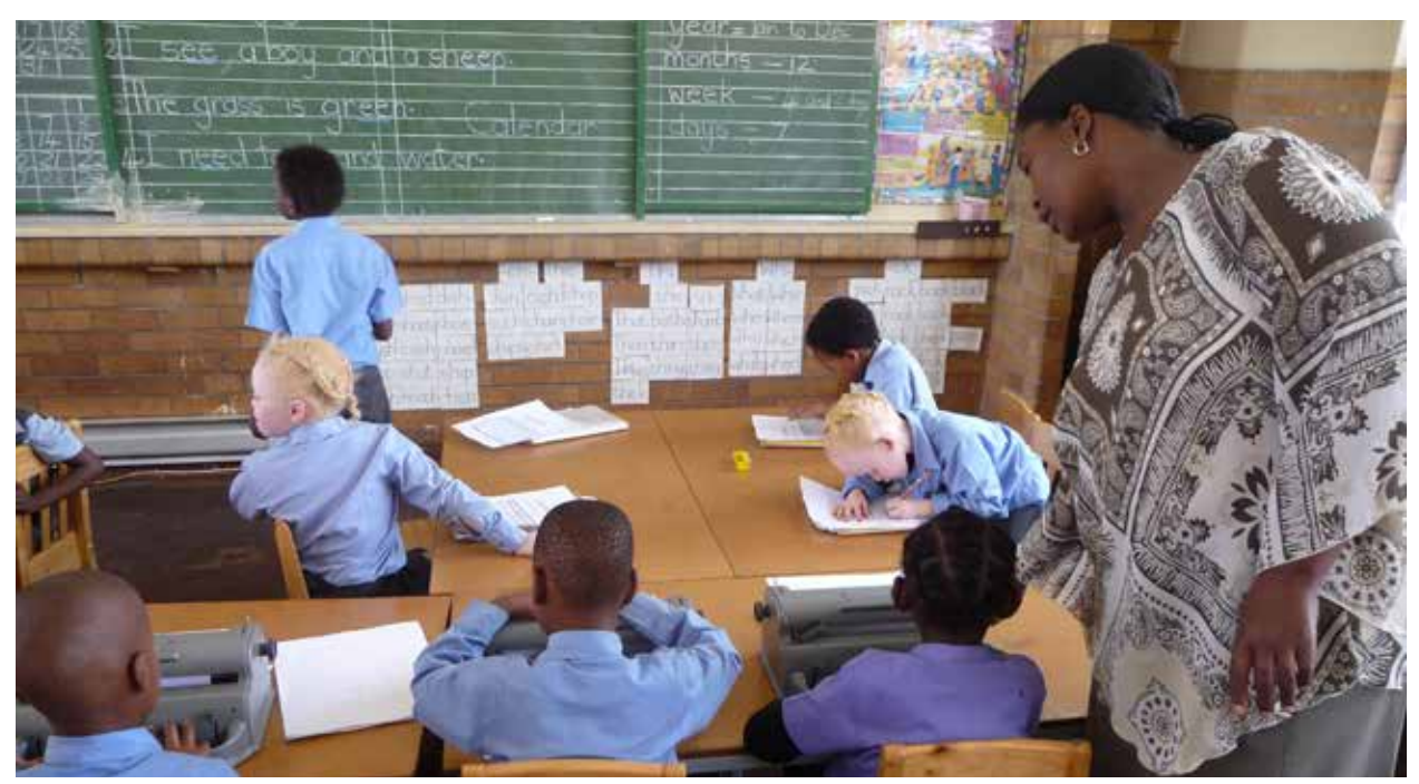
"Children in school, South Africa"