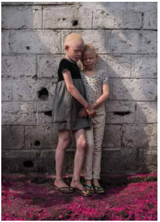
"Girls holding eachother, DRC"

Women suffer and children disproportionately. The Special Rapporteur on Violence against Women has identified HPAWR as a form of violence against women.163 For instance, myths around sexual intercourse expose to women violence, exploitative relationships, unwanted pregnancies, and sexually transmitted infections.<sup>164</sup> Traditional gender roles (e.g., fetching wood and water for women) and social isolation predispose women and girls with albinism to a higher risk of physical harm.<sup>165</sup> Women who give birth to children with albinism are also at risk of violence.<sup>166</sup> The ostracism and isolation of mothers of children with albinism increases the vulnerability of both mother and child to attacks.<sup>167</sup>