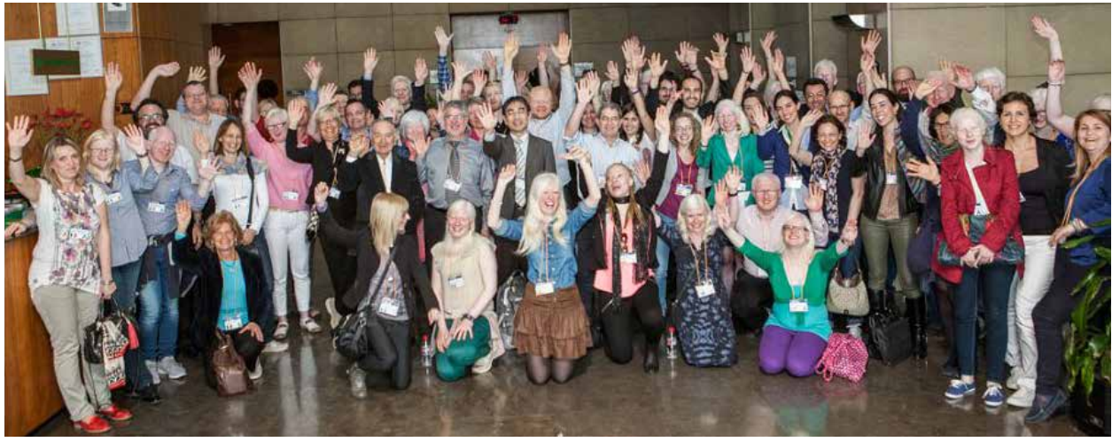
"Second European Days of Albinism Meeting"

In January, 2020, civil society groups representing people with albinism from six continents assembled in Paris, France, to lay the foundation for an international coalition to combat the attacks, stigmatization, and discrimination faced by people with albinism worldwide. By unanimous vote, these groups formed the first-ever Global Albinism Alliance.