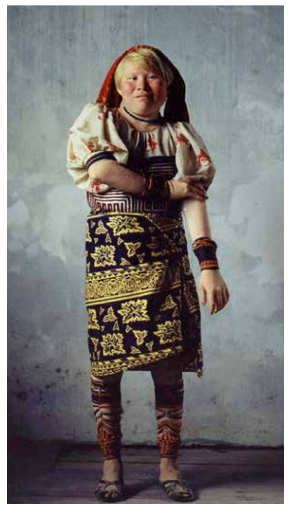
"Kuna Indian, Panama"

Albinism occurs in all racial and ethnic groups across the world, but the proportion of people affected by albinism in a given population varies by region. In Africa, the prevalence of albinism generally ranges from 1 person in 5,000 to as low as 1 person in 15,000. It has been reported that some selected populations in Southern Africa have prevalence rates as high as 1 in 1,000 people.