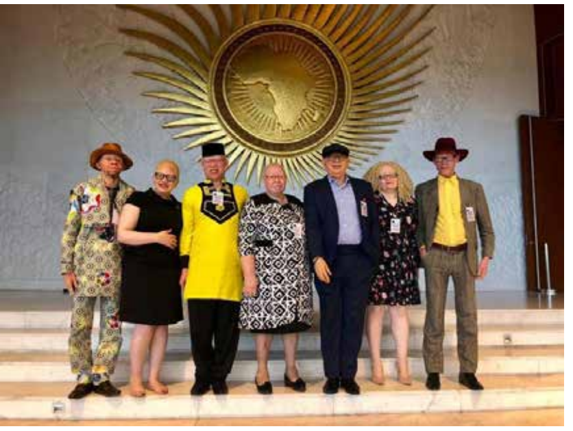
"Advocates at AU headquarters in Ethiopia"

In Tanzania, Standing Voice has developed a Vision Ambassador Training Scheme. through which 105 teachers have been trained to defend the rights of students with albinism and facilitate academic success for these students. Standing Voice has also developed a booklet on albinism and vision to help all teachers.<sup>577</sup>