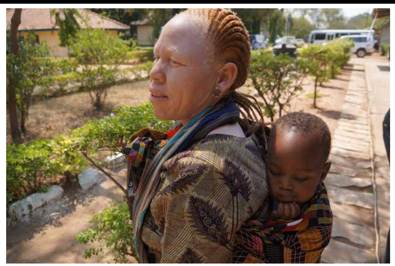
"Mother and her baby, Tanzania"

The weight of global suffering surrounding albinism is disproportionately borne by women with albinism and mothers of children with albinism. UNIE Ikponwosa Ero