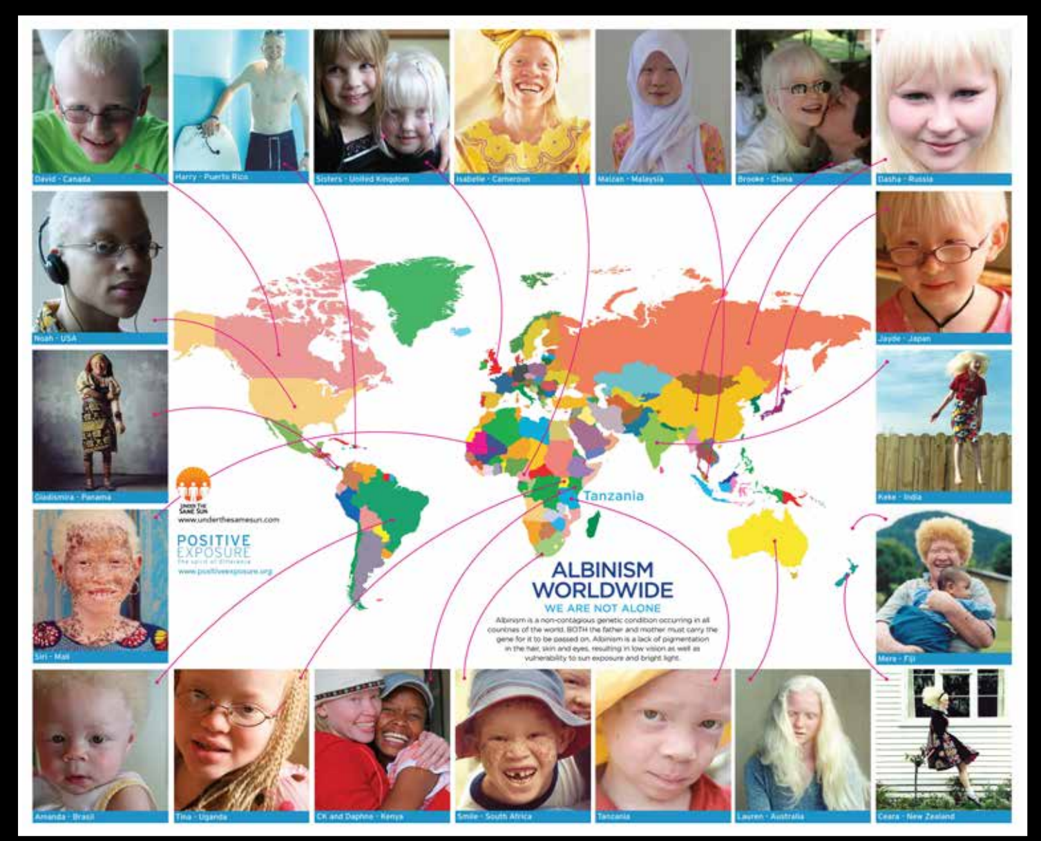
"Albinism Worldwide Poster" © UTSS