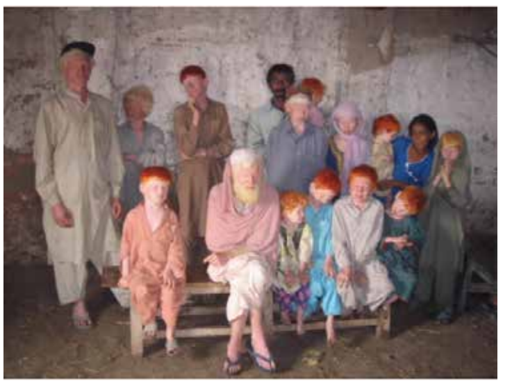
"Members of the Bhatti tribe, Pakistan"

costs of eyeglasses, contact lenses, optical aids, sunscreen and other sun protection, and screening services.<sup>440</sup> In the Bhatti tribe in Pakistan, people with albinism are exposed to high ultraviolet radiation but are unable to afford sunscreen or protective clothing, which leads to severe sunburns—a first step in the development of skin cancer.<sup>441</sup>