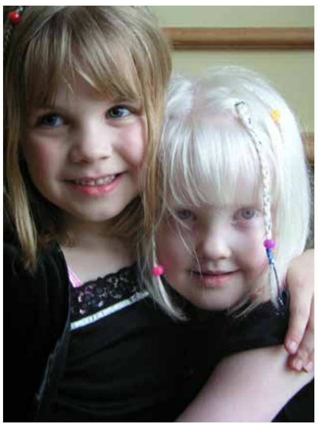
"Sisters, UK"

In much of Europe and Asia. reasonable accommodations and supports are guaranteed in law. However, in practice, students do not always receive these supports. In many European countries, for instance, accommodative devices and support are available for students with albinism through statute,<sup>318</sup> usually free of charge.<sup>319</sup> However, teachers are unaware of the needs of people with albinism as they relate to their visual impairments.<sup>320</sup> In Norway, the laws that ensure accommodation in school environments are difficult to navigate, and students struggle to obtain appropriate visual aids and other learning resources.321 In Slovenia, the process to request adaptive devices can be lengthy.322