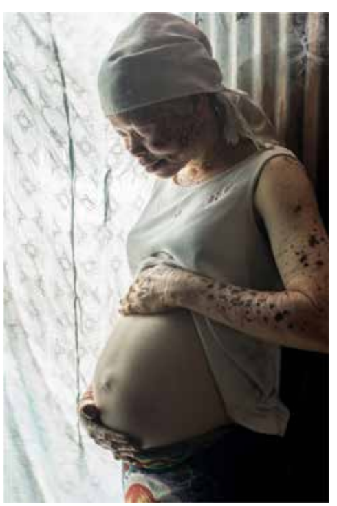
"Pregnant woman, DRC"

Women and children with albinism are more susceptible to violence and ritual crimes.<sup>525</sup> As discussed in Chapter 2 (Right to Life), harmful practices related to accusations of witchcraft and ritual attacks most often affect women and children. Women experience the highest rates of witchcraft accusations, and accusations against children are on the rise. As a result, they are more frequently attacked, abandoned, or banished.<sup>526</sup> Additionally, women and girls with albinism are more often subject to ritual rape<sup>527</sup> based on erroneous beliefs that sexual intercourse with a person with albinism brings luck and cures diseases. including HIV. In addition to the trauma of unwanted sexual intercourse, victims of ritual rape can also experience unwanted pregnancy, infection, and disease.528