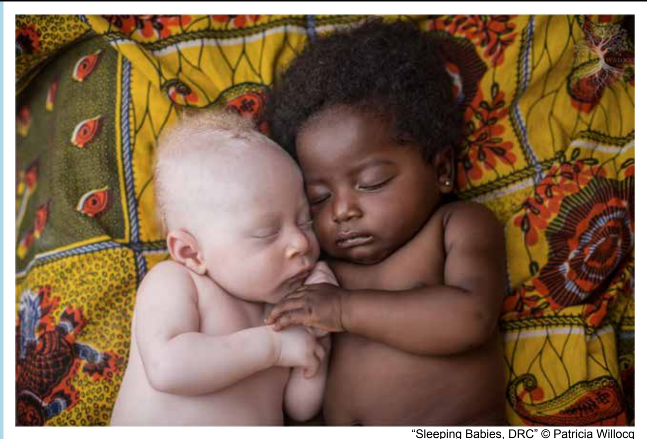
i. Human Rights Overview

Every human being has the inherent right to life. This right shall be protected by law. No one shall be arbitrarily deprived of his life. ICCPR, Article 6(1)