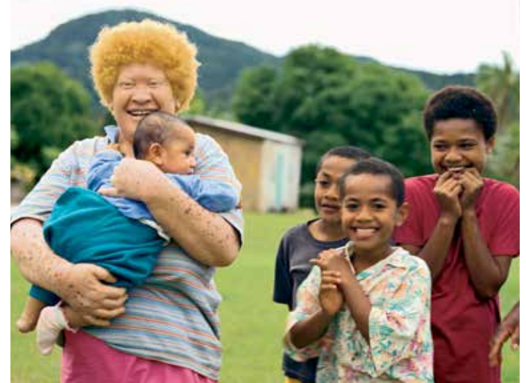
"Woman holding baby, Fiji"

society and among civil the government ministries responsible for health. education. and women's issues. While the Ministry of Health provides skin and clinics. civil eve society provides free sunscreens eveglasses, and the and Ministry of Education shares information on albinism.