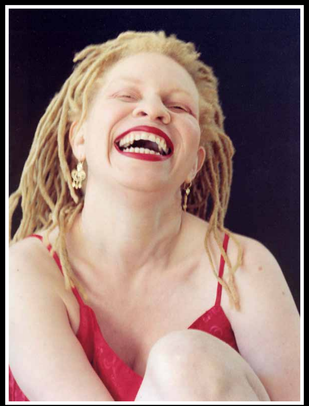
"Woman from USA" © Rick Guidotti