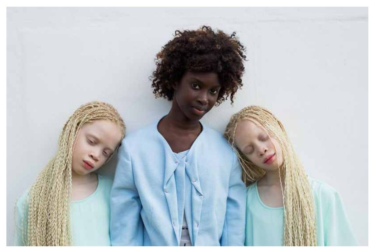
'Twins with their big sister, Brazil"

However, in many other countries, social assistance schemes are generally weak. In Nigeria, there is no inclusive financial benefit for people with albinism.<sup>402</sup> Even in countries where social security programmes do exist, people with albinism lack knowledge about how to access these benefits.<sup>403</sup> In Brazil, the social assistance program for people with disabilities who are unemployed, Benefício de Prestação Continuada (BPC), is relied on by many people with albinism. However, accessing the BPC program is difficult because people with albinism do not always meet the disability test. As a result, people with albinism often have to initiate a court process to receive the benefits.<sup>404</sup> In line with their responsibility to ensure the right to work and an adequate standard of living, governments have an obligation to ensure that social security programmes are robust and accessible to people with albinism.