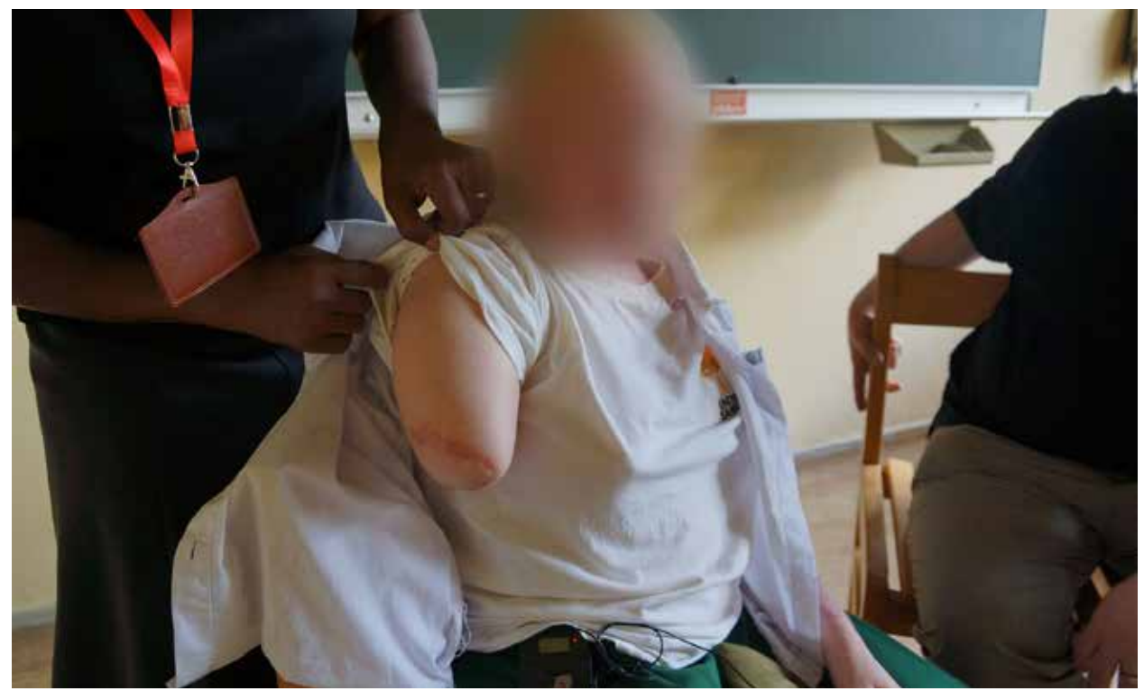
"Victim from attack"

Beyond muti and juju practices, the bodies of people with albinism are broadly believed to bring wealth and good luck and are therefore desired for use in various charms and potions.<sup>185</sup> People are kidnapped, attacked, murdered, and mutilated.<sup>186</sup> They are called derogatory terms such as "money," "pesa,"<sup>187</sup> and "deal."<sup>188</sup> Healers in Burundi "concoct potions" made from the limbs of people with albinism for their clients "in search of success."<sup>189</sup> In Mozambique, where the hair of people with albinism is believed to be gold, there is a growing business of stealing hair.<sup>190</sup> In Ghana, children are sacrificed for bumper harvest or rituals related to power and riches.<sup>191</sup> In Tanzania, these types of myths resulted in the murder of 76 people with albinism between 2006 and 2015.<sup>192</sup>