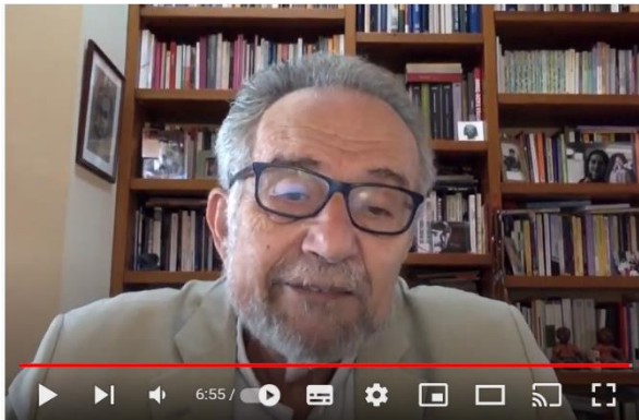
Presentation to the General Assembly 20 October 2021