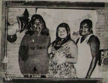
Vaja de sus relaciones Mentales y cobivida