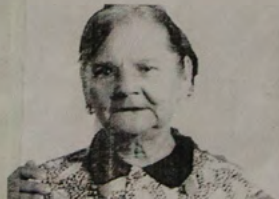
Se busca a la Sra. [Name] de mayo la Sra.