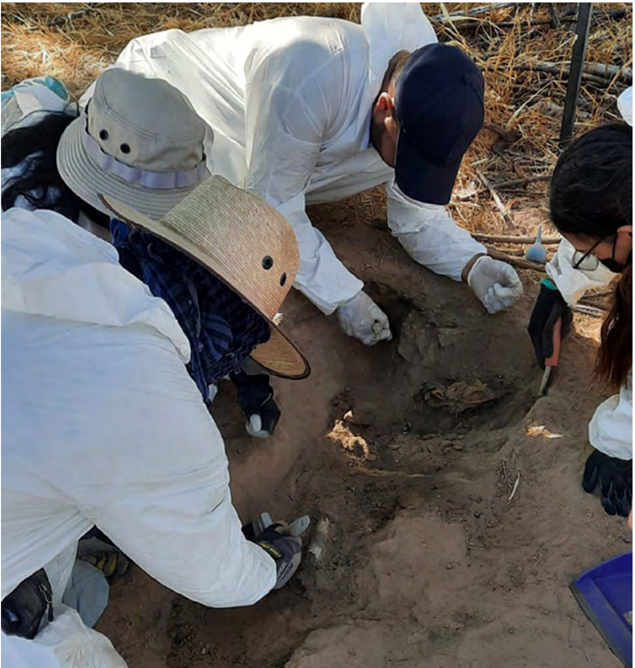
OHCHR Committee on Enforced Disappearances Secretariat photo

Under articles 31 and 32 of the Convention, States parties can make a declaration at the time of ratification or at any time afterwards to recognize the competence of the Committee on Enforced Disappearances to receive and consider individual communications (article 31) and inter-State communications (article 32). 61